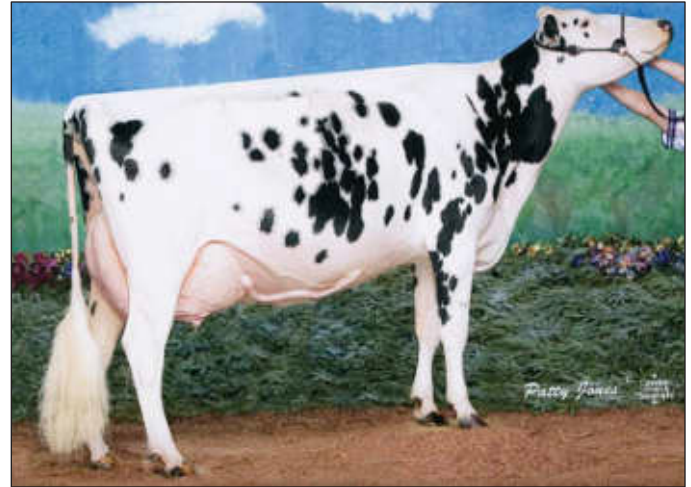
5th Dam Lot 114 TOMALYNN LEDUC DELLA (2E-95 1* CAN)