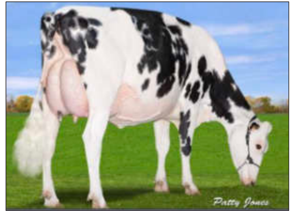
4th Dam Lot 114 MORSAN DEMPSEY DELLA (EX-94 CAN 95-MS)