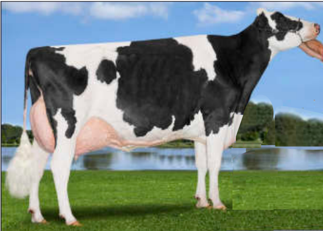
3rd Dam Lot 114 TOMALYNN AFTERSHOCK DENVER (2E-92 CAN)