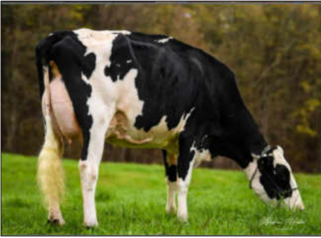
Dam Lot 114 TOMALYNN DENVER DARCY 99% (EX-90 EEEVE 3Y)