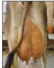
Maternal Sister to Dam Lot 103

81% 2Y JE840003206961209 1-09 305 11110 4.2 472 3.3 370 [EX-92 Maternal Sister 4th Gen Excellent] Pic Below