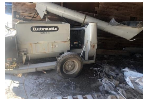
Automatic ATG 360-08 Roller Mill