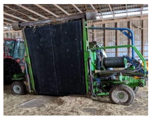
7010 Ag Bagger 10' w/ Dump table