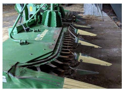
Krone 8 Row Corn Head