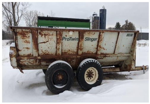
Knight 8030 Slinger Spreader