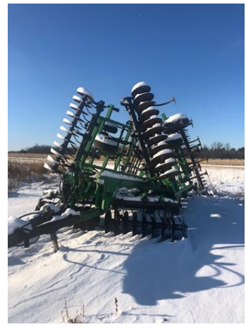
JD 726 Finishing Disc