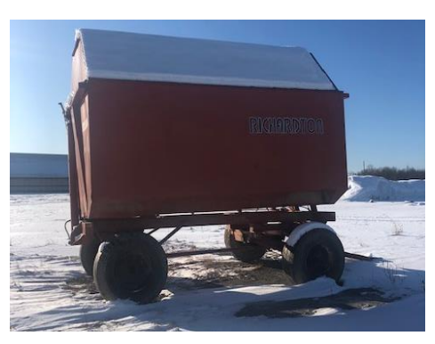
Richardton 750 Dump Wagon