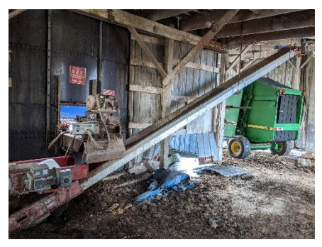
James Way Belt Conveyor