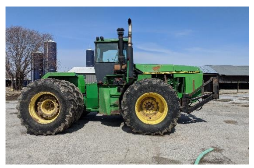
8770-300 HP 4WD, (1996)