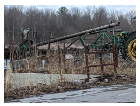
3 pt hitch hold for manure pump