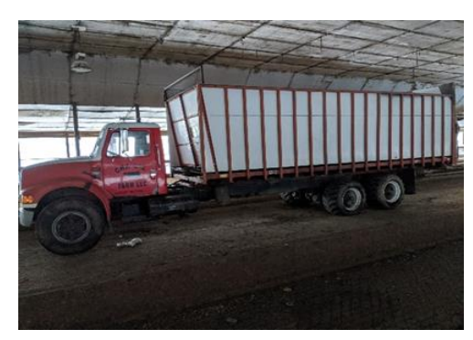
1991 Int. w/Meyer self-unloading box