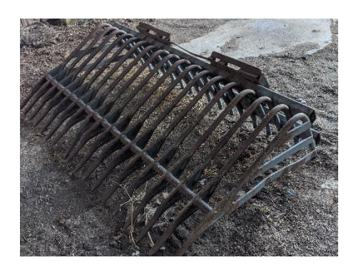
Rock Tines for Skid Steer