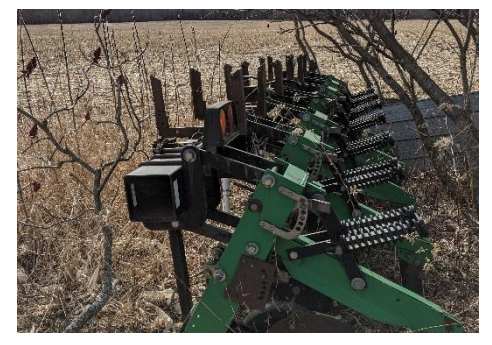
Sukup 6 row 3PT Hitch Cultivator