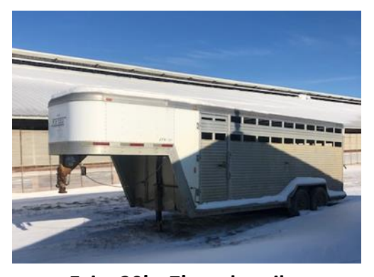
Exiss 20' x 7' stock trailer