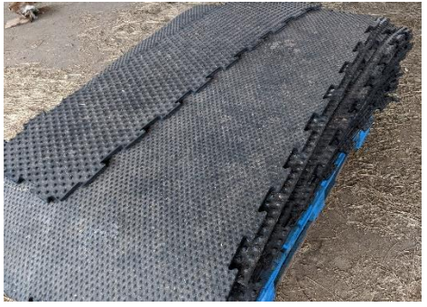
10x50 Parlor Floor mats (3 months used)