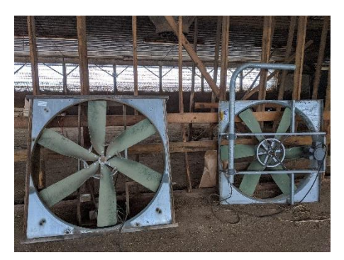
Two - 54 inch barn fans