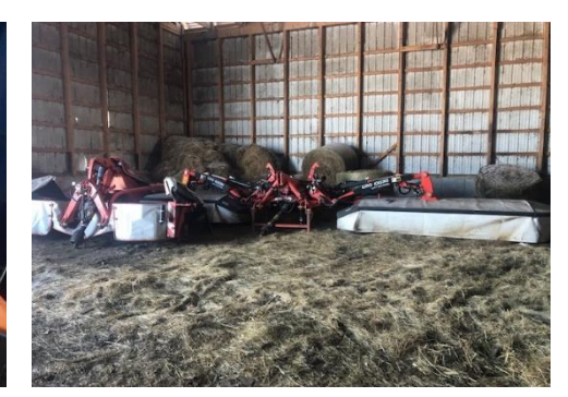
Kuhn 10030 Triple Gang Mower