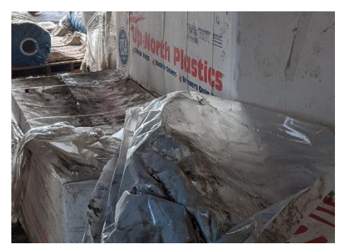
Ag Bags 10 & 11' by 150-200