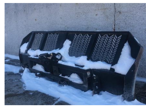
Rhino 3PT Push Blade