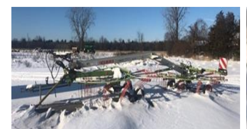
2014 Claas 750 Dual-Rotor Rake