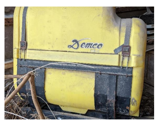
Demco Saddle Tank