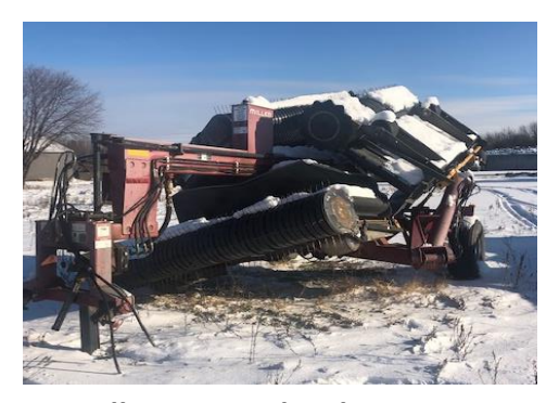
Miller 310 Avalanche Merger