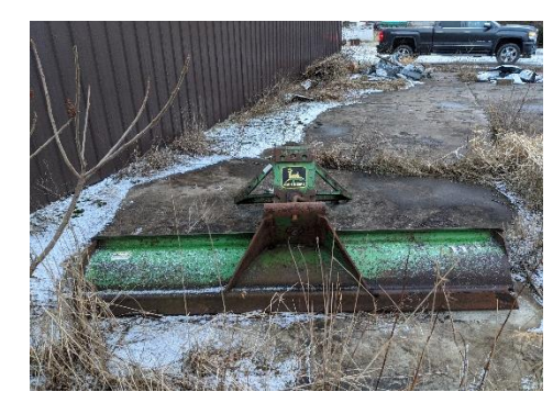
JD 3 PT Back Blade