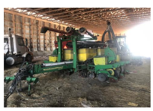
JD 1770 Conservation 12 row Corn planter