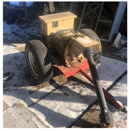
Generac 40KW Portable Generator