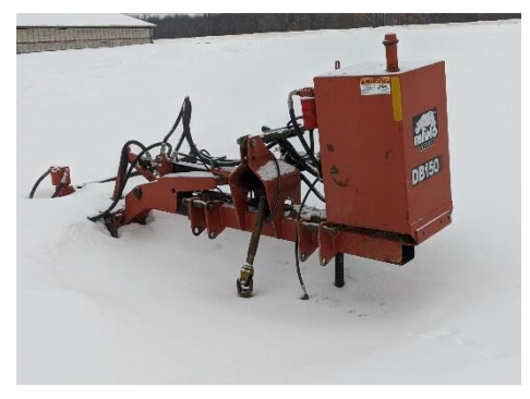
2012 Rhino DB150 Side Mower