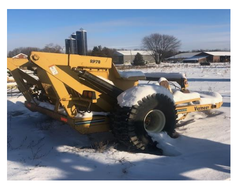
(3) Vermeer RP78 Rock Pickers!