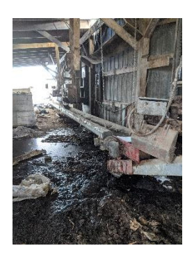
James Way Belt Conveyor #2