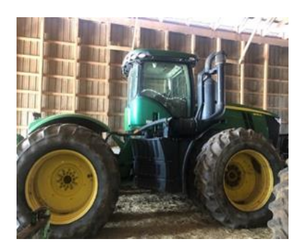
JD 9410-400HP 4WD Cab