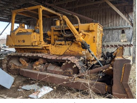
Fiat Allis 16B Bulldozer *needs new tracks