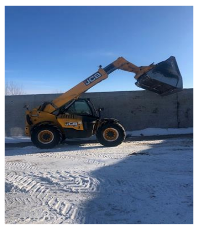
JCB 560-80 Telehandler