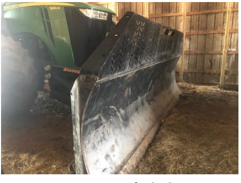
Grouser 16' Blade