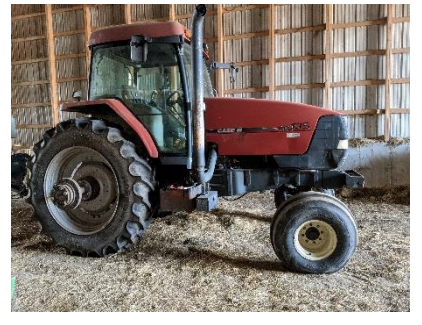
Case MX 135-130 HP 2WD