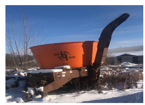
Farmhand Rotogrind 1090 Round Bale Grinder