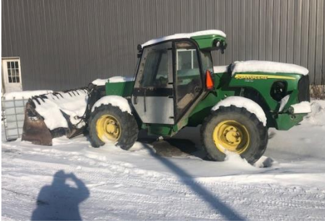
JD 3420 Telehandler