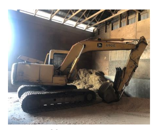
JD 490E Trac Excavator