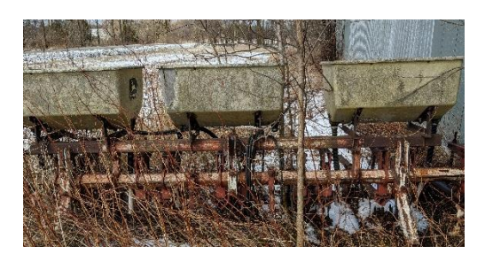
Six Row - 3pt Cultivator, JD Dry Fert.