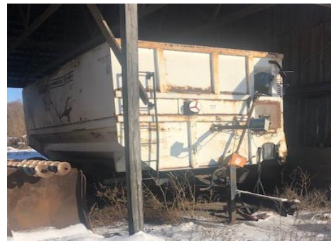
Roto-Mix 920-18 Mixer Wagon