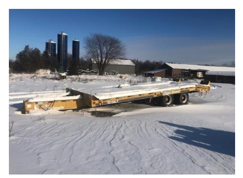
20 ton Eager Beaver Trailer