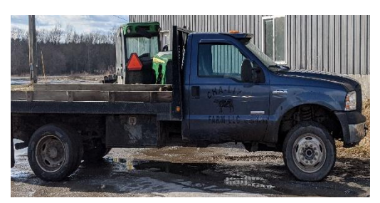
Ford F-550 Flatbed Truck