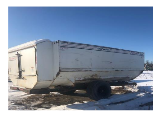
Roto -Mix 620 Mixer Wagon