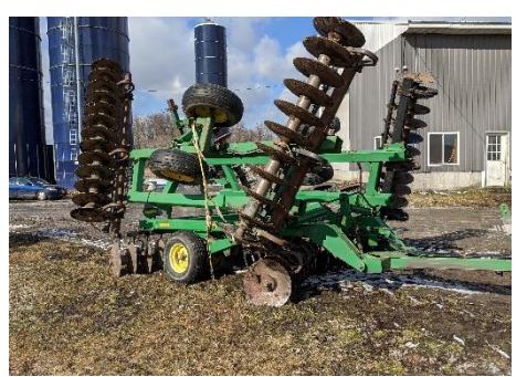
Rock Flex Wheel Harrows