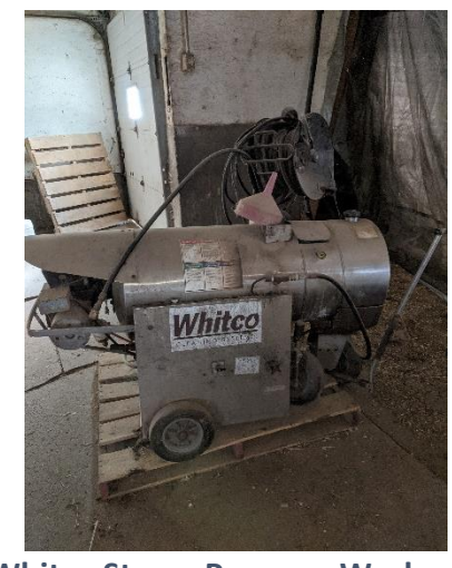
Whitco Steam Pressure Washer