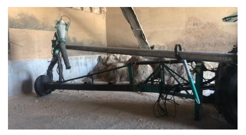
Houle 20' 3pt hitch Manure Pump