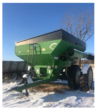
Brent 674 Grain cart