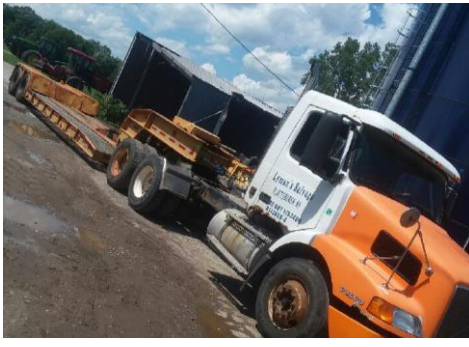
Volvo Semi w-Low Boy Trailer