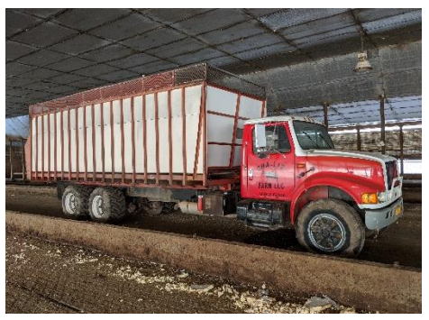
Int. 4900 with Meyer Silage Box 24' Live Bottom