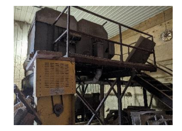
Integrity Solid Seperator