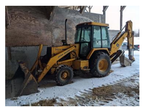
JD 310D 4WD Loader/Backhoe