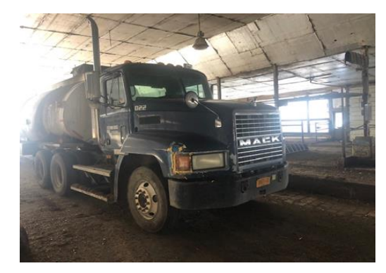
2000 Mack CH613 Semi