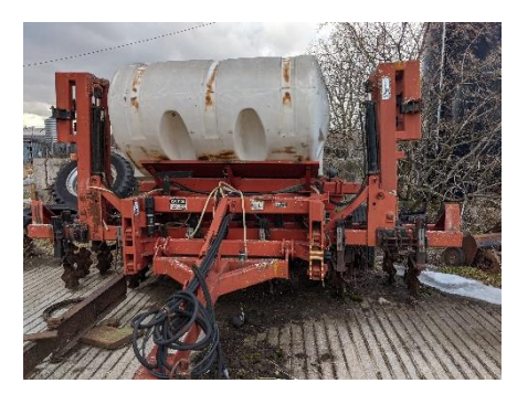
Unverfirth 8 Row Zone Till Cart