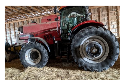
Case IH Puma 195 CVT