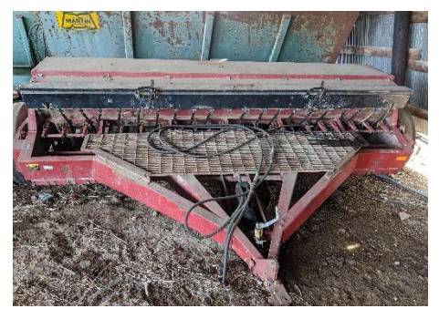
International 12' Grain Drill