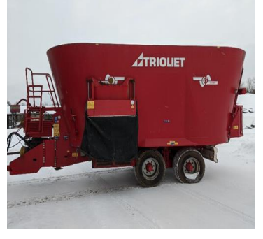
Trioliet SM2-3200 ZKXT Mixer