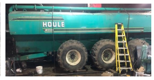
Houle 9500 Manure Tank Spreader