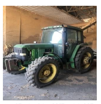
JD 6410 4WD-90 HP