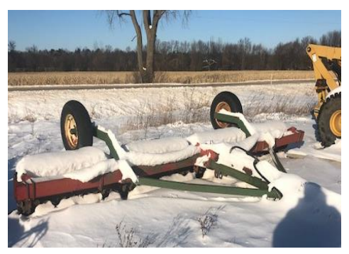
Brillion Roller 15'