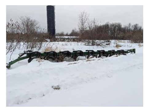
JD #3710, 8 bottom Plows