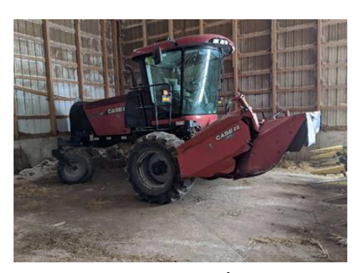
Case WD 1903 Mower w/RD-162 Head