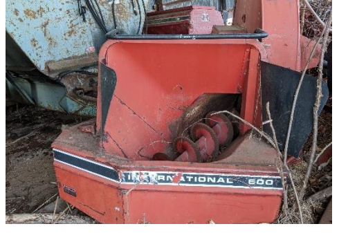
International Forage Blower (2)