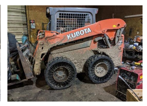
Kubota SSV65 Skidsteer