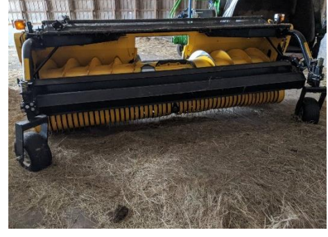
NH Hay Head