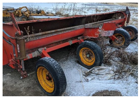
Stalk Flail Chopper