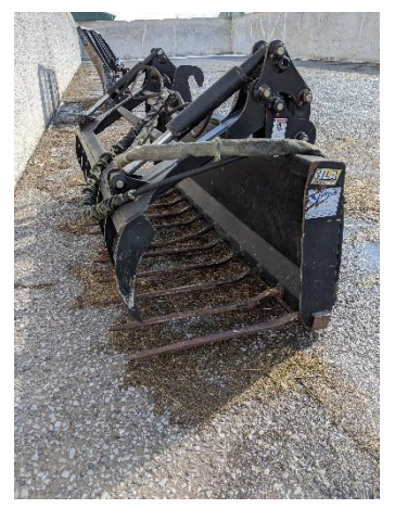
Quick Hitch Grapple for JCB Telehandler