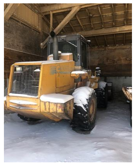
Case 621BXR Loader