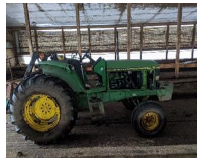
JD 6200-65 HP 2WD, w/ROPS