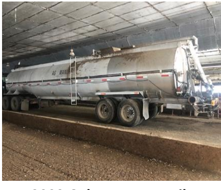
12000 Gal. Manure Trailer