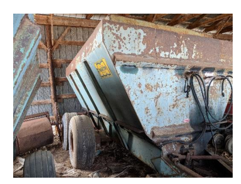
Martin Slinger Spreader. Rough condition