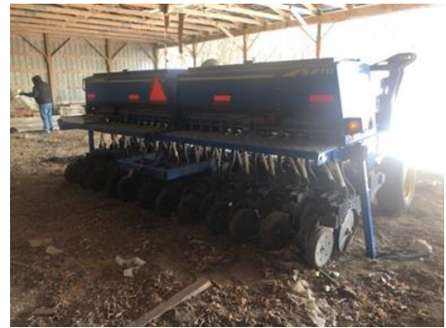
LANDOLL 5210 Grain Drill/Seeder