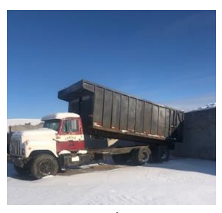
1992 Int. w/Dump Box