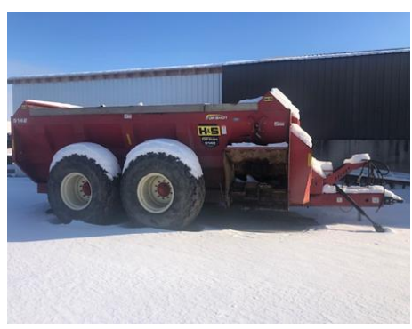
H&S TS5142 Manure Spreader