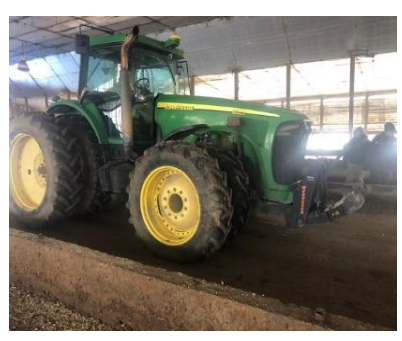
JD 8320 4WD w/GPS -210 HP