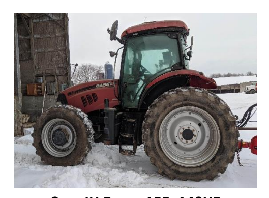
Case IH Puma 155, 140HP