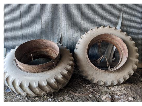
18.4 x 38 Dual Wheels