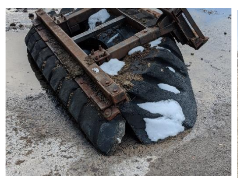
Alley scraping tire