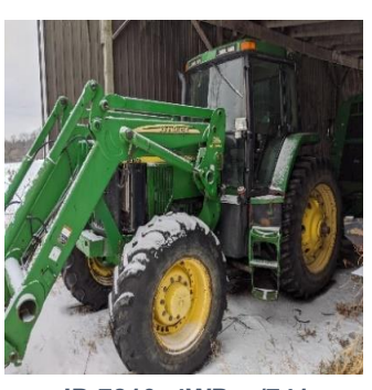
JD 7810, 4WD w/741 Loader