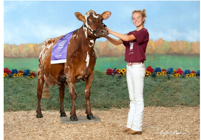
River-Valley Cowboy Bethany EX 92