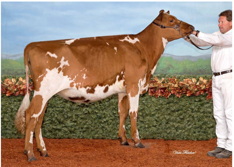
West Meadow Dingmac Dream Elly Maternal Sister to the Dam of Lot 14