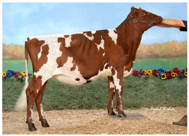
Kozy Kountry Dimya VG 87 Dam of Lot 6