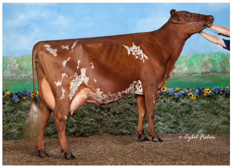
Spring-Vale Burdette Apple EX 91 Gr Grand Dam of Lot 1