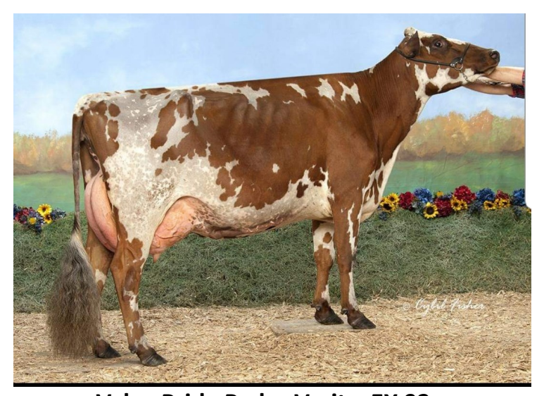
Vales-Pride Pedro Verity EX 92 Grand Dam of Lot 9