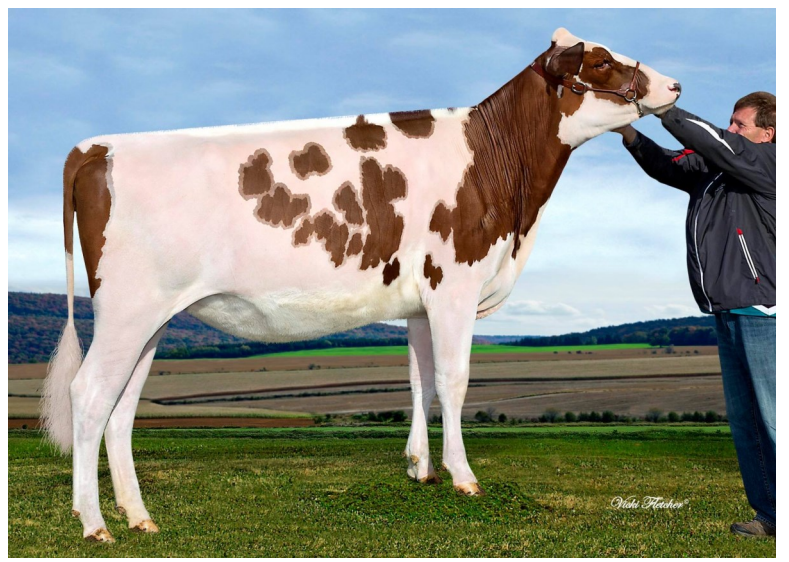
West Meadow McKenzie VG