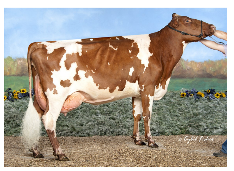
Jomill CD Aurora VG 88 Maternal Sister to Dam of Lot