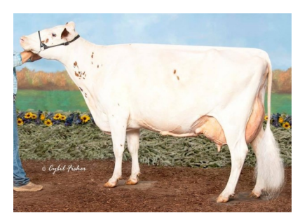
Jomill Poker Keegan EX 94 3E Dam of Lot 12