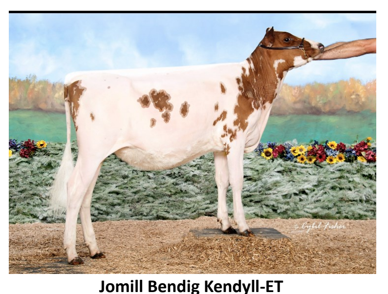
Full Sister to Lot 12