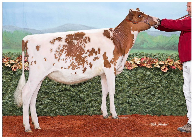
West Meadow Dingmac R Elegant Dam of Lot 14