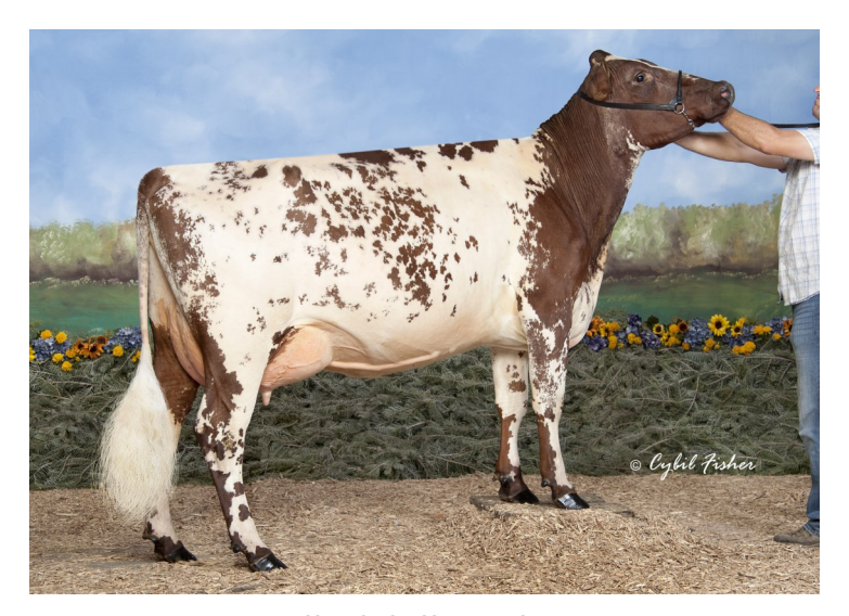
Jomill Lilyhill Ariel EX 90 Grand Dam of Lot