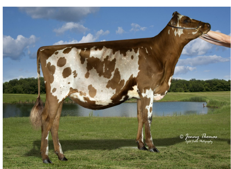
Jomill Burdette Kalliope Maternal Sister to Lot 12