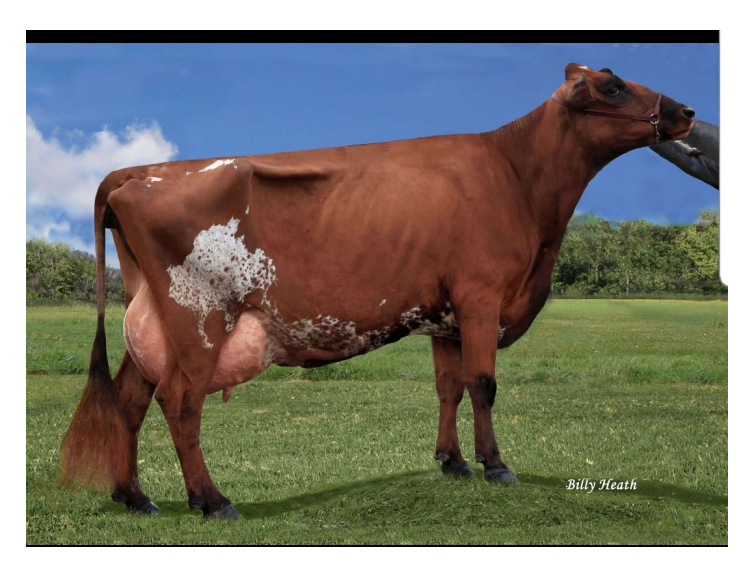
Vales-Pride Burdette Valentine EX 91 3rd Dam of Lot 9