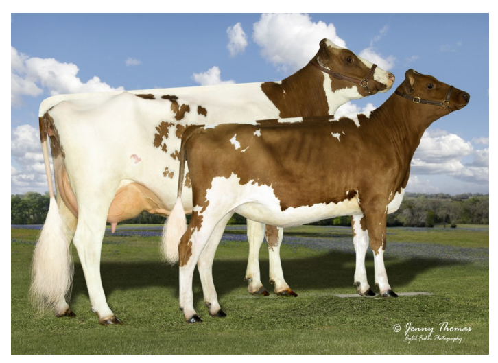
Mowry Plum-Bottom S Paris-ET EX 92 Plum-Bottom Drew Precious VG87