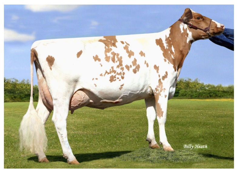
Plum-Bottom Dazzle Pazzle Maternal sister to Lot 15