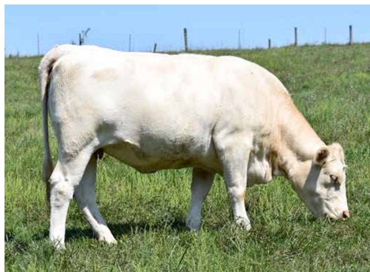
CS LAWANDORDER G327 SELLS AS LOT 21