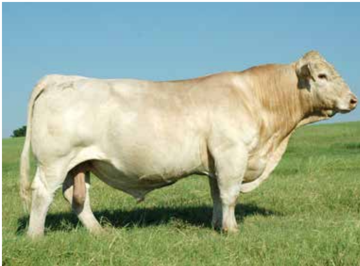
SR/NC FIELD REP 2158 P ET SIRE OF LOT 41