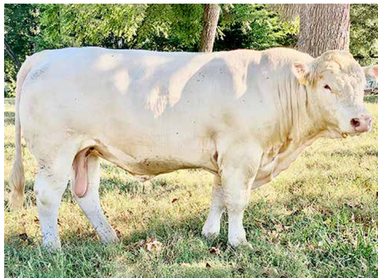
WC REPUTATION 9238 P SELLS AS LOT 5

Selling Full Interest and Full Possession. Fertility and Trich Tested. EPDs rank in the top 4% for both Milk and MTL. His sire, 7227, is a full sib to CCC WC Resource 417, one of the more popular bulls in the breed. His dam is a 7/8% sib to WC Uncharted that sold for $125,000 in the Wright sale. This very correct, stylish bull offers tremendous pedigree and performance. A real herdsire to lead a program to the top!