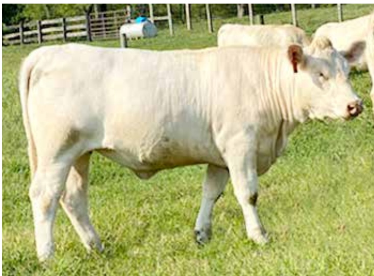
CS MS TANK G10D SELLS AS LOT 17

16A: Pld bull calf born 9/9/20, sired by Muddy Creek Max 99 Pld ET, EM941257. A beautiful and very correct udder on this outstanding full ET sib to Lot 15. Max is a JDJ Maximo A18 P, (homozygous Polled bull), and out of a daughter of RE Ms Duke 34, all-time great donor at Evans', TX herd and sired by Duke 914, a super blend! These two full sibs are "peas in a pod" in all aspects, conformation, size, eye-appeal, and correctness!