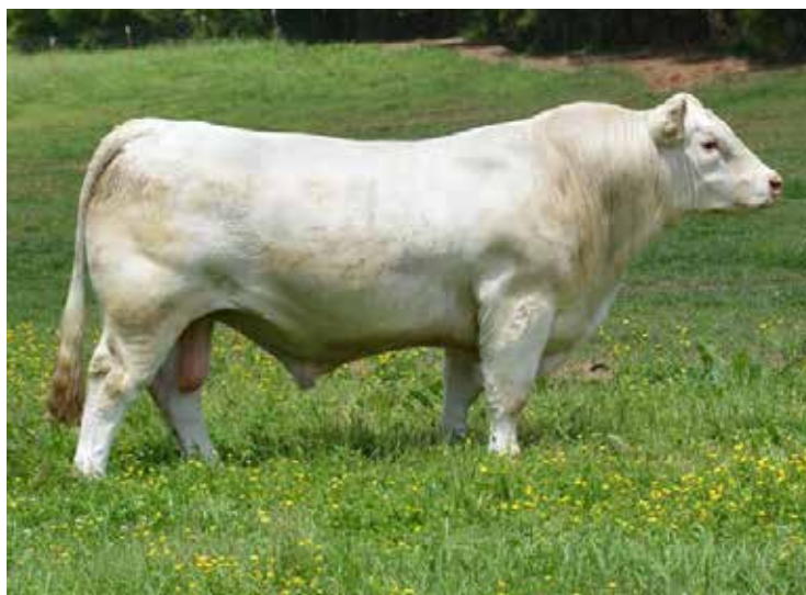
JDJ MAXIMO A18 P SIRE OF LOT 38