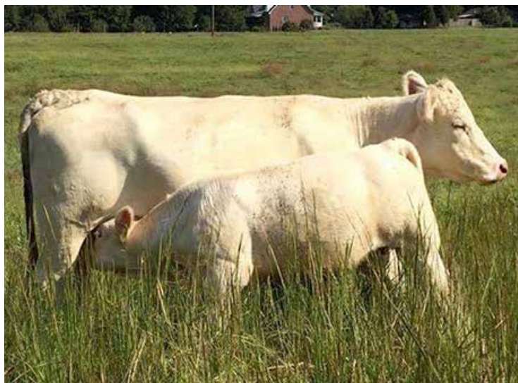
FARAWAY ALMA JEAN 48B SELLS AS LOT 32

Pld bull calf, #487H, born 6/14/20, bw 90, sired by Faraway Ajax 487H, a Kartos son; PE from 8/1/20 to 9/19/20 to MCF Kratos E600. Big, deep-bodied, good udder quality daughter of Faraway Shoshone. Her dam was a high seller to Circle M, in a previous Appalachian Classic sale. Alma Jean is also a double bred Grid Maker through the Chico bull that did such a great job for us. Very balanced EPDs ranking close to average in all traits.