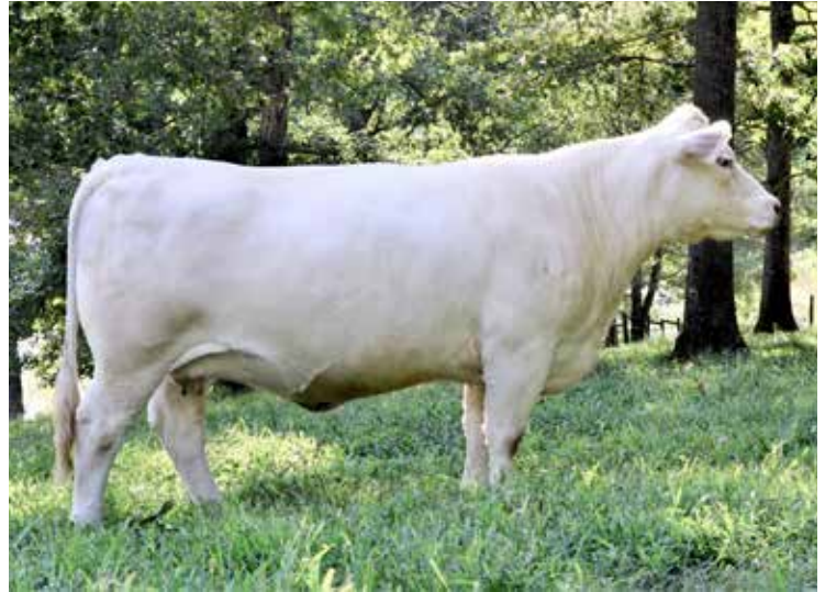
OHF VANNA WIND C901 DAM OF LOT 45

45A: Pld bull calf born 9/11/20, sired by JDJ Maximo A18 P, the homozygous Polled bull. Another great young Cigar cow from Oak Hill. She also descends from Vanessa D029. Her dam, C901 works for Cawley Cattle Co., GA and her Dam, 479 is in Bamboo's elite ET program. This will also be a cow easily to promote with this pedigree. The Cigar influence in the breed is unmatched. He is even in the pedigree of the popular TR Firewater 5792R.