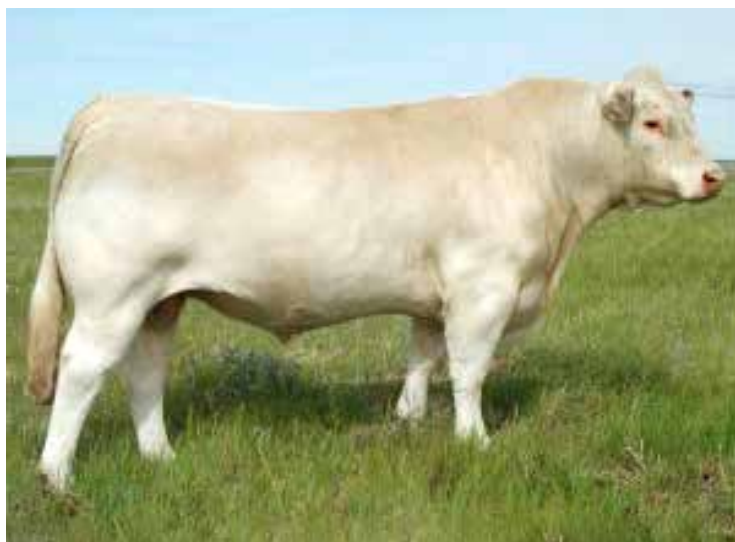
LT LEDGER 0332 P SIRE OF LOTS 39 & 40