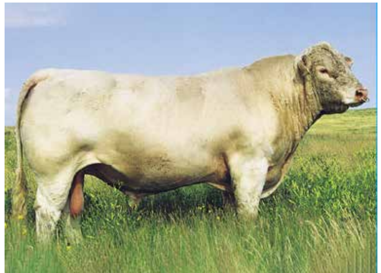
LT WYOMING WIND 4020 PLD SIRE OF LOT 47

47A: Pld heifer born 9/3/20, sired by WC Uncharted 7328 P, the $125,000 bull sold at Wright Charolais, MO. Lot 47 is a full sib to Lot 46 and her ET bull calf. Wind sired some great looking daughters that crossed well with many different bloodlines. They are very feminine, clean-fronted, and moderate in frame. The heifer calf at side could possibly be a top show prospect with her sire's lineage!