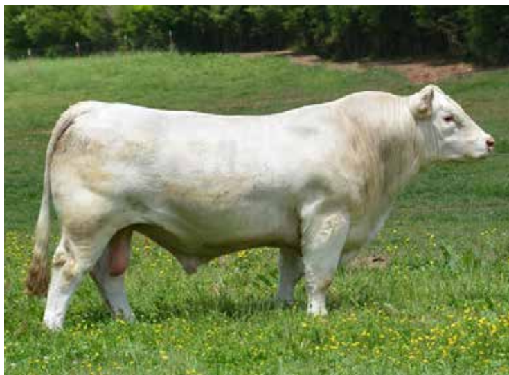
JDJ MAXIMO A18 P SIRE OF LOT 51

DUE 9/26/20 to OHF Ledger 8910, M920355, a son of CMF 4Z Ledger 42B, a LT Ledger 0332 son out of the OHF Windy E904 ET donor cow, who is also the dam of lot 48. With just an actual Birth weight of 72 lbs and very stout, balanced numbers, this young, first calf heifer will add tremendous longevity, soundness, the homozygous polled genetics of Maximo to your program. Fasttrack adds extra dimension of milk and calving ease.