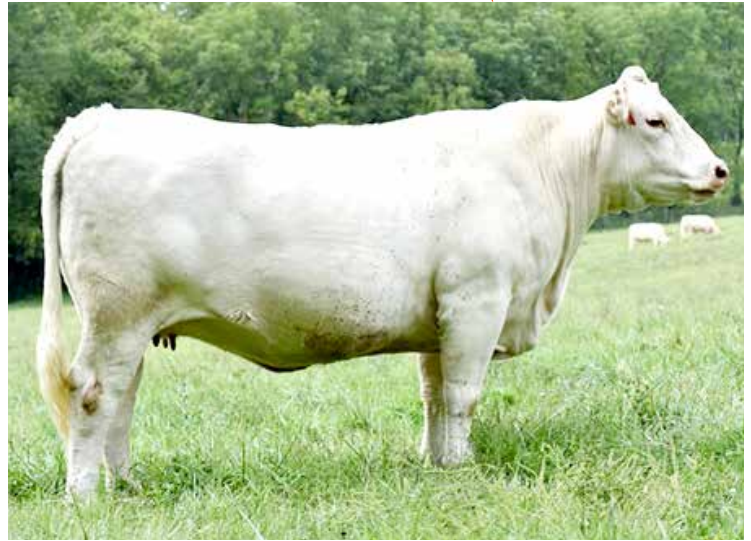
AKF JOLI JANINE 10D SELLS AS LOT 18

Bred A-I on Sparrows Braxton 519C on 6/1/20; PE from 7/6 to 8/14 to Steppers Legacy 28G, M941111. Legacy is a son of Sparrows Braxton 519C. A very strong growth and maternal line with this pedigree and reinforced with Milk and Maternal with King Grazer 25A. Her real proof of ability in with her daughter selling as Lot 17 by Tank. Notice that daughter weaned at 695 lbs. for a 103% with 8 contemps.