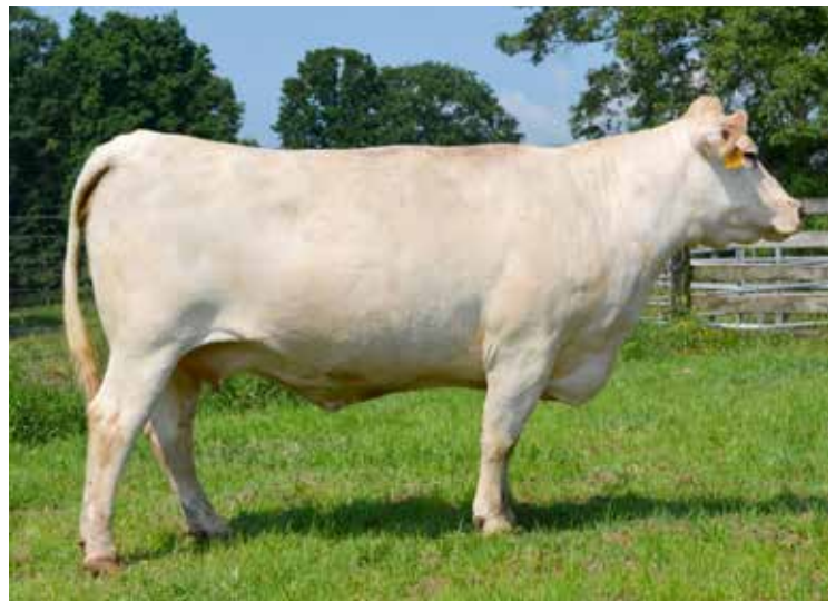
OHF OAK LADY C902 DAM OF LOT 46

46A: ET Bull calf at side from mating of LT Wyoming Wind 4020 Pld x OHF Oak Lady C902, born 8/11/20. This unique ET bull calf will be a full sib to H812! You're getting a very quality product with both the ET herdsire prospect and the PB Recip cow in this lot. When Wayne is putting in embryos, most any cow open, regardless of how good she is, gets an embryo implanted!