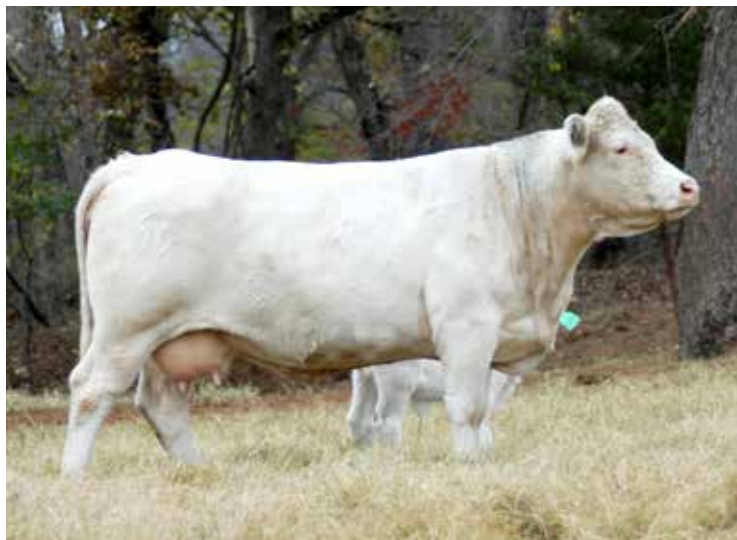
BHD MS CIGAR S235 DAM OF LOT 56