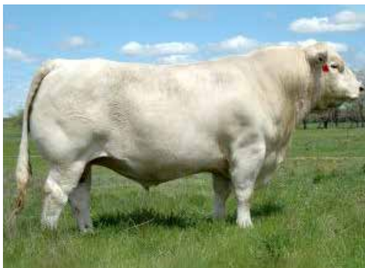
LT BLUEGRASS 4017 P SIRE OF LOT 60

Due 12/7/2021 to ACE-ORR Lock and Load 243 P. If udder quality and body is something you desire look no further. 1748 ranks in the top 25% for WW and 35% for YW while stemming back to the foundation female 745 for the Lehmann Cattle Co. as well as her dam the 34 cow which has made her mark as an elite donor at Evans Charolais, TX.