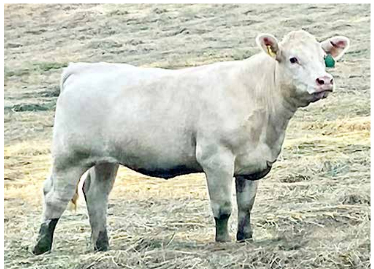
JBC MS Y757 MAXIMO 913 P ET SELLS AS LOT 25