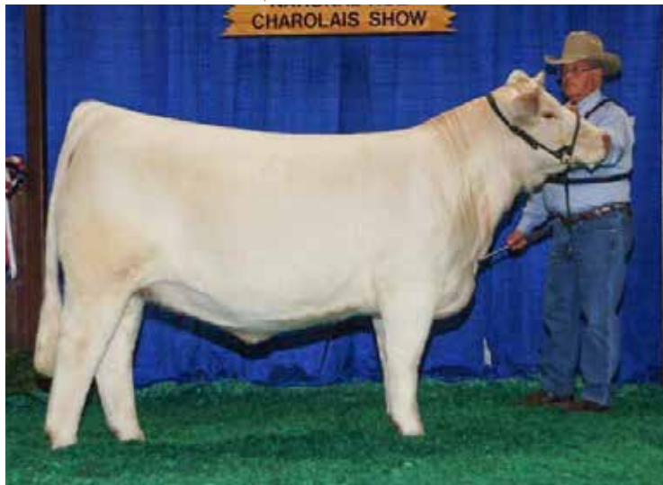
FARAWAY MAGIC DOLL 176 DONOR DAM OF LOT 33 EMBRYOS