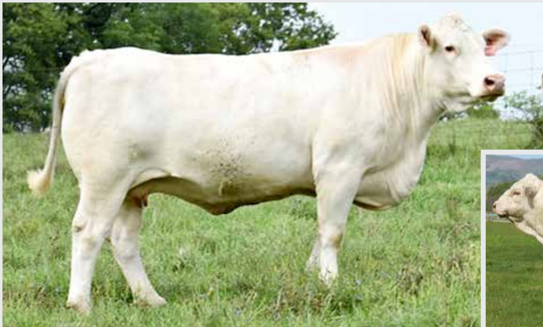
HF MS DESIREE D8852 SELLS AS LOT 19 & DONOR DAM OF LOT 19A EMBRYOS