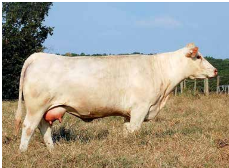
OHF VANNAR G1223 P DONOR DAM OF LOT 34 EMBRYOS