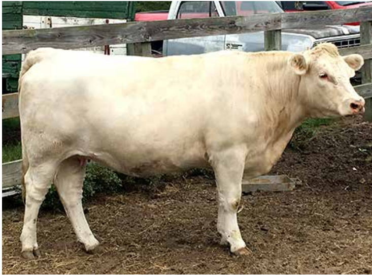
SCF LADY LEDGER 1808A ET SELLS AS LOT 15