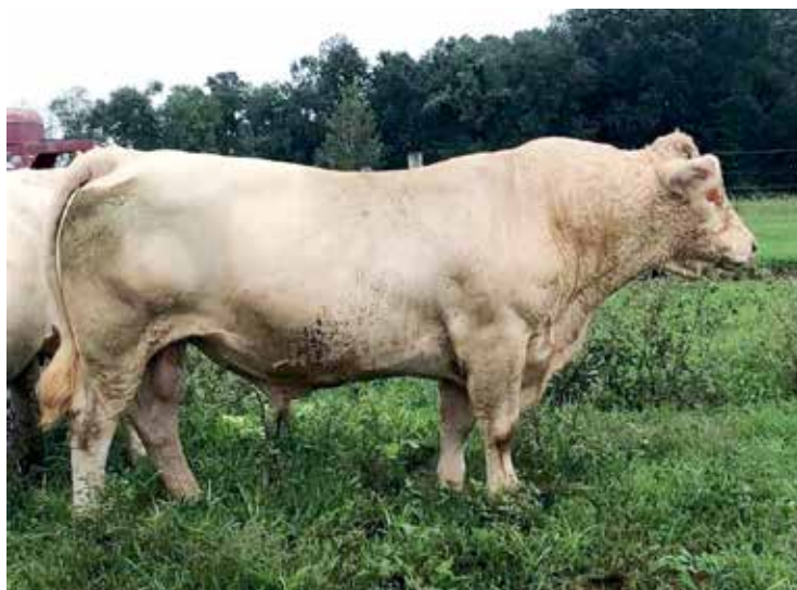
MCF KAROTS E600 SIRE OF LOTS 30-33 CALVES