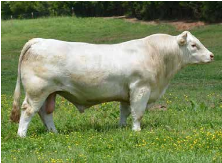
JDJ MAXIMO A 18 P SIRE OF LOTS 24-26