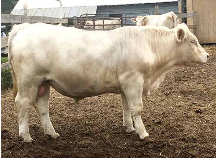
MUDDYCREEK PRESIDENT PLD SELLS AS LOT 1