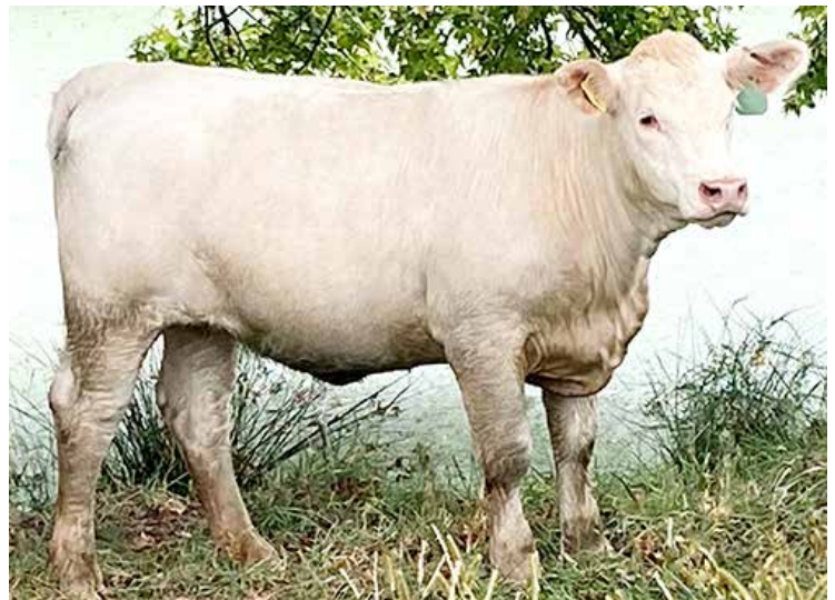
JBC MS Y757 MAXIMO 904 P ET SELLS AS LOT 24