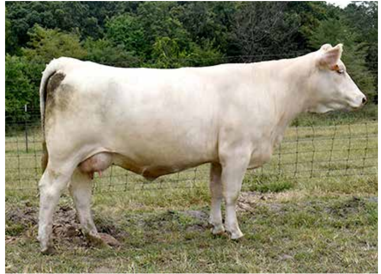
LCC 7M SAMANTHA 1097 SELLS AS LOT 62

Bull Calf born 8-20-2020 sire by M6 Pinnacle 712 Pld ET. A direct daughter of CCC WC Resource 417 P stemming back to the infamous Baldrige Sweetheart 7M which has been a corner stone for Cody Cattle Company and Wright's Charolais. Her dam is a feature donor at Double H Charolais, M and M Savannah 9009 PLD ET who full sister to 9509, a foundation donor for Polzin Cattle Company. Here is an opportunity to invest in a donor with look, maternal, and marbling, while maintain an exceptional phenotype.