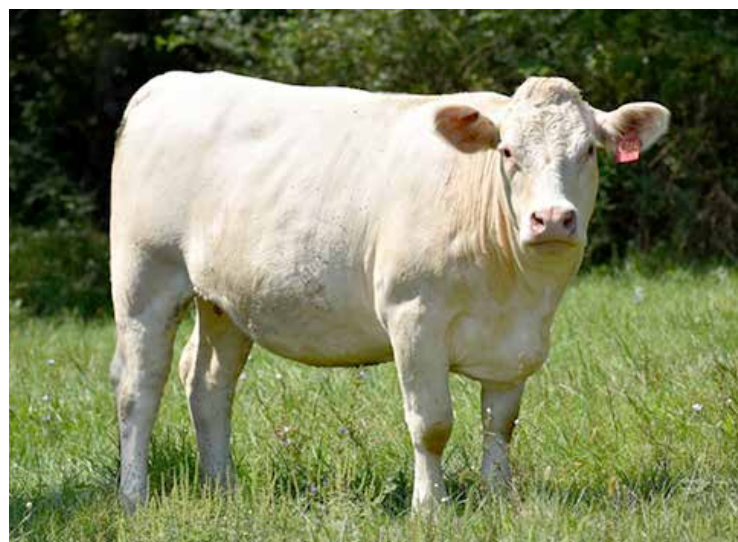
CS MS DUTTON F506 SELLS AS LOT 22