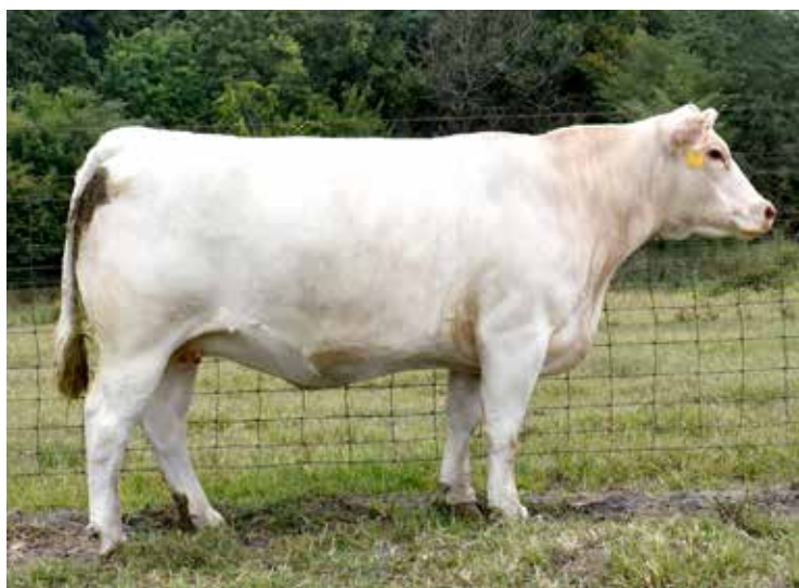
JDS FLASH MARY SELLS AS LOT 61

A direct daughter of the Legendary female sire LT Bluegrass 4017 P with added balance as eye appeal while maintaining a CE ranking in the top 15% and ranking in the top 20% for BW and Marb. 6447 is sure to be a major addition to any herd for her balance and calf raising ability.