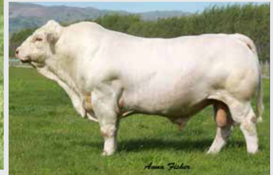
SILVERSTREAM EVOLUTION SIRE OF LOT 19A EMBRYOS