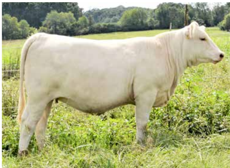
REAVES MS LUCY 940 SELLS AS LOT 9