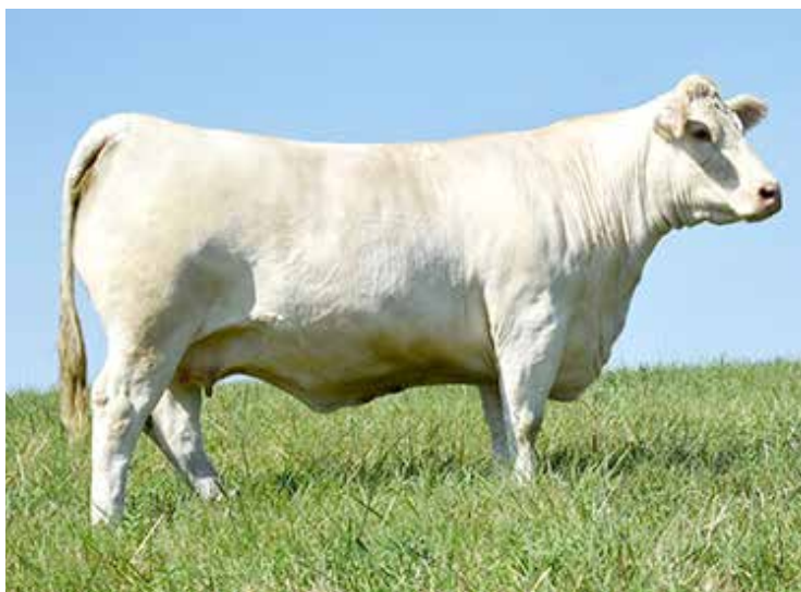
MV 2070 SIR LADY CIGAR 311 DAM OF LOT 13

13A: Pld Bull calf, born 5/10/20, sired by M6 Law & Order 577 P. Dam was a high selling lot in a Southern Connection sale out of the great Cigar cow 2070 that also topped that sale along with a full sister to 311 going to Bruce Roy, LA. 311 has a very enviable calving record, 1/14; 2/15; 2/16; 2/17; and 2/18. Good solid EPDs enhance this very strong pedigree!