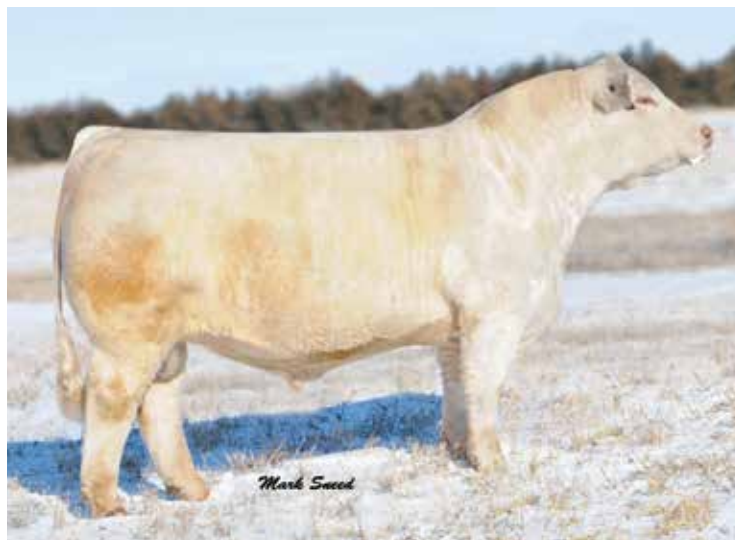
TR PZC RAPID FIRE 9775 ET SIRE OF LOT 68

Selling Full Interest and Full Possession. Fertility and Trich Tested. Tremendous pedigree on this top consignment! From the many time Champion sire, Rapid Fire, the outstanding maternal ability of the Smokester's for great milking ability, and the very popular and productive Rich Lady that has been a source of many sale toppers. Rapid Fire is out of the 0641 donor that has a record 307 calves registered with AICA.