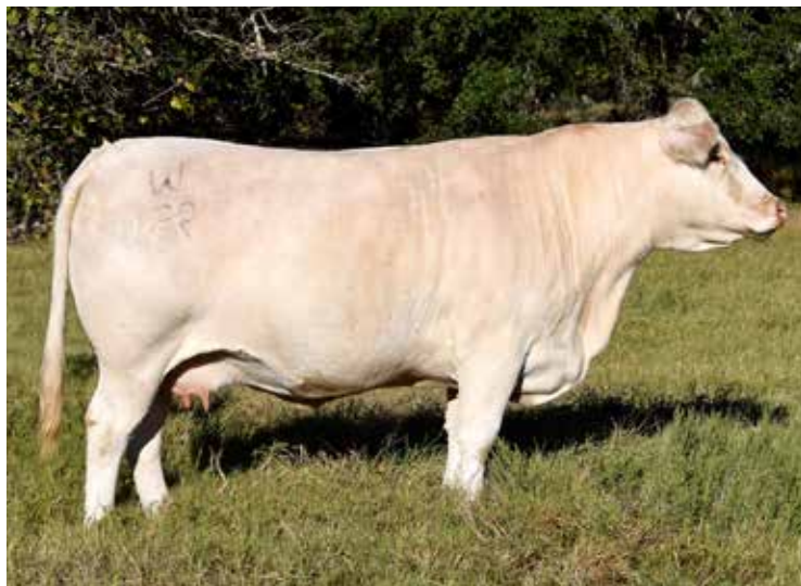
BHD DS RACHEL ALEX 950 ET DAM OF LOT 20