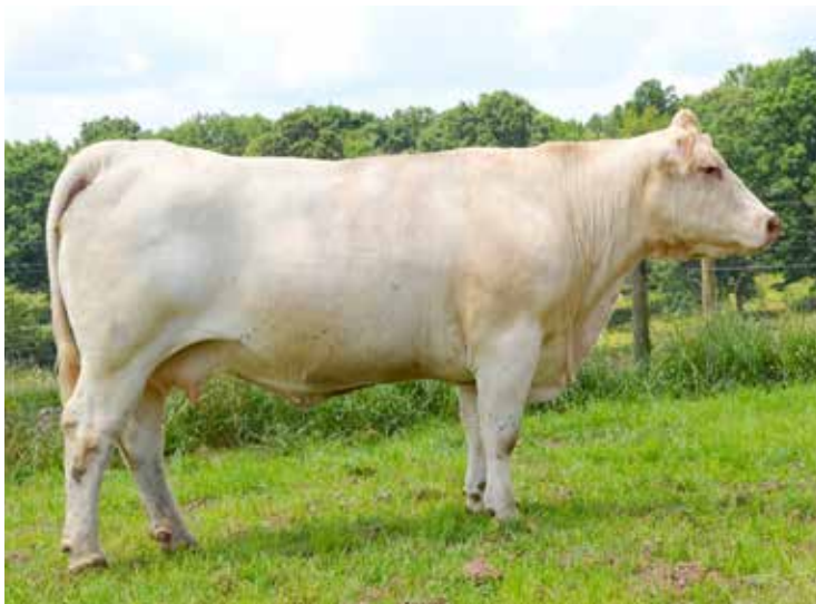
OHF LADY J227 P DONOR DAM OF LOT 49 ET CALF