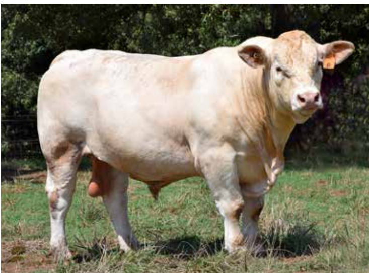
CMF 4Z LEDGER 42B SIRE OF LOT 50