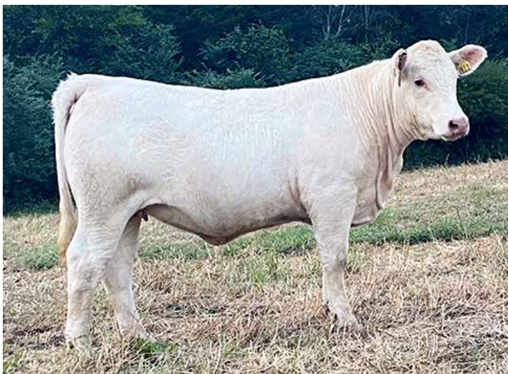
JBC MS EQUITY 911 P ET SELLS AS LOT 28

Selling Choice of lot 27 & 28, full ET sibs, sells Open. The dam, Ms Max Cigar 509 was highly sought after in the VA Tech's Harvest sale, with Buzhardt Farms finally having the winning bid. She is the mainstay of his elite ET program. A solid maternal background with the YL06 3313 of Blackwelder's early ET program built on quality and profitability. Equity was the high selling bull in the 2013 DeBruycker bull sale at $32,000 for 1/2 interest.