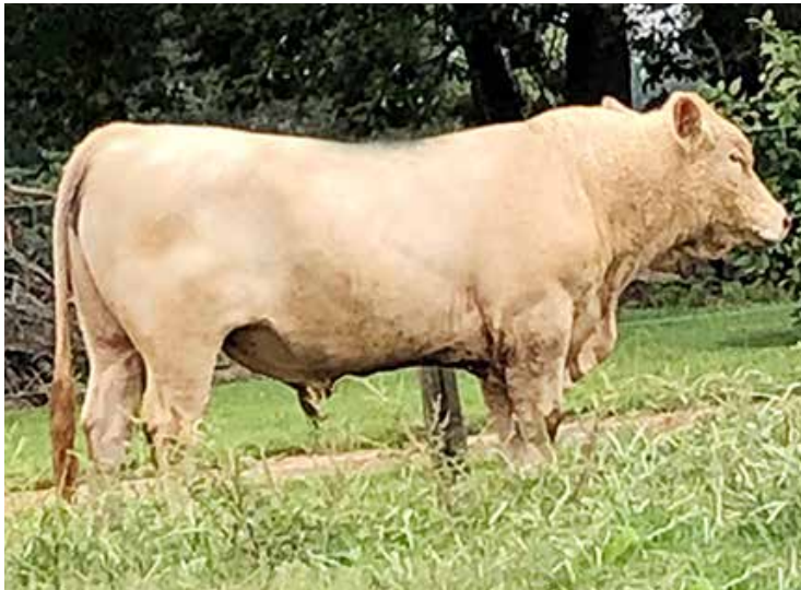
FARAWAY VICTOR 9F SELLS AS LOT 2

Selling Full Interest and Full Possession. Fertility and Trich Tested. This very muscular, solid bull has good scrotal measurements and good frame size. His dam traces to the Crews donor cow, Lady Cigar 812 that topped a May & Son sale. A prolific donor, she has been flushed and has 36 calves registered to her. More and more breeders are discovering how great the reputation for milking and fertility levels of the President daughters!