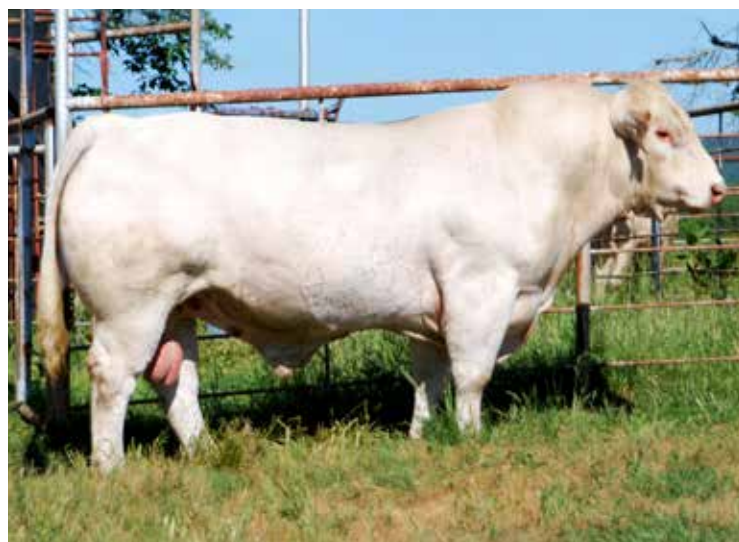
COOLEY ROYCE 1107T39 SIRE OF LOT 66 EMBRYOS

Selling 3-conventional embryos from mating of CJC Mr President T122 x BC Ms Perfect Mark P ET. President has 1031 calves registered with AICA and though they are getting some age, quite a few breeders are returning to use him for both females and bulls. His daughters milk very well and maintain good fleshing qualities. The bulls are loved by commercial breeders for their abundant thickness, bone, and volume. Ms Perfect is out of the P-3 Lady Perfect that sold 3-different time for $25,000.00