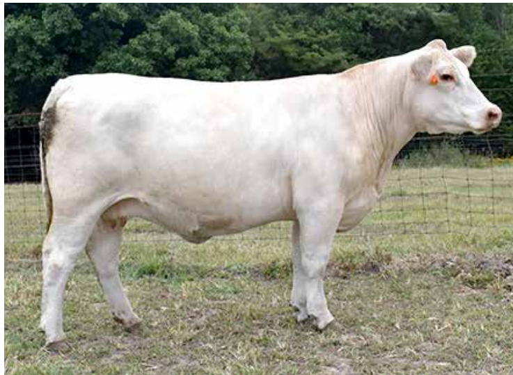
LCC TEXAS BONNIE 1748 SELLS AS LOT 59