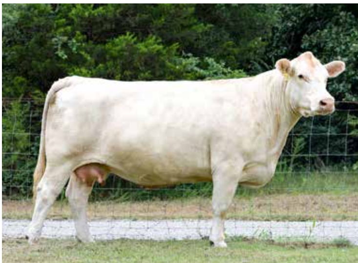
OHF VANESSA G112 P DAM OF LOT 44

DUE to calve February/March 2021 to Bar H Ledger 921. Sire is sired by the former #1 AICA Milk Trait Leader that also sired an AICA Trait Leader, Oakdale Duke 9003. A very strong bottom side with Duke 914 and 9108, both well-known for their power females produced. Ranks in the top 3% for CE, 7 % and an actual birth wt of 65 lbs. Traces back to Swan Creek's Baldrige Sweetheart cow family!