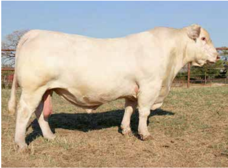
M6 NEW STANDARD 842 P ET SIRE OF LOT 48