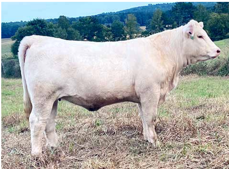
JBC MS EQUITY908 P ET SELLS AS LOT 27