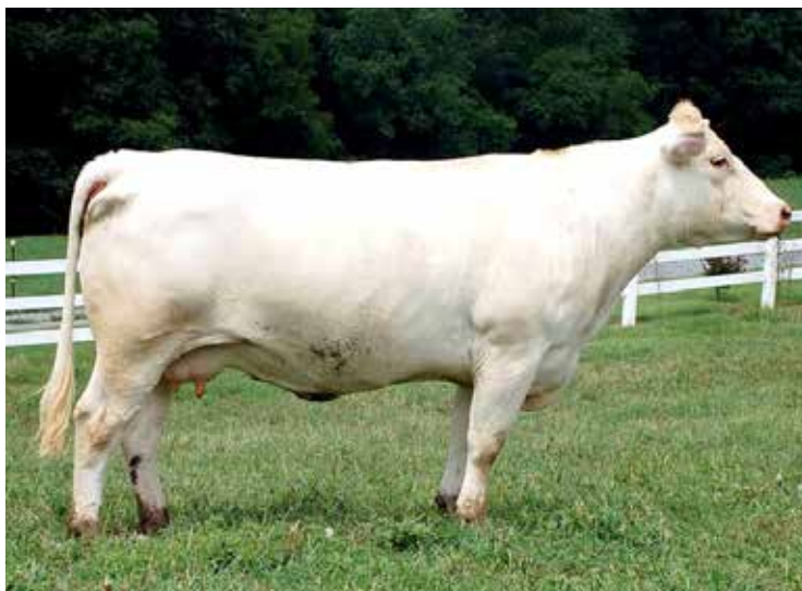
MCF LADY GI DUKE 5003PET DAM OF LOT 12