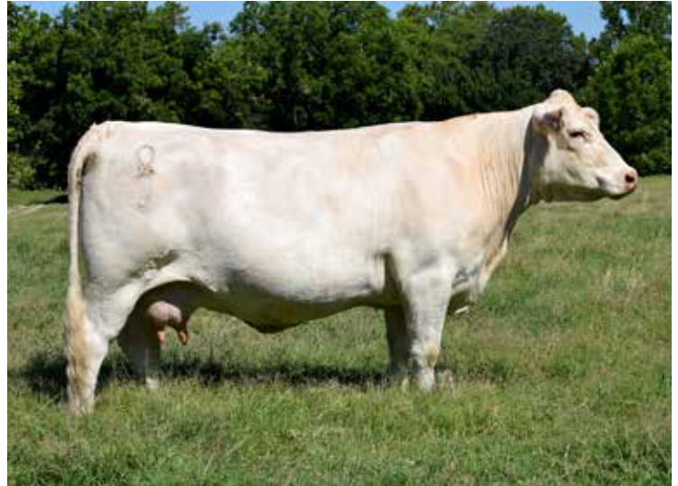
JDJ MS PRESIDENT W3071 MATERNAL GRANDAM OF LOT 23