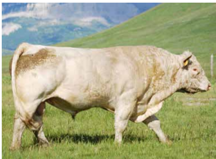
CJC KOBOLD X343 SIRE OF LOT 57