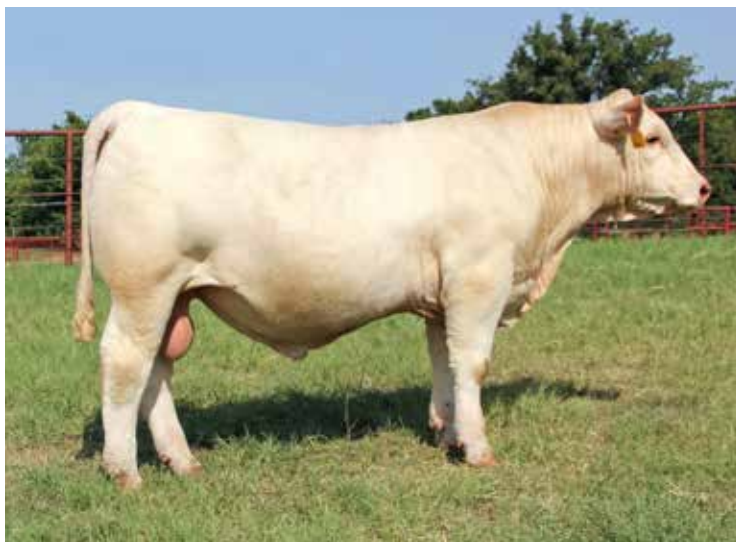
M6 LAW & ORDER 577 P SIRE OF LOT 14