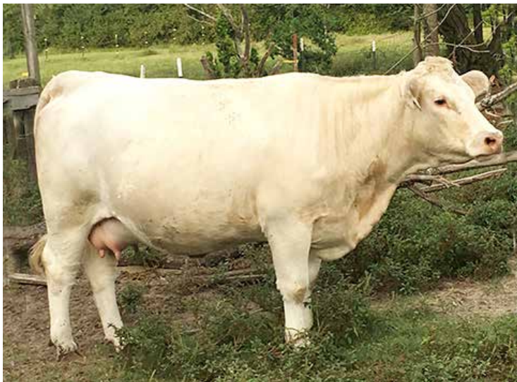
SCF LADY LEDGER 1808B ET SELLS AS LOT 16