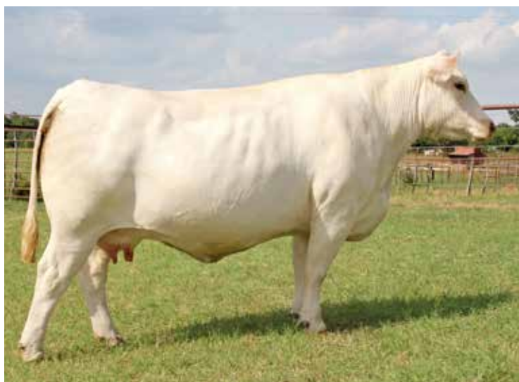
M6 COOL GERMAINE 1145 DONOR DAM OF LOT 10 ET CALF