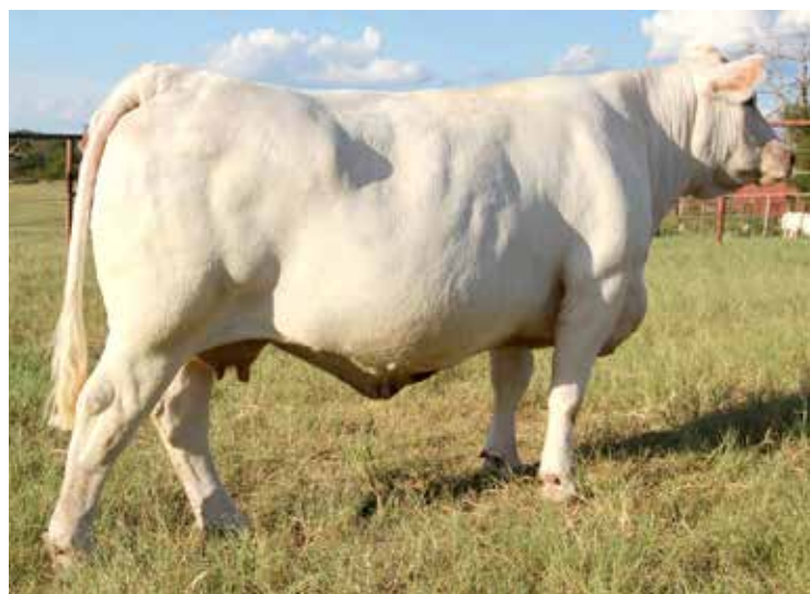
C5 MS 104 DUKE 1265 P ET DONOR DAM OF LOT 67 EMBRYOS

Selling 3-conventional embryos from mating of Cooley Royce 1107T39 x BC Ms Perfect Mark P ET. Royce sires great milking daughters with near perfect udder quality, moderate frame size, and volume. Perfect Mark has produced 32 calves and her dam, 7-1G, has produced 49 calves. 7-1G was the Champion Female at the Canadian Farm Show before selling to the States. The Ali Mark gives her great carcass and milking ability.