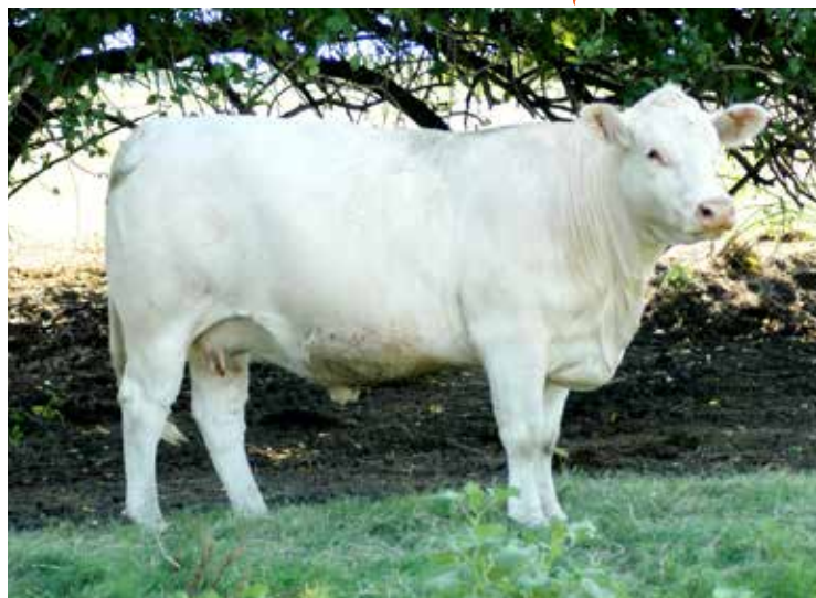
BC MS PERFECT MARK P ET DONOR DAM OF LOT 65 & 66 EMBRYOS