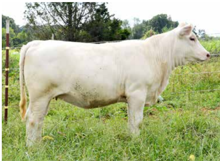
REAVES MS DAWN 952 SELLS AS LOT 11