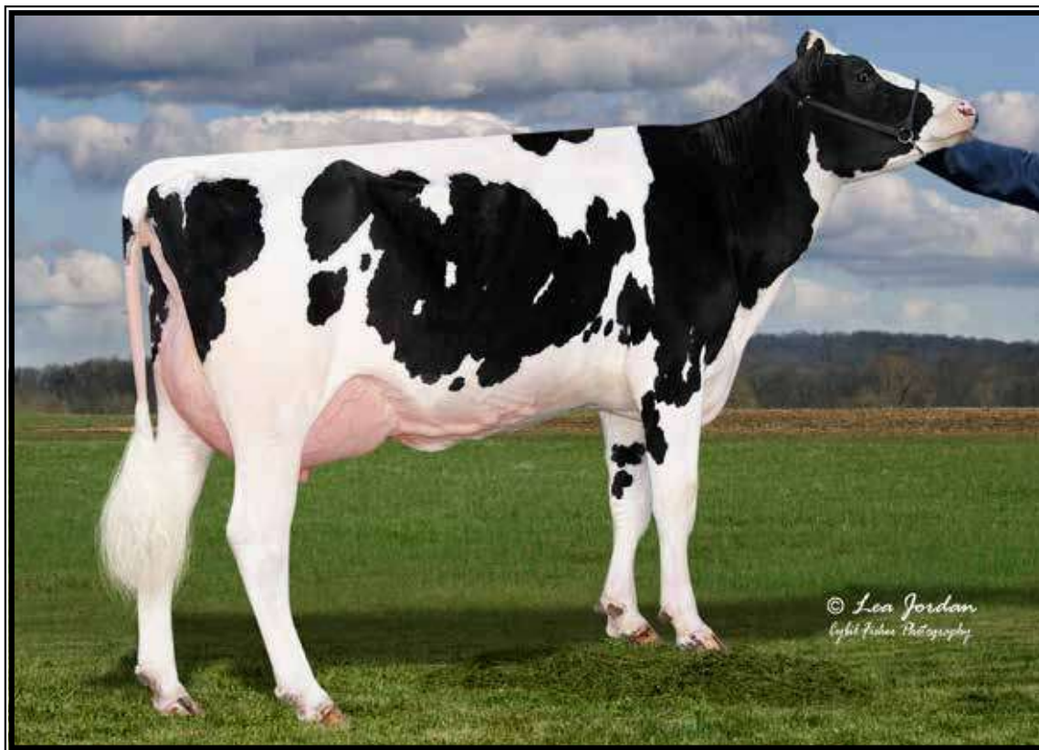
Brandt-View Milky Sicily GP-83, VG-MS (1st score) (Dam of Lot 8 & 9)