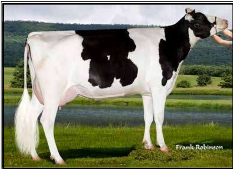
Pen-Col Modesty Jewel-ET VG-85,UG-MS