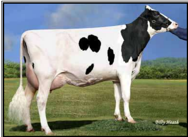
AOT Modesty Hoss-ET GP-84