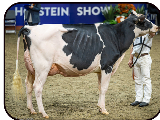
Full sister to Dam of Lot 3 Miss Goldwyn Fantasy VG-89 -1st Fall Sr. 2 RWF 2025 -2nd Fall Sr. 2 WDE 2025 -Due back for the 2026 season!