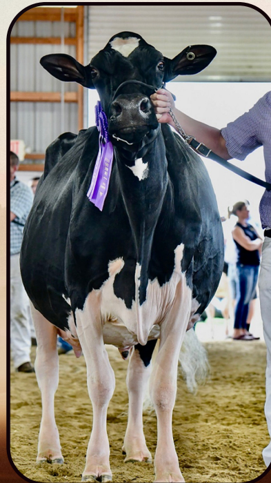
Rach-Len Dundee Lilly EX-97 Dam of Lot 4