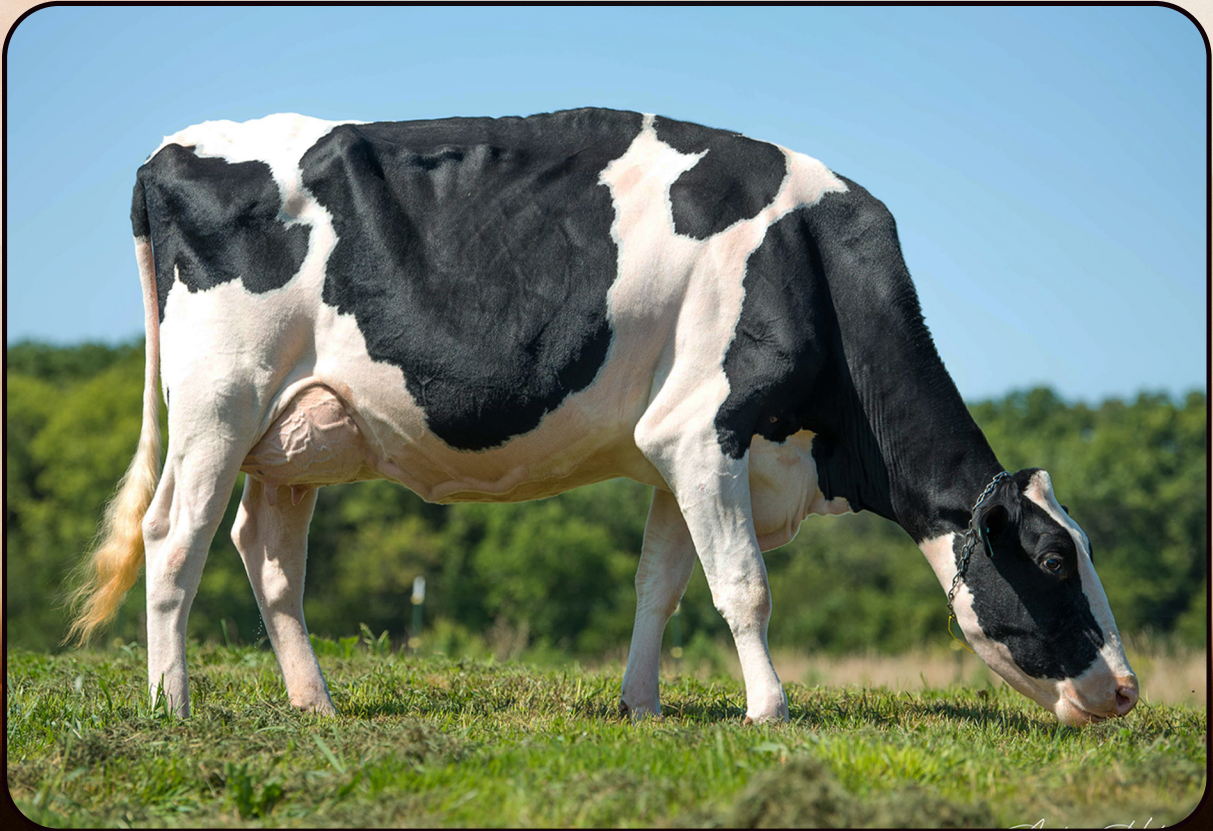
Ms R-John Trendy Artist-ET EX-94 Dam of Lot 10