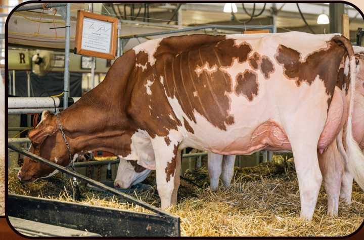
Curr-Vale Baracuda-Red-ET EX-92 Sister to Lot 2