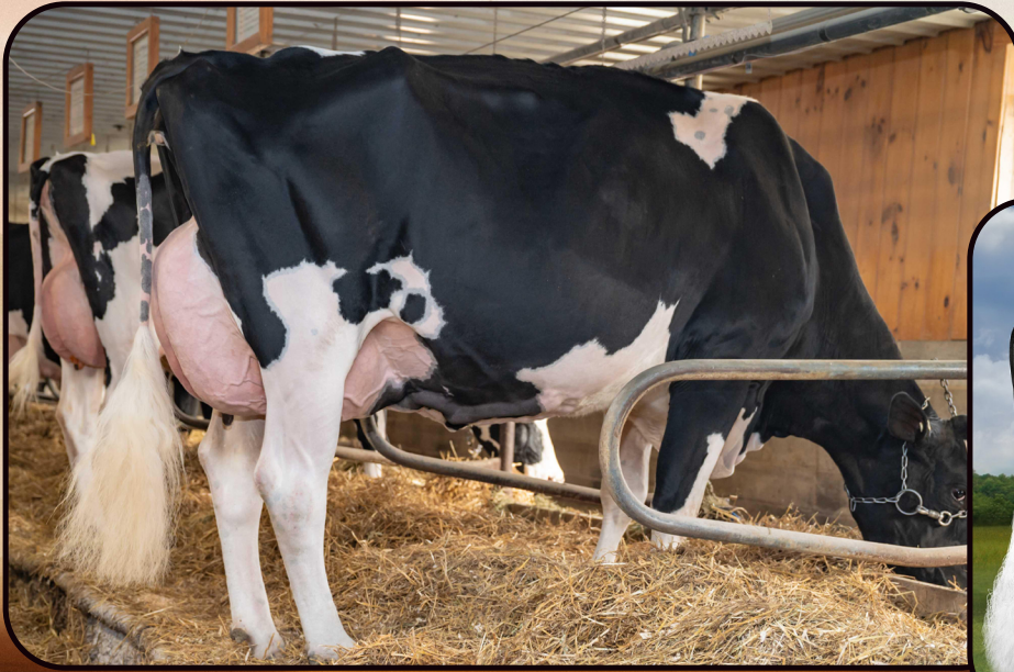
Duckett Impression Belle-ET EX-94 Dam of Lot 11