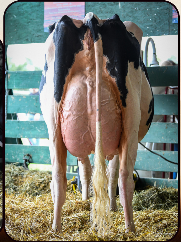
OCD Doorman Mia-ET EX-94 Dam of Lot 24