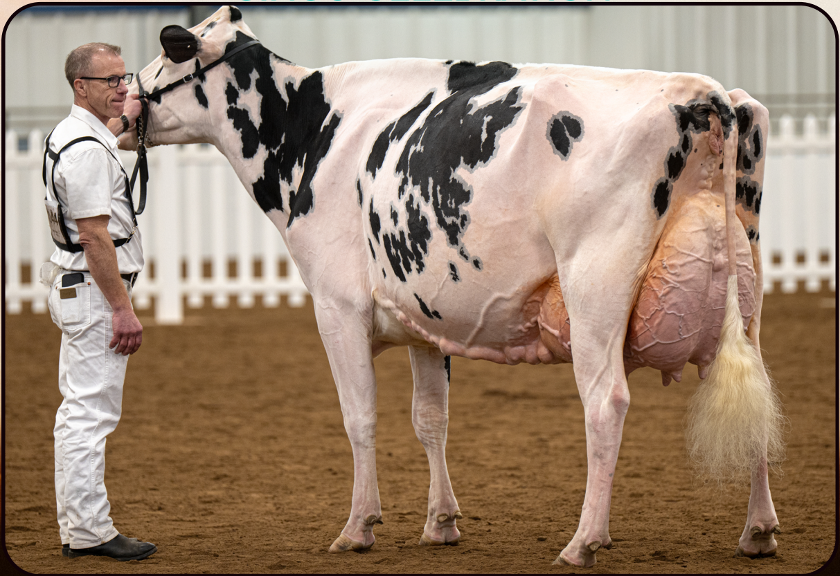
Lo-Pine-VA Lady Crush EX-96 EEEEE Sister to the Dam of Lot 6