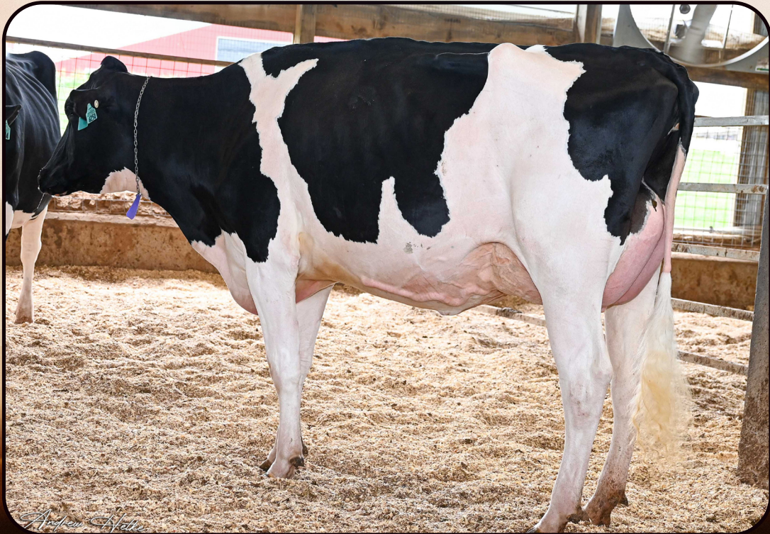
OCD Alleyoop Magic-ET EX-93 Dam of Lot 7