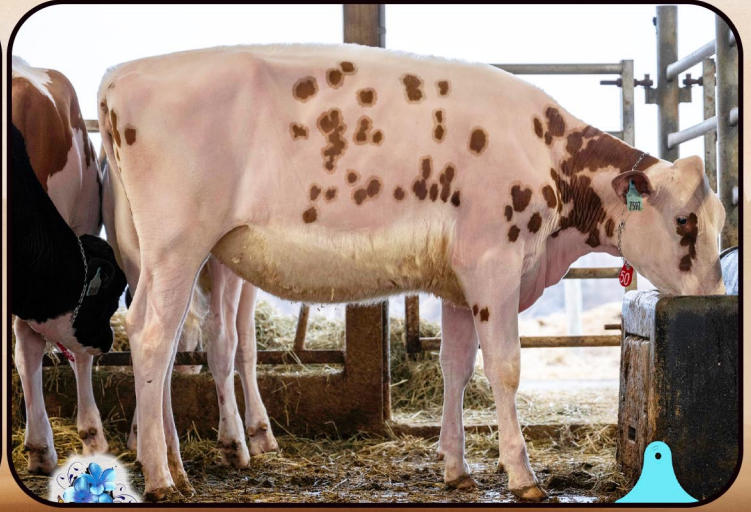
Curr-Vale Unstop Shuteye-ET EX-94 Dam of Lot 16