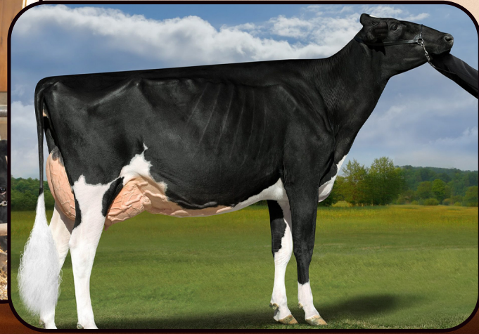
Fraeland Doorman Bonnie EX-94 2nd Dam of Lot 11