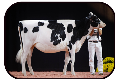
Great granddaughter of Lilly: Genesee Altitude Leah •Supreme Junior Champion WDE 2024 •All-American Spring Yearling 2024 •All-American Spring Heifer Calf 2023

127640114 EX-95 *TR *TV *TL PTA -1033M -55F -31P 99R 12/24 PTA +.75T +.76UDC -.03FLC GTPI +1399 Mtelgin Goldwyn Lillian-ET CAN11360512 Excellent-93 EEEE 5-02 *TL *TD 4-08 3x 365d 32,230 3.6 1156 3.2 1017 3-05 3x 294d 26,740 3.3 885 3.0 790 •1st 5 Yr Old NY Spring Junior Show 2017 •Grand Champion NY Spring Junior Show 2017