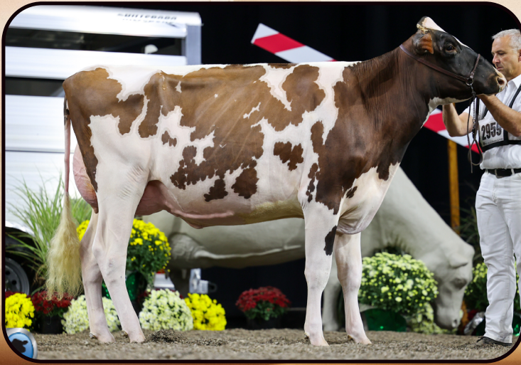
JD-Sheronia Amethyst-Red Sister to the Dam of Lot 25