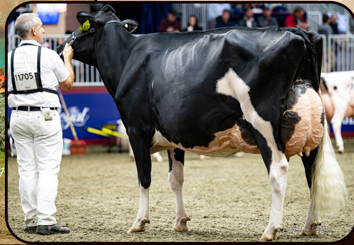
McGarr-Farms Solomon Zara EX-92 2nd Dam of Lot 18