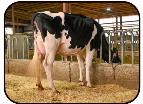
LO-PINE-VA ADDISON LUCINDA VG-87 Dam of Lot 6

72930534 Excellent-91 EEEVE 8-08 5-03 2x 305d 16,570 3.9 643 3.0 496 2-09 2x 305d 14,870 4.1 603 3.3 495 4-01 2x 305d 14,150 3.9 548 3.1 441