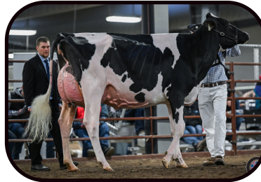
Sister to Embryos: Milksource Audi EX-93 -Reserve All-American Jr. 2