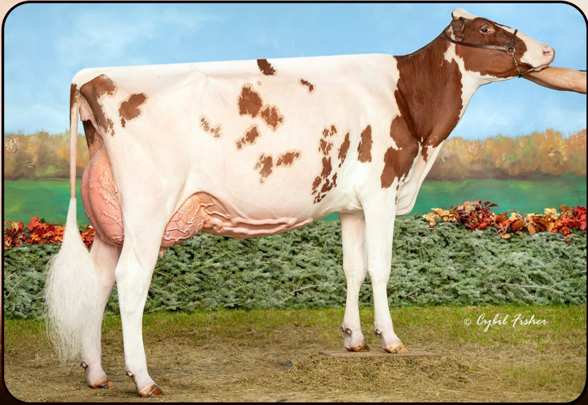
MILKSOURCE ATTICA-RED Dam of Lot 29