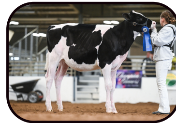
Sister to Lot 4 Blacklilly Direct Lala-ET •1st Winter Calf NY Spring Show '26

840003297697650 • 12/26/2024 Winter Yearling H.N. 167 Due Jan 1st 2027 to Sexed Image