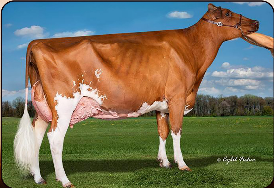
Maiz-N-Blu Add Lucy-Red EX-92 Dam of Lot 20