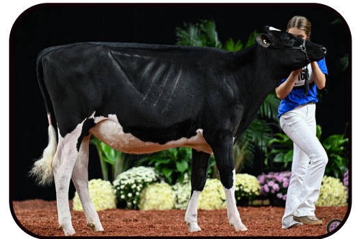
Sister to the Dam: Petieclerc Unix Suishi -2nd Winter Calf WDE Jr. show 2023 -6th Winter Calf WDE -Reserve Jr. All-American -Nominated open All-American

CAN 106756991 99%RHA-NA CAN 4Y VG 85 09/27/2010 2-04 2 305 16484 4.3 705 3.4 560 352 18545 4.3 802 3.5 644 CAN 5-01 2 305 29162 5.6 1634 3.5 1008 355 33569 5.5 1856 3.4 1153