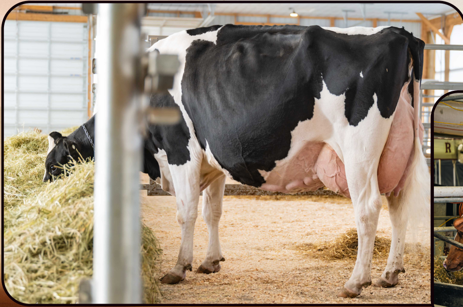
Jericho-Dairy Baracuda-ET EX-96 Dam of Lot 2