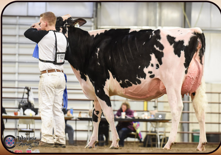
Petitclerc Doorman Sapphire EX-94 Sister to the Dam of Lot 21