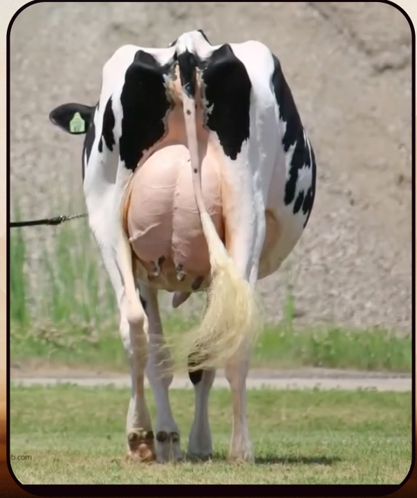
ROSEDALE MB LUCKY LADY EC-93 2nd Dam of Lot 32