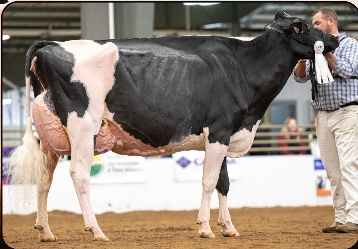
Benbie Bridgestone Coco EX-94 Dam of Lot 14