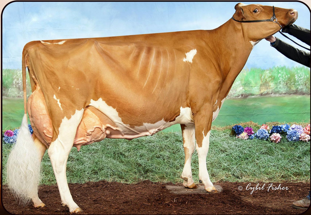
Rosedale Lucky-Rose-Red EX-94 3rd Dam of Lot 23