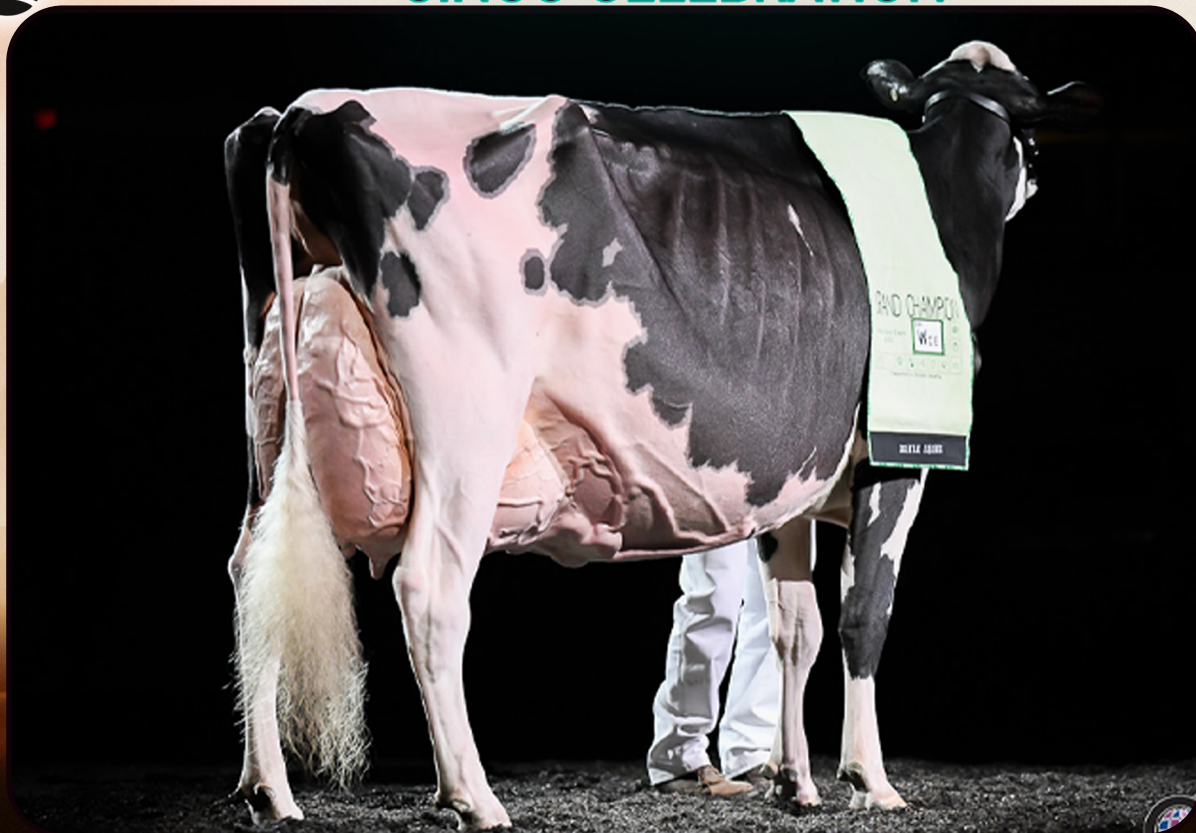
Oakfield Solom Footloose-ET EX-97 Dam of Lot 3