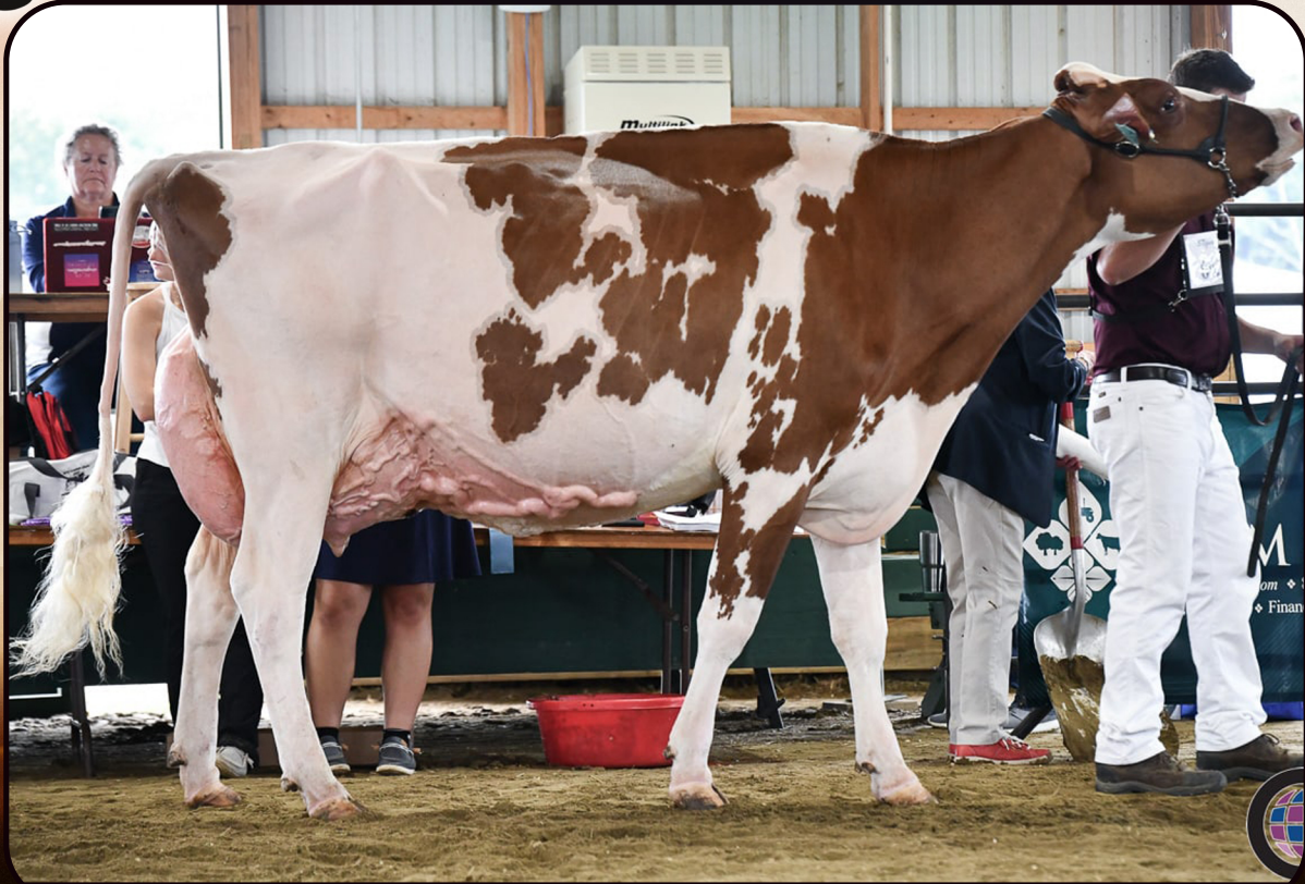
OAKFIELD US CHEERFUL-RED EX-93 Dam of Lot 12