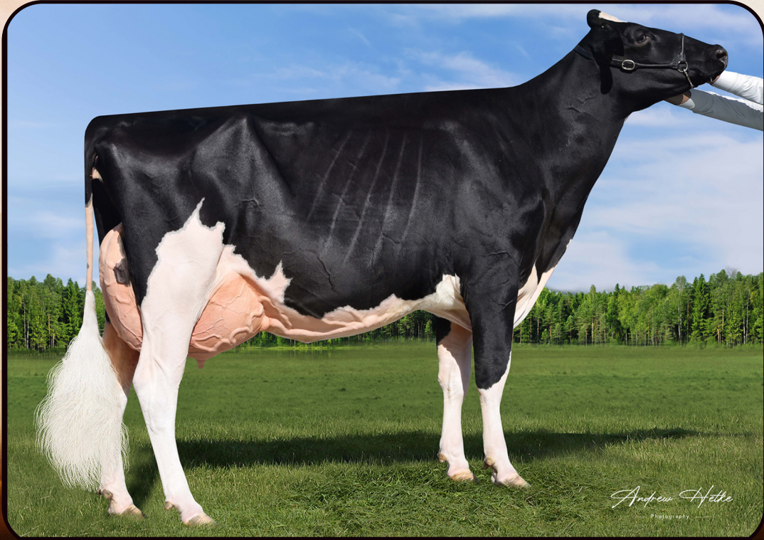
Dinas D Delora EX-94 Dam of Lot 27