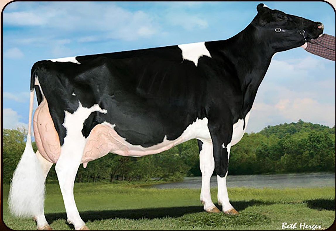
Vangoh Durham Treasure EX-96 2nd Dam of Embryos