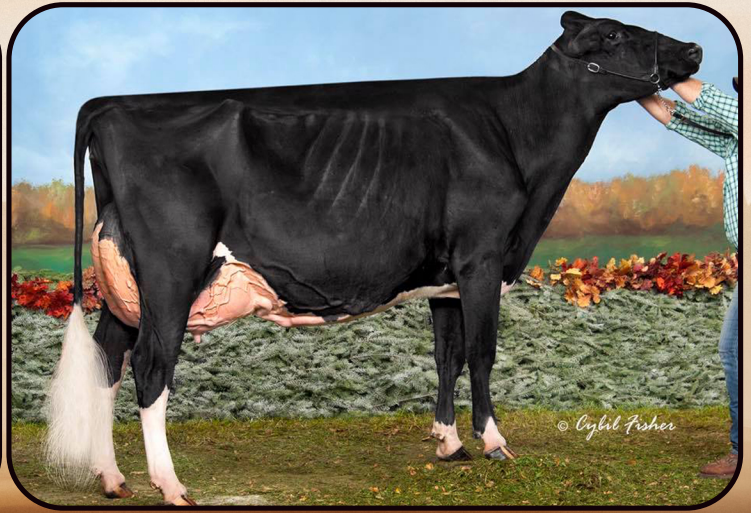
Petitclerc Gold Saltalamachia VG-89 Sister to the 2nd Dam of Lot 21