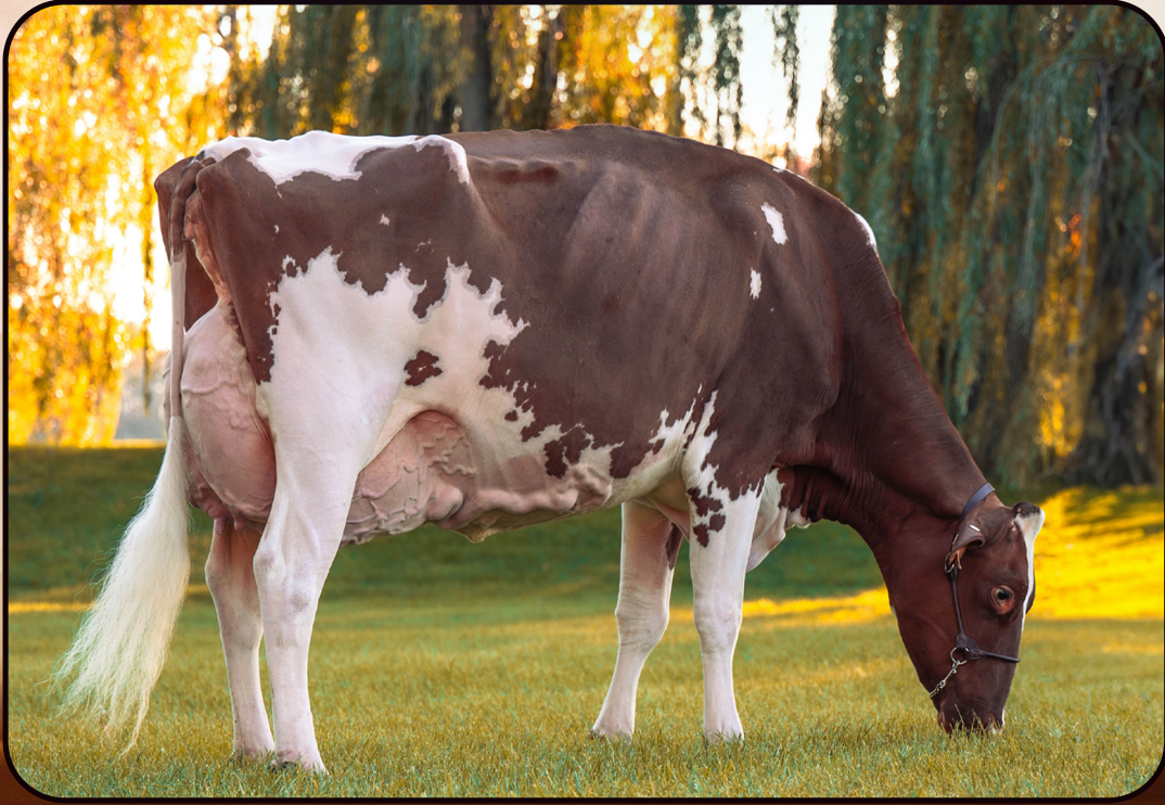
Milksource Renaissance-Red EX-95 Dam of Lot 28