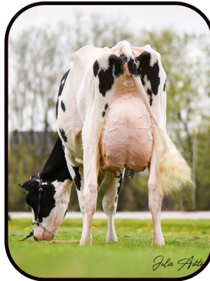
3rd Dam of Lot 7 OCD Delta Missy 4212-ET EX-94 (MS:97) 2E

840003300022793 • 12/15/2025 Winter Calf H.N. 8462