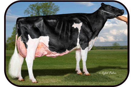
2nd Dam of Embryos: Ms Atwood Lacey-ET *RC EX-95 2E All-National Aged Cow 2022

Ms Atwood Lacey-ET *RC EX-95 6-07 2x 305d 36,780 4.3 1598 3.1 1139" Life: 1537d 146,610 4.1 6023 3.1 4513 •All-National Aged Cow 2022 •HM All-American Lifetime Production Cow 2022 •Grand Champion Midwest Spring National 2022 •Res. Sr. Ch. Northeast Spring National 2022 •4th 150,000 lb. Cow International Show 2022 •Res. Sr. Champion Midwest Spring National 2021 •1st Aged Cow Midwest Spring National 2021