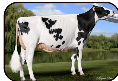
Maternal Sister to Lot 1: Luck-E Doc Akooza 6th Jr. 2 World Dairy Expo 2025 1st Jr. 2 IL State Championship show

Golden-Oaks Alpha-Red-ET •HM Junior Champion Iowa State Holstein show