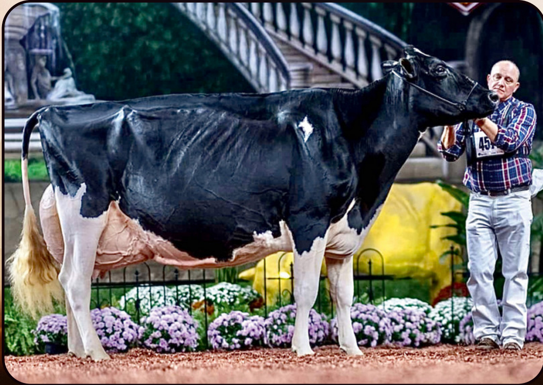
Rach-Len Dundee Lilly EX-97 2nd Dam of Lot 5