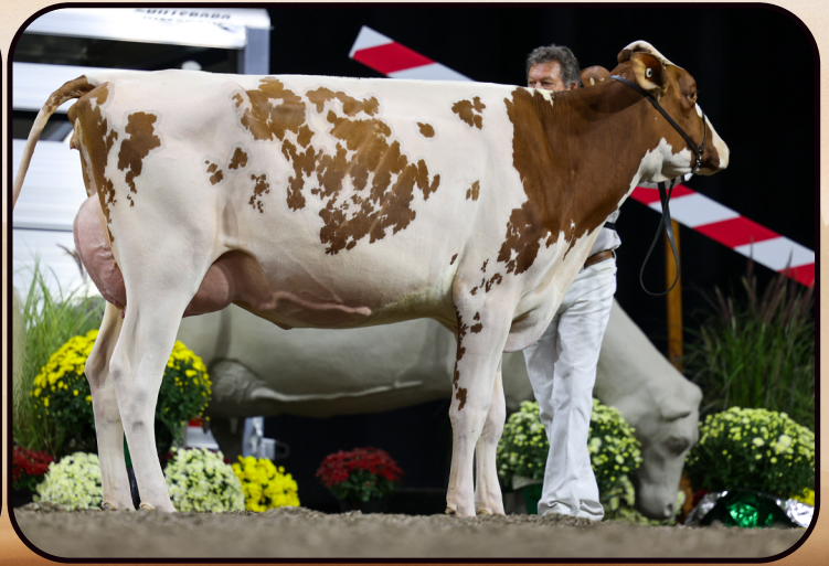
JD-SHERONIA AFECTION-RED-ET Dam of Lot 25