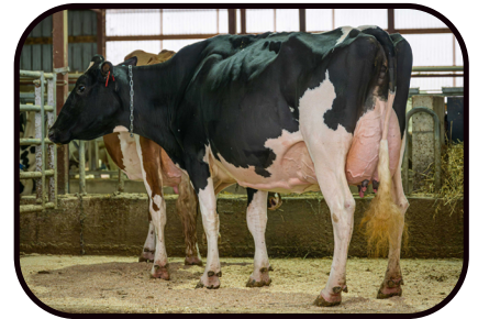
Dam of Embryos: MD-Locustcrest Doplr Zurini EX-93