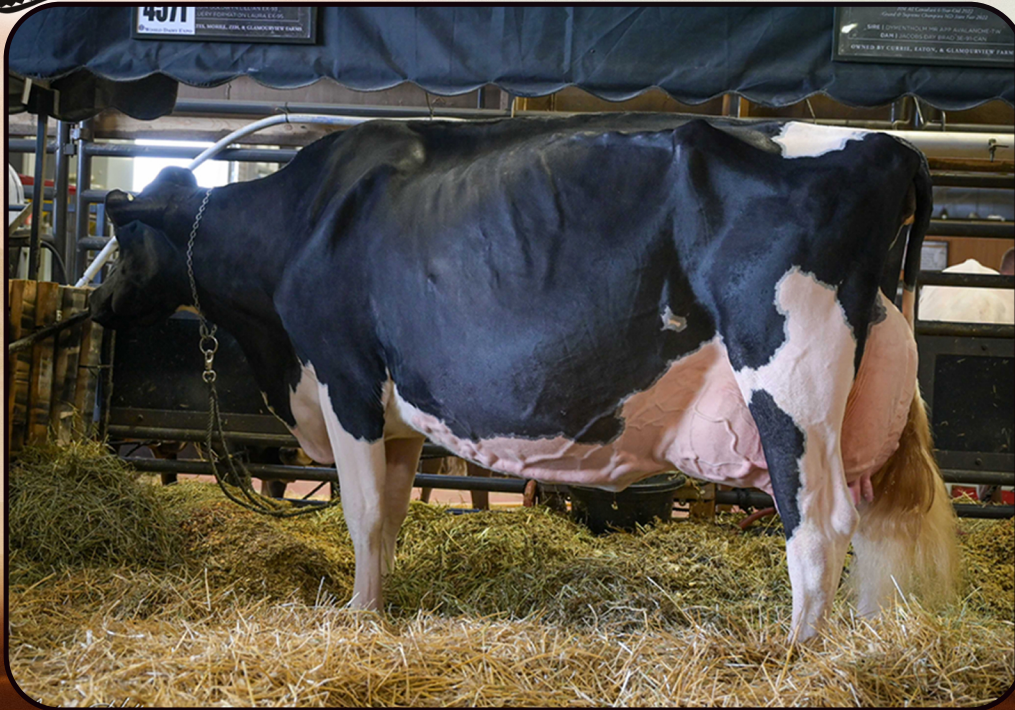
Rach-Len Dundee Lilly EX-97 Dam of Lot 4