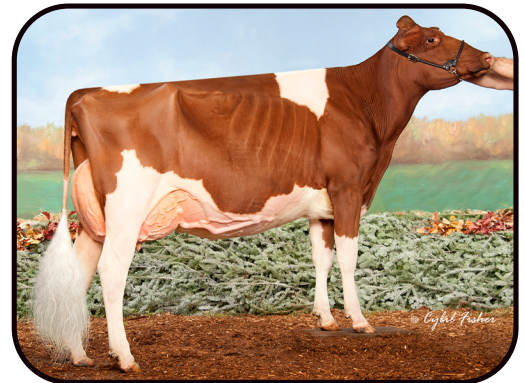
2nd Dam of Lot 12 Oakfield ABS Candy-Red EX-94 •Nom. All-American R&W 4 Year Old 2019 •HM Sr. Champion All-American R&W Show 2019

3288590327 • 12/02/2025 Winter Calf H.N. 2033