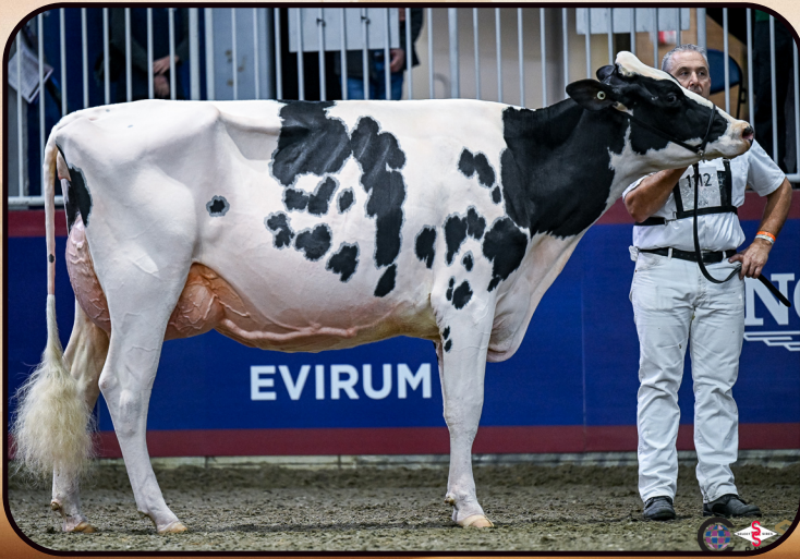
Desperle Kim Lambda VG-89 Same family as Lot 22