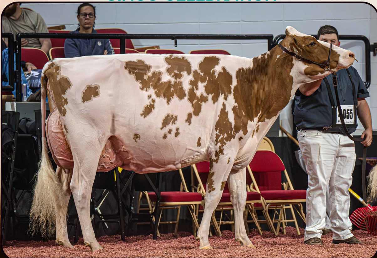
Luck-E Devour Akooza-Red-ET EX-92 Dam of Lot 1