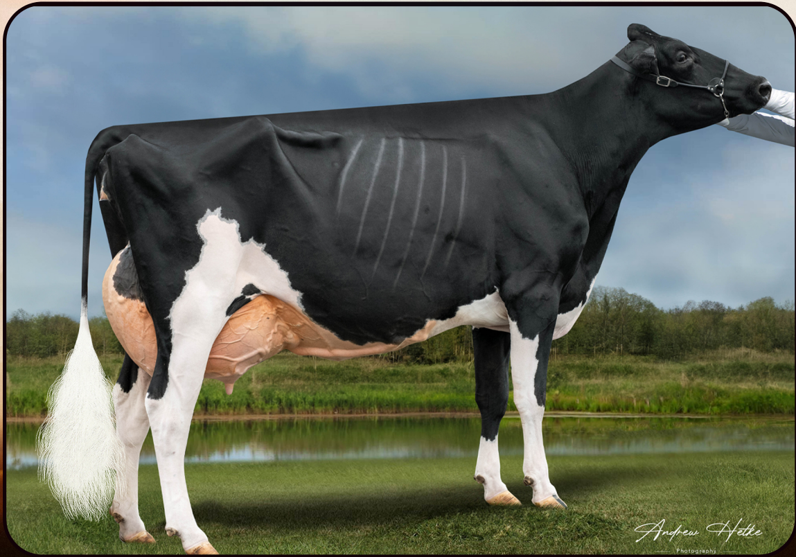
Oakfield Doorman Karmen-ET Dam of Lot 15