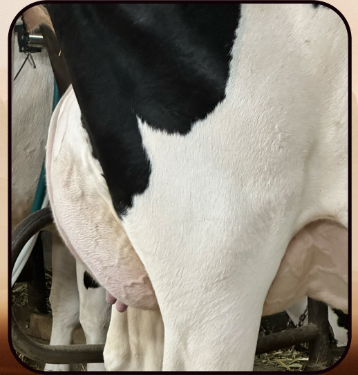
BRIGEEN DL JANGLE-ET VG-85 Dam of Lot 9