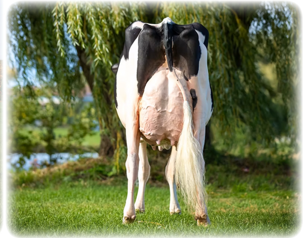
Ladyrose Caught Your Eye EX-95 Maternal sister to the dam of Lot 33