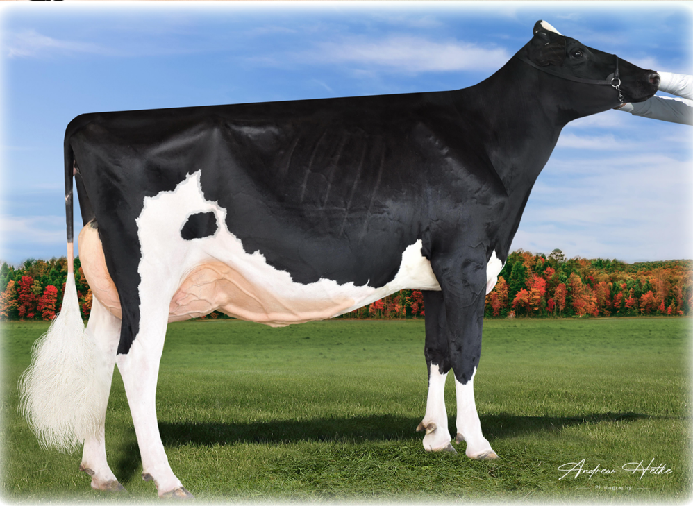
Ladyrose Vibrance EX-93 Dam of Lot 33