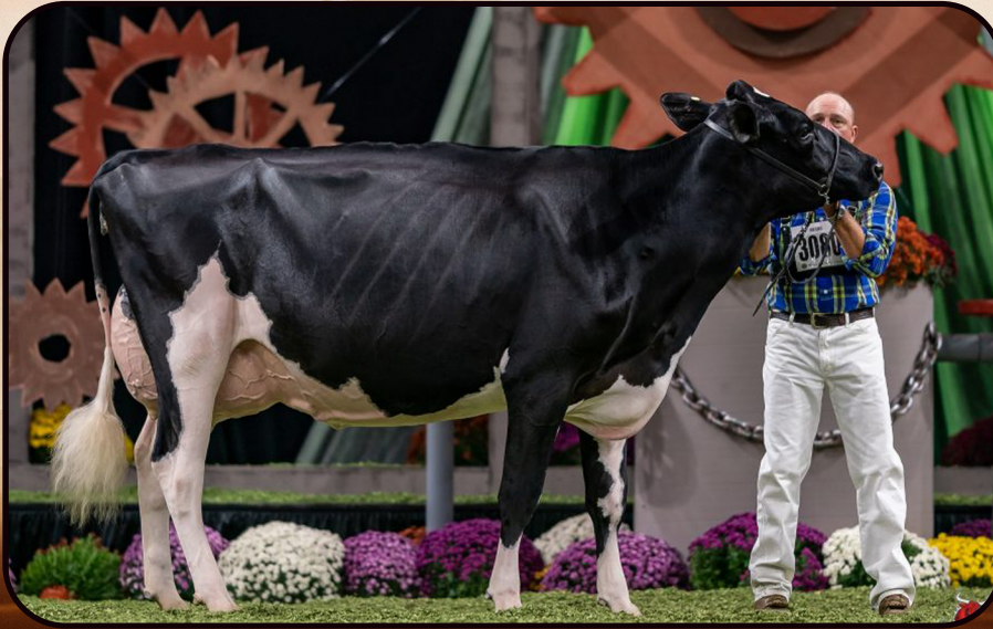
Midas-Touch Jedi Jangle-ET EX-92 3rd Dam of Lot 9