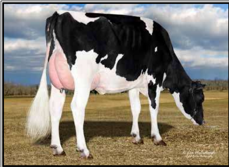
Ms Lookout Psc Fb Evette-ET VG-85 DOM

2-11 365 26330 4.2 1106 3.1 828 Lifetime 110460 4.1 4559 3.1 3395