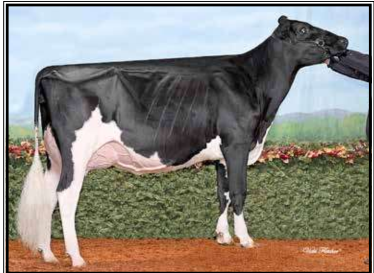
Midas-Touch Jedi Jangle-ET EX-92, 93-MS

1-10 365 28560 4.5 1292 3.2 928 (4th Dam of Lot 1 above)