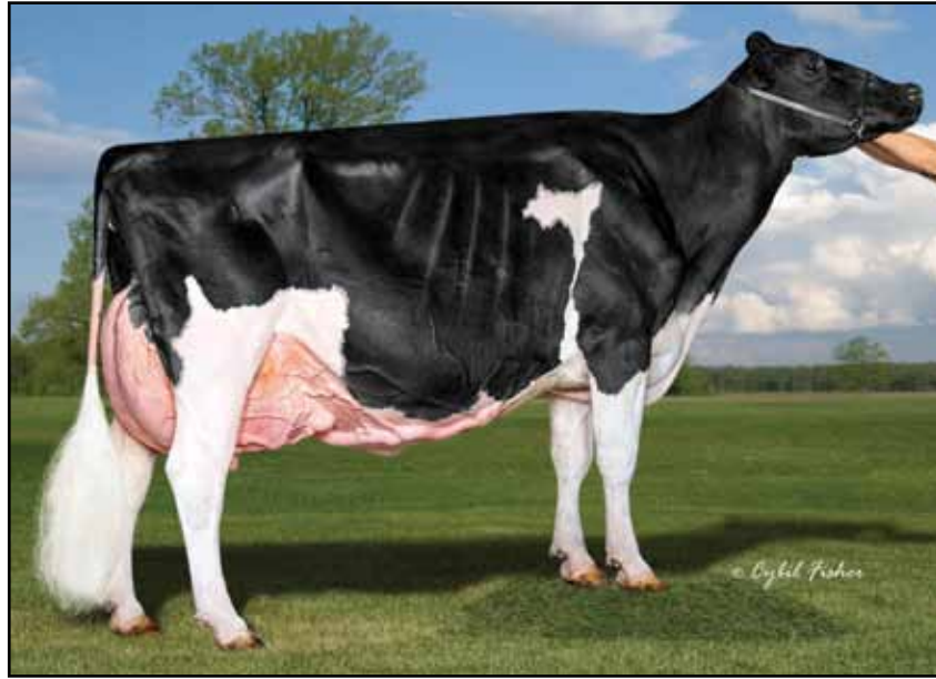
MS ATWOOD LACEY-ET 2E-95 Granddam of Lot 90