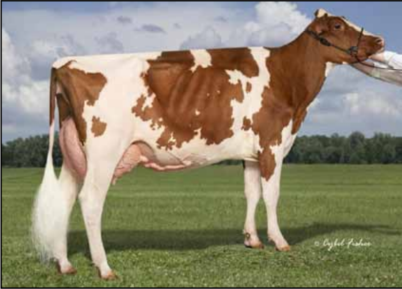
SIEMERS TEQUILA 5270-RED-ET Selling: Lot 88