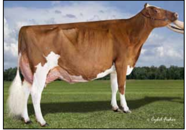
STRANS-JEN-D TEQUILA-RED-ET 2E-96 Dam of Lot 88