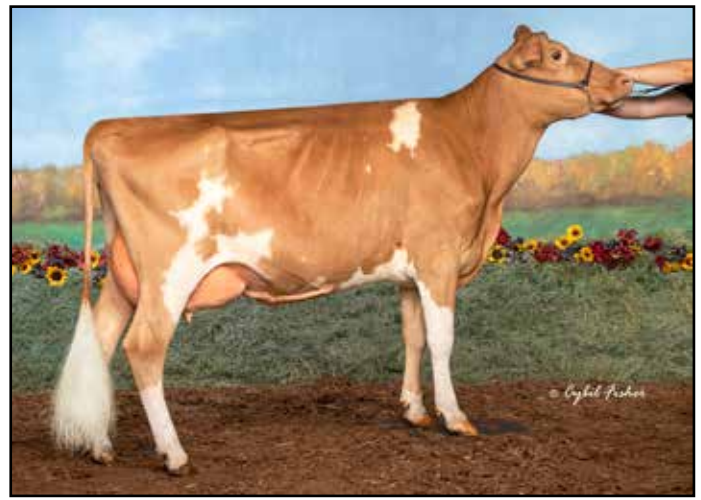
Golden I James Dean Lyra VG-85 1st Summer Jr. Two-Year-Old GG Showcase 2025 Maternal Sister to Lot 3