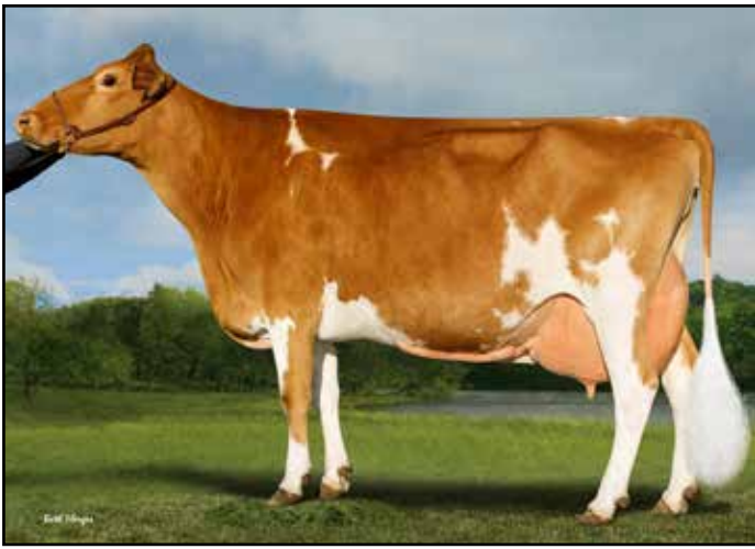
Golden I Jonathan Leia EX-90 GSD 116,260M 5.4% 6,269F 3.7% 4,352P Life Dam of Lot 3