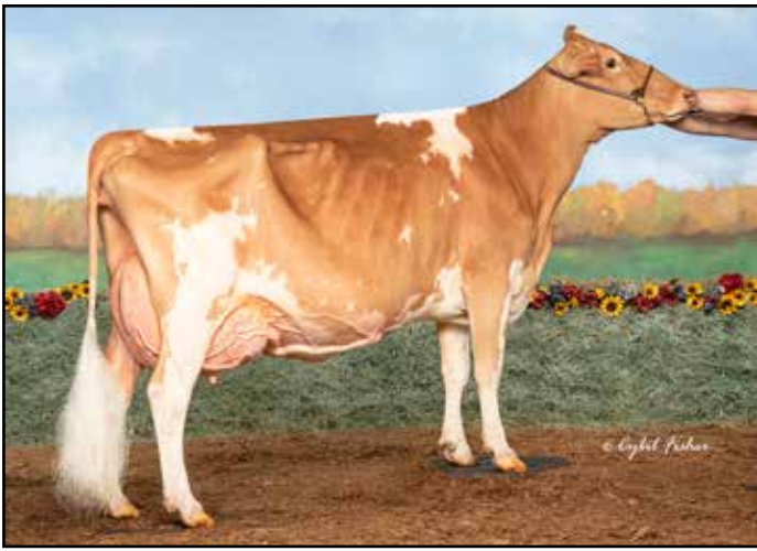
Femara Myrtle EX-92

3-04 305D 2X 19,980M 6.0% 1,190F 3.3% 665P HM Junior All-American Sr. Two-Year-old 2023 Dam of Lot 4