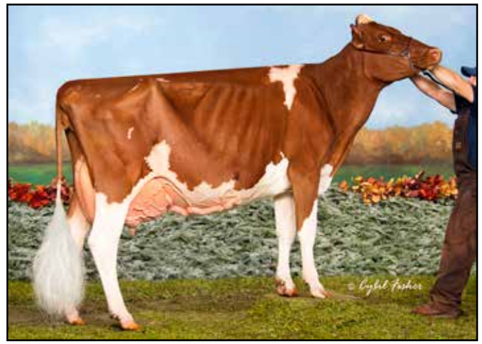
Misty Meadows Levi Sienna-ET VG-88 3-10 365D 2X 21,810M 4.5% 973F 3.5% 758P Reserve All-American Jr. Three-Year-Old 2015 Granddam of Lot 2