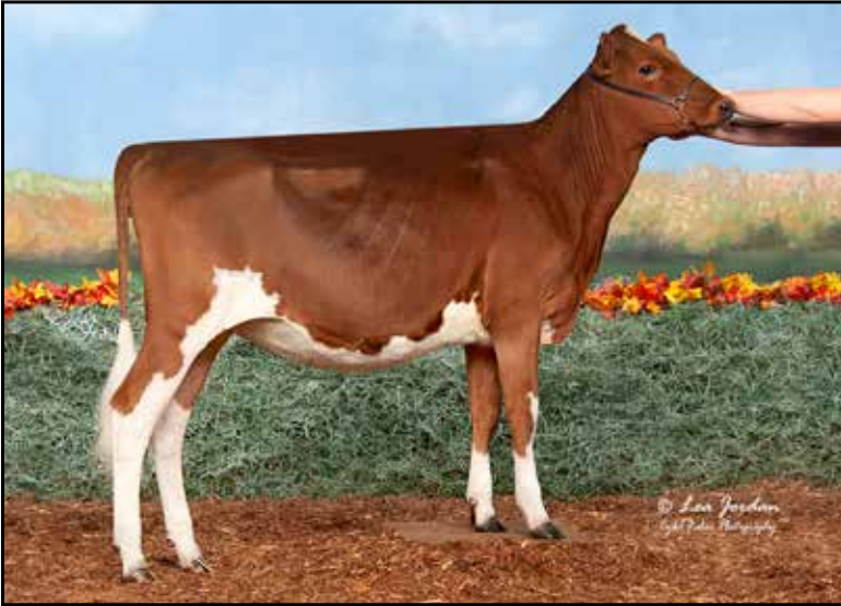
PR-Walnut Ridge Andy Dottie Honorable Mention Junior All-American Spring Calf 2025 Paternal Sister to Lot 12