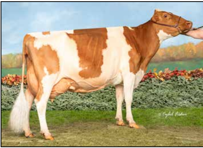
Misty Meadows HP GG Sunset-ETV EX-94-2E 100,420M 4.3% 4,366F 3.5% 3,507P Life Reserve All-American Five-Year-Old 2023 Dam of Lot 2