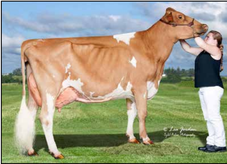
GR-Welcome Gage Faye VG-88 1st Sr. Three-Year-Old GG Showcase 2021 Granddam of Lot x