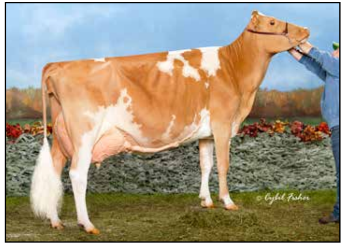
Sniders Yogi Anise-ET EX-94

3-04 305D 2X 19,980M 6.0% 1,190F 3.3% 665P HM Junior All-American Sr. Two-Year-old 2023 Dam of Lot 4