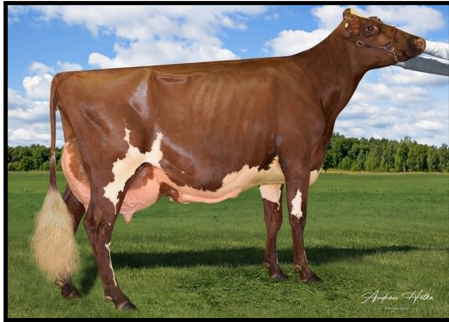
Krauses Twain Mayberry 500 EXP E91 Paternal Granddam of Lot 50