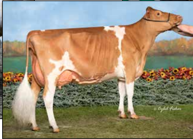
Kadence Fames Lovely EX-96 Grand Champion World Dairy Expo 2025 Dam of Lot 16