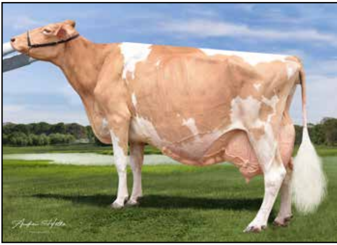
Knapps Hillpoint Pie Teacup-ET EX-94 365,450M 4.8% 17,659F 3.3% 12,157P Life HM All-American Jr. Two-Year-Old 2011 Granddam of Lot 10