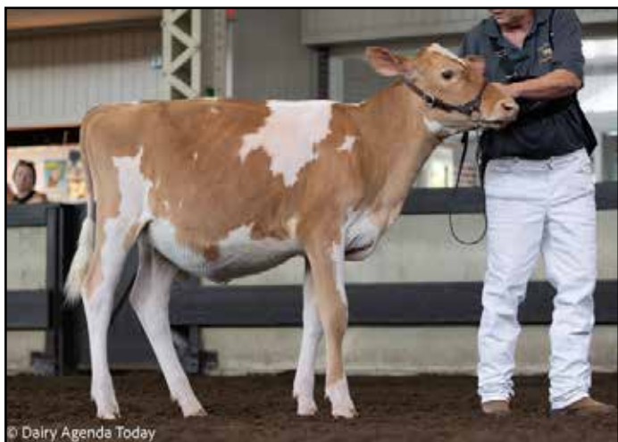
Knapps Missile Top Spot-ETV 1st Spring Calf Iowa State Fair 2025 Full Sister to Lot 9

Appraisal: EX 91 @ 4-04 (EEEE) 3-04 347D 2X 15080M 4.6% 700F 3.2% 489P 91 Dtrs: KNAPPS DRONE THUNDERSTRUCK 83 @ 1-09 (82/86) KNAPPS MISSILE TOP SPOT-ETV 1st Spring Calf Iowa State Fair 2025