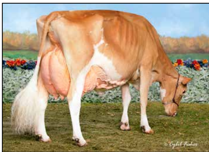
Knapps Regis Tambourine-ET EX-95 6-10 365D 2X 40,160M* 5.1% 2,055F* 3.3% 1,338P* Unanimous All-American Aged Cow 2015 Granddam of Lot 9