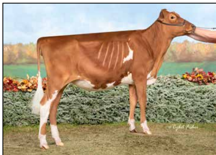
Knapps RC Torpedo Bonus-ETV All-American Winter Calf 2024 Maternal Sister to Dam of Lot 2

Appraisal: 93 @ 5-04 (93/93) Gold Star Dam - 2002 4-06 365D 2X 26870M 5.9% 1585F*3.3% 896P DHIA 1679D 116150M 6.0% 6954F 3.5% 4025P LIFE Reserve All-American Sr. Three-Year-Old 2001 Honorable Mention All-American Four-Year-Old 2002 Total Performance Cow NGS-Madison 2002