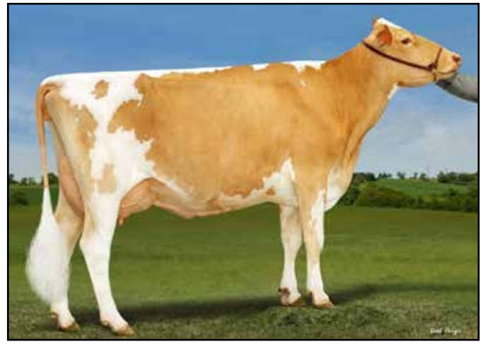
Knapps Goliath Torque-ETV VG-89 @ 2-06 Dam of Lot 10

Consignor: KNAPP AUSTIN & LANDEN EPWORTH IA 563-590-5754