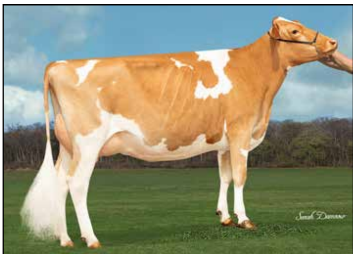
Knapps AP Talented-ETV EX-91 Dam of Lot 9