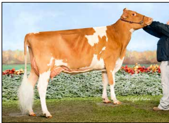
Knapps Copper Bank On It EX-90 4-08 365D 2X 28,160M 5.2% 1,474F 3.7% 1,030P Nominated All-American Jr. Two-Year-Old 2019 Maternal Sister to Lot 1

1-11 365D 2X 19560M 5.3% 1040F 3.6% 700P DHIA 3-07 365D 2X 27770M 5.4% 1493F 3.4% 958P DHIA 5-05 305D 2X 28590M 5.3% 1525F 3.4% 964P 96 6-06 250D 2X 16960M 6.5% 1110F 4.0% 675P 94 1811D 111140M 5.6% 6190F 3.7% 4058P LIFE Reserve All-American Aged Cow 2021 Reserve All-American Four-Year-Old 2019 Reserve All-American Jr. Two-Year-Old 2017 HM Junior All-American Spring Yearling 2016 Nominated All-American Spring Yearling 2016 Member, All-American Best Three Females & Exhibitor's Herd 2017 Dtrs: KNAPPS COPPER BANK ON IT 90 @ 5-04 (91/86) 4-08 365D 2X 28160M 5.2% 1474F 3.7% 1030P DHIA Nominated All-American Jr. Two-Year-Old 2019 KNAPPS TG ROBBING THE BANK 85 @ 3-08 (84/84) 2-07 365D 2X 24620M 4.6% 1127F 3.4% 834P DHIA Nominated All-American Winter Calf 2019 KNAPPS ACC DRONE BLAST-ET 90 @ 3-08 (88/90) 3-00 305D 2X 19030M 4.7% 903F 3.4% 645P 98 Reserve All-American Jr. Two-Year-Old 2023 KNAPPS GOLIATH BANNER-ETV 86 @ 2-04 (86/82) KNAPPS CS BREAK THE BANK-ETV 85 @ 3-00 (86/77) 2-00 305D 2X 17500M 3.9% 682F 2.9% 512P 97 KNAPPS RC TORPEDO BALLA-ETV Honorable Mention All-American Winter Calf 2024 KNAPPS RC TORPEDO BONUS-ETV All-American & Junior All-American Winter Calf 2024