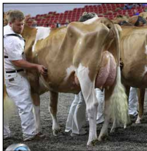
Knapps Missile Blaster-ETV 2nd Milking Yearling WDE 2025 Dam of Lot 2 Maternal Sister to Lot 1

08/25 USDA GPTA -403M +0.14% +5F +0.06% -3P -0.9DPR -0.8PL -106NM$ 16NM%ile -97CM$ 55% Rel 3.20SCS-2.00HCR 28% Rel -1.10CCR 31% Rel 0.30LIV 30% Rel -0.40GL 31% Rel 1.10EFC 29% Rel 0 App 08/25 PTAT +1.0 +1.6UDR +0.5FLC 56%Rel CPI +20 2nd Milking Yearling World Dairy Expo 2025!