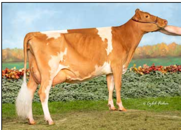
Knapps Acc Drone Blast-ET EX-90 3-00 305D 2X 19,030M 4.7% 903F 3.4% 645P Reserve All-American Jr. Two-Year-Old 2023 Maternal Sister to Dam of Lot 2