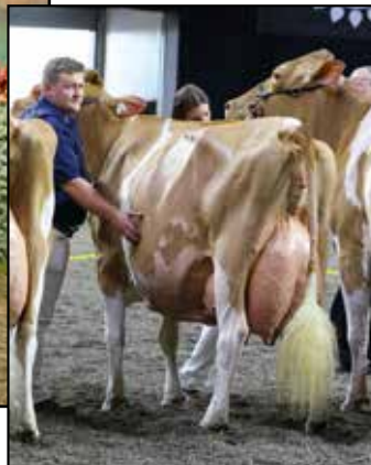
Maplehurst Pilot Treat EX-95 CAN

Reserve All-American Lifetime Production Cow 2024 HM All-American Aged Cow 2022 HM All-American Lifetime Production Cow 2023 Grand Champion Canadian Nat'l Show '22, '23, '24, '25 2nd Lifetime Production Cow World Dairy Expo 2025 Highest-scored Guernsey in Canadian history!