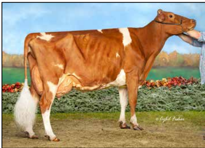
Knapps Spider Bank On Me-ET EX-94 111,140M 5.6% 6,190F 3.7% 4,058P Lifetime Three-Time Reserve All-American Dam of Lot 1; Granddam of Lot 2