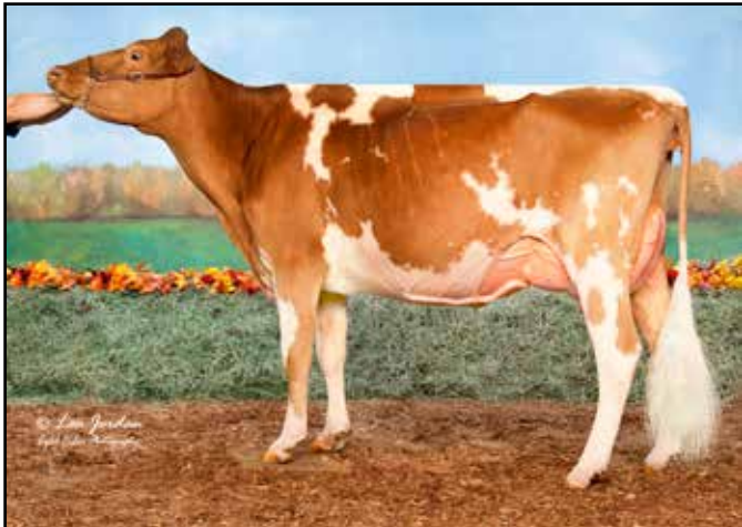
Knapps Paokie Tressa-ETV EX-93 Nom. All-American Sr. Two-Year-Old 2019 Maternal Sister to Dam of Lot 10

Appraisal: 93 @ 5-04 (92/92) 3-10 365D 2X 28480M 4.2% 1198F 3.2% 907P DHIA 2395D 151070M 4.0% 6087F 3.2% 4888P LIFE