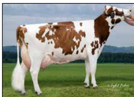
MS TWO-TOP JT KAPPLE-RED-ET VG-88