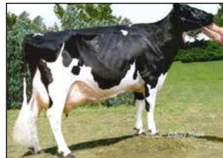
TWO-TOP KITE KRISTAL-ET EX-93