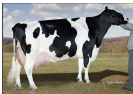
TWO-TOP DURHAM FINALLY EX-92