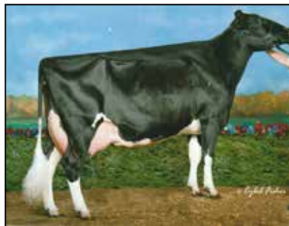
TWO-TOP FREELANCE VOLLEY EX-94