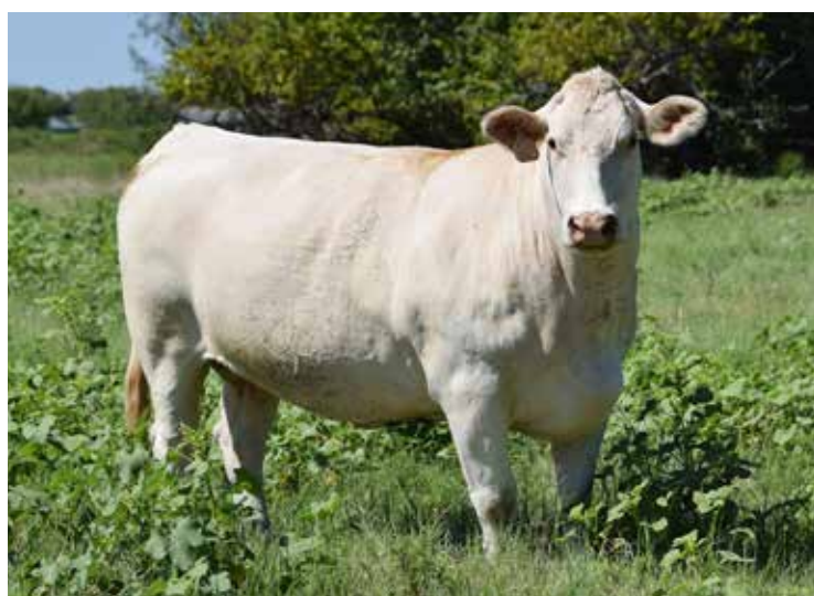
BC MS E46 DUKE Z21 PET DONOR DAM OF LOT 34 EMBRYOS