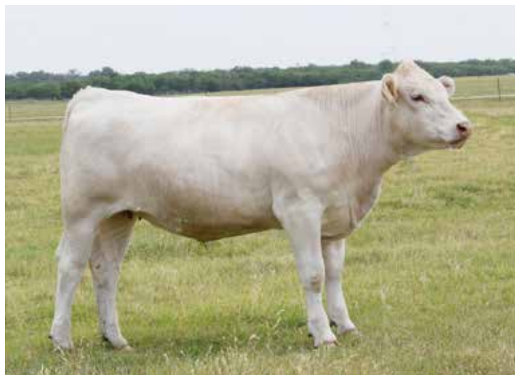
BARA MS W3071 MAX PRES 65 F P SELLS AS LOT 14