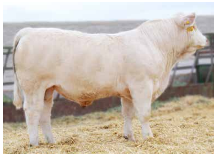
JDJ EQUITY Z370 P HIGH SELLING BULL 2013 DEBRUYCKER SALE AND Sired HIGH SELLING BULL IN 2015 BHD ASSET B178