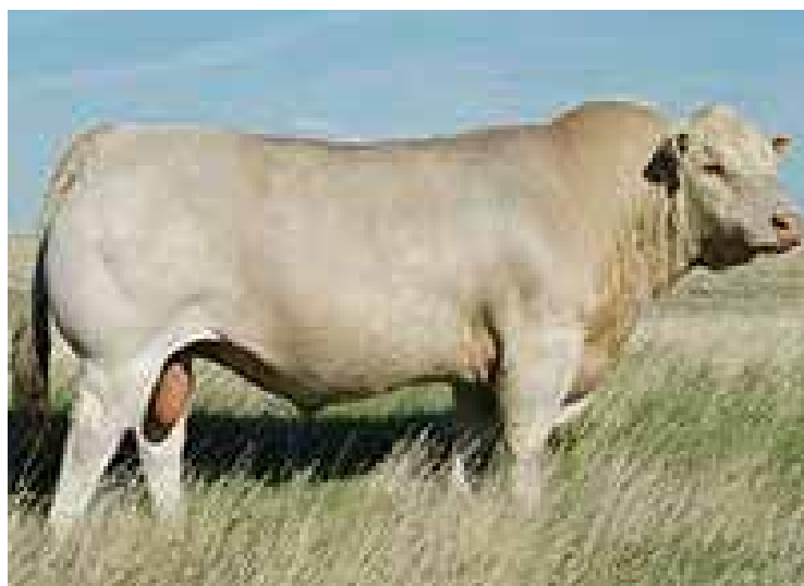
LT LEDGER 0332 PLD SIRE OF LOT 83