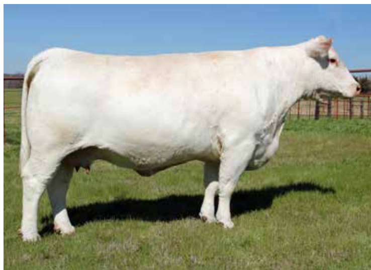
M6 MS NEW NANCY 274 P ET SELLS AS LOT 63

Sells bred A-I on 4/28/20 to M6 Slam Dunk 3115 P ET, safe in calf. This long-necked, feminine heifer offers tremendous value with excellent numbers, stout pedigree, and skeletal correctness. A great combination of light birth weight and good weaning weight impacts her positive profitability ability. Dam's pedigree includes the foundation of WCR Prime Cut and LT Wyoming Wind to insure solid genetics.