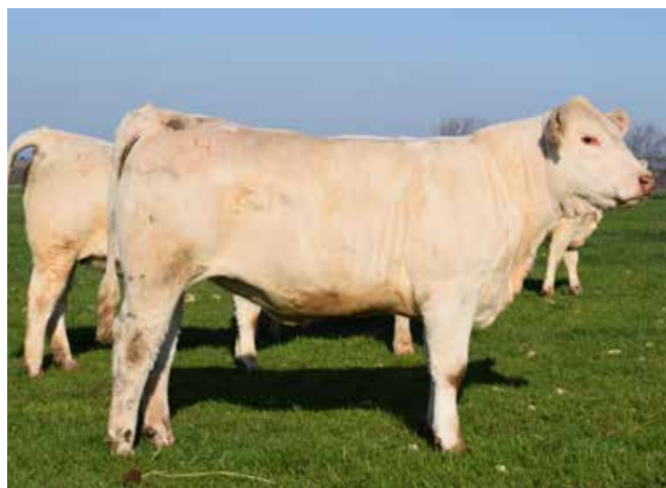
MS PC SANDRA SELLS AS LOT 80

Sells Open , super attractive daughter of the National Champion out of a Sullivan's donor cow. The Easy Pro adds the great milking ability and extra strong maternal ability. She has the classic great lines of skeletal correctness, strong top, extra length, and smooth balance. She ranks in the top 20% for CE, 8% for BW, and 15% REA for breed EPD comparisons. Line-bred Fire Water and Zsa Zsa for added appeal and consistency.