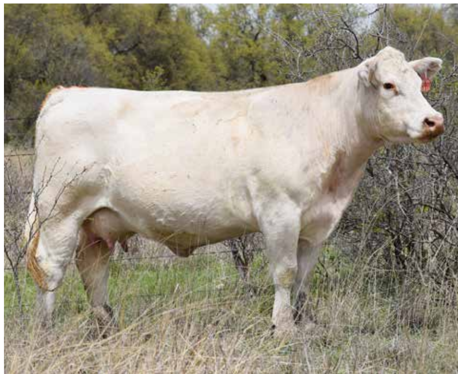
JDJ MS CIGAR B2011

M&M OUTSIDER 4003 PLD BOY OUTLIER 812 ET PLD EM908904 TR MS BERKLY 4711B ET