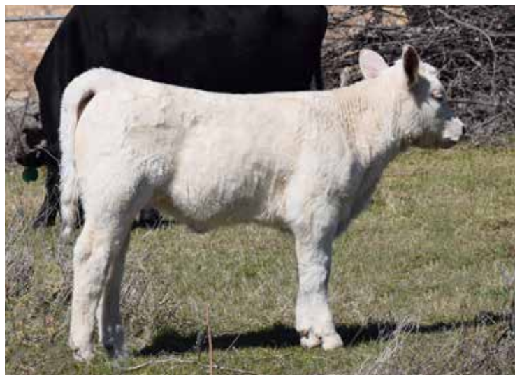
RE MS BRAXTON 980 TAKEN AT 2 MONTHS OF AGE