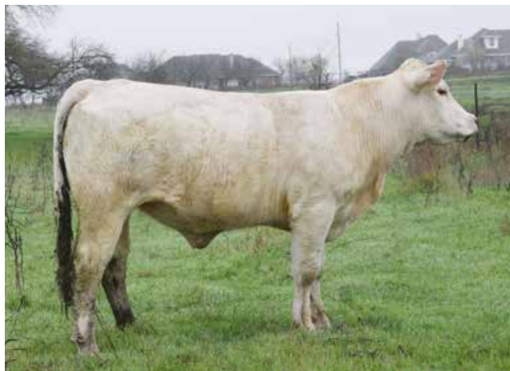
BC MS Y322 ASSET E34 PET SELLS AS LOT 31