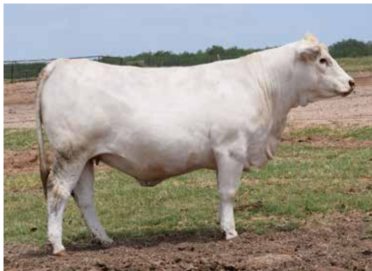
BC DYNASTY'S ASSET E30 PLD SELLS AS LOT 8