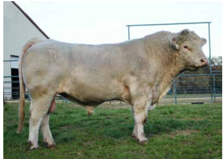
BHD REALITY T3136 P SIRE OF RE REAL WINDY 123