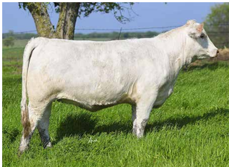
SC MS SLAM DUNK 913 SELLS AS LOT 59

Open Heifer , her maternal granddam is the lot 58 cow, 2004. This broody heifer has it all in a complete package of phenotype, numbers, and pedigree. This stylish heifer has a light birth weight associated with the Assertion addition and rapid growth with Slam Dunk and Reward. You admire the correctness structure, overall volume, and natural thickness of this very broody looking prospect!