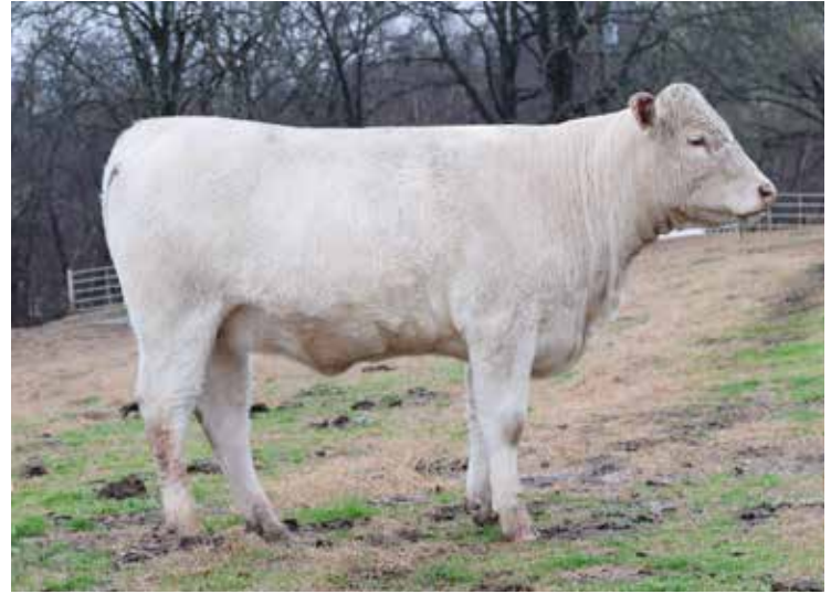
RS MS FRESH NANCY F4529 P SELLS AS LOT 52

Sells safe in calf to A-I date of 12/17/19 to BHD Zen X270 P. A stacked pedigree of very proven genetics and popular throughout the industry. Cigar on Nancy daughters has been one of the great matings that zing! They just work! This well-balanced heifer will add value to any herd, she ranks in the top 15% for WW and REA EPDs for the breed. Zen has been a great calving ease sire and his daughters are excellent in milk production!