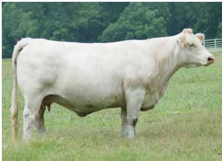
DS MS CIGAR THROTTLE 7302 DONOR DAM OF LOT 70 EMBRYOS