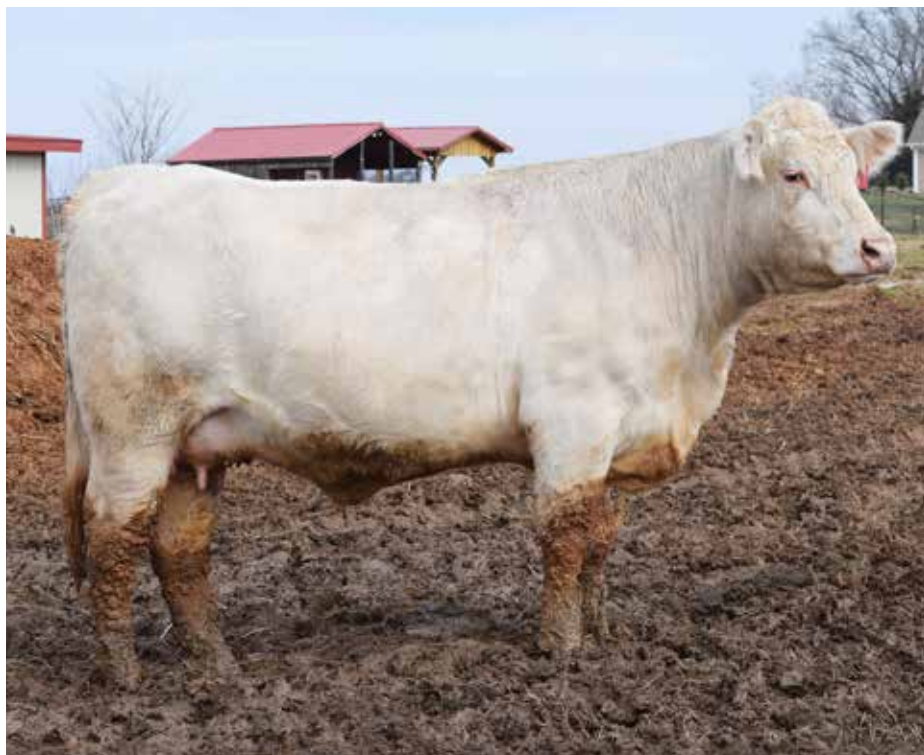
JDJ MS KINCESM D3116

WINN MANS SKAGGS 663X SPARROWS BRAXTON 519C M923351 SPARROWS CASINA 121X