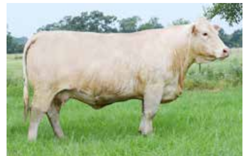
AC MS CIGARS ILLUSION 274

Pick of All Sparrow Bull calves born spring 2020, (January 2020 to June 1, 2020) from all the American Syndicate owners listed below. Not all the owners have bull calves born in this time period, but a list of all potential bull calves will be available before the sale. This remarkable Braxton has sired some of the top selling offspring in Canada. He was the high selling bull in 2016 in Canada at $106,000.00. His gestation period appears to be shorter with smaller calves that grow rapidly with tremendous thickness and eye-appeal. His daughters are becoming well known their maternal ability with superb udder quality and volume. The dams of these choices are some of the "Who's Who" in the Charolais industry. This includes the great donor cow, JDJ Ms Cigar B2011 that had a daughter top the 2019 Sale of Excellence at $9750.00. The Illusion 274 has two super exciting full sibs in the selection. The calf shown in photo is out of a first calf Dutton heifer, calved unassisted with 82 lbs calf. This out-cross offers tremendous and rare opportunity for a forward-thinking operation. Selection must be made by August 1, 2020. Buyer get Full possession, ½ interest, with ¼ interest detained by seller, and ¼ interest goes to all Braxton Syndicate owners. This will get that choice plenty of promotion!