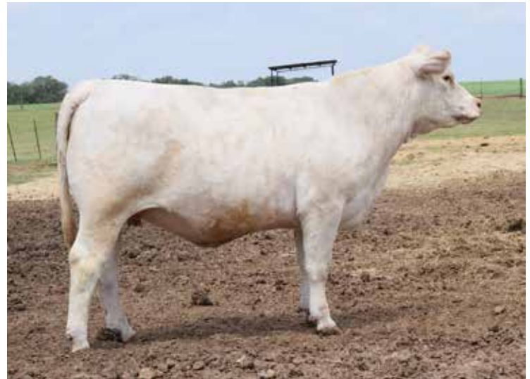
BC DYNASTY'S ASSET E30 PLD SELLS AS LOT 6

Bred A-I on 12/20/19 to JDJ Maximo A18 Pld, (a homozygous Polled sire), Safe in calf. This beautiful designed heifer offers superb size, correctness, and highly feminine with power of volume, depth, and clean, long-necked style. Her sire is also homozygous Polled and is an extremely easy-calving and a tremendous sire of great milking females. A stacked pedigree, her dam is a descendant of the legendary donor, JDJ Ms Dynasty L428!