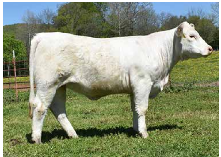
HF MS MAXINE G920 SELLS AS LOT 48