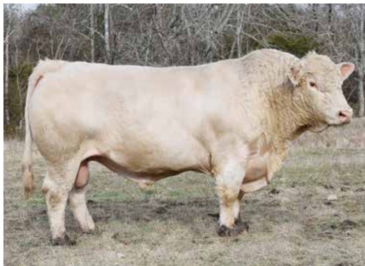
BC E46 DUKE B01 PET "THE DUKE" SIRE OF LOT 55