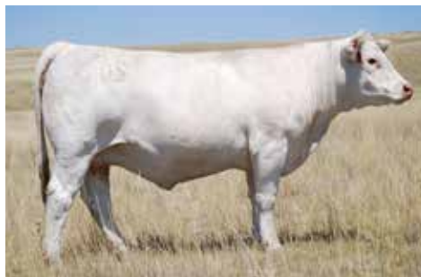
JDJ MS CIGAR B2011