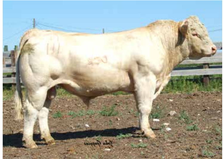
CJC ILLUSION N111 SIRE OF LOT 28

28A: Pld Bull calf # 051, born 5/7/20, BW 82, sired by RE Cigars Dynasty 72 ET, EM911161. Cigar Dynasty is a tremendous appearing sire and should be as a son of the legendary donor cow, JDJ Ms Dynasty L428. This is a very proven mating that has produced offspring in the $10 to $15,000 category. Her dam traces to RE Cigar-Son 497 ET, a son of WCR Miss Mac 9517 ET, a daughter of matron of the Nancy cow family, WCR Miss Duke 8742.