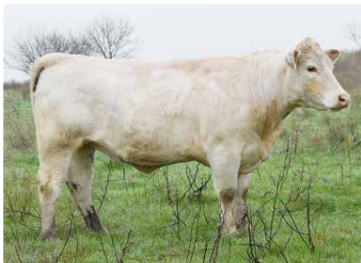
BRP MS COOL DUKE F01 PLD SELLS AS LOT 33