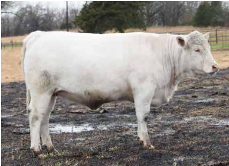
RS MS CIGAR EQUITY 616 SELLS AS LOT 51