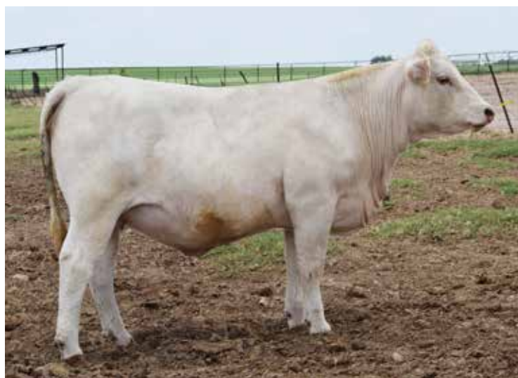
RE 34 MS ZEN 865 SELLS AS LOT 10