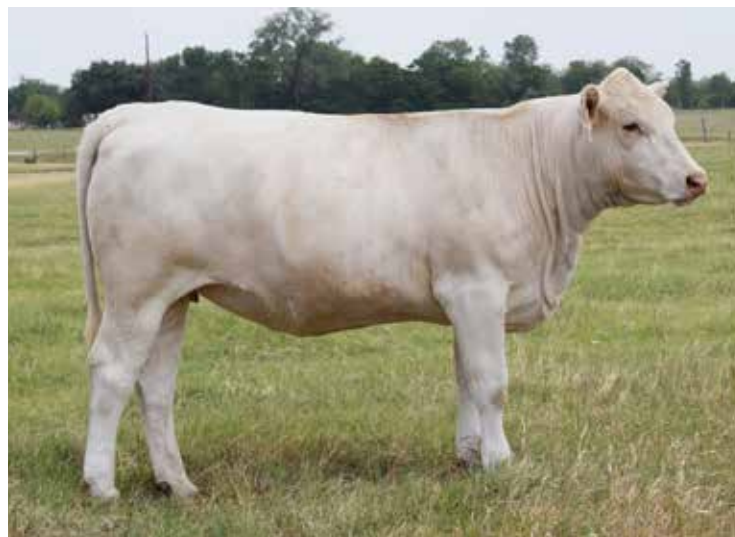
BARA MS MAX CIGAR 58F P SELLS AS LOT 12

Sells Open , this extra-long-bodied, long necked heifer shows tremendous femininity and style. She would be perfect to add to your spring breeding program. Her dam has been a stalwart producer for Arlitt's. A great combination of Cigar on Wienk genetics has worked exceptionally well for many years in the breed. A very stout Polled pedigree is also a great added value. A very good disposition and potential for a great calf raiser!