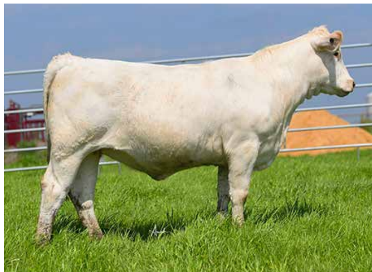
SC MS DOUBLE STANDARD 912 P SELLS AS LOT 60

Sells Open , this line-bred New Standard heifer displays incredible femininity, good bone, and straight top. For numbers she ranks in the top 15% for WW, 7% YW, 15% Milk, 4% MTL, and 3% SC for breed EPDs. In carcass EPDs she also ranks high in CW and REA at top 15% category, 9% Marbling, and 6% TSI. With her light birth weight, growth, pedigree, and numbers this is an ideal selection!