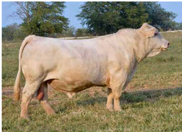
LT RUSHMORE 8060 PLD SIRE OF LOTS 81 & 82

FULL WEEKEND SCHEDULE AVAILABLE ON INSIDE FRONT COVER