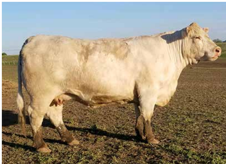
RF ASHLEE 5201 ET SELLS AS LOT 88