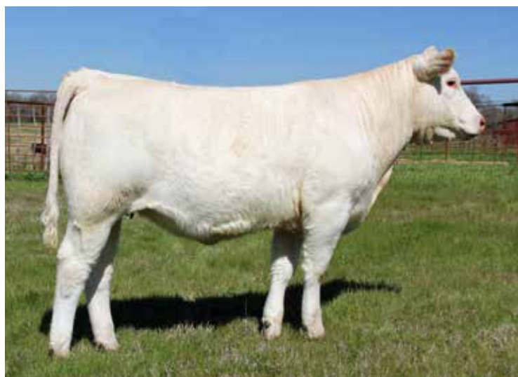
RE3 COOL NANCY 820 SELLS AS LOT 64

Bred A-I on 2/26/2020 to M6 Cool Rep 8108 ET, safe in calf. This is one of the top mating ever conceived at M6 masterful program. The 6100 was the top selling female in the 2013 M6 Sale, to Double-H and North Grove for their elite ET program. A son, M6 Law & Order 577 topped the 2016 M6 Bull sale at $19,000. This mating to Cool Rep would duplicate the M6 Law & Order bull, giving you a full sib to that $19,000 sire. You can make lots of choices in breeding cattle, but this is definitely an easy choice to consider owning the best available.