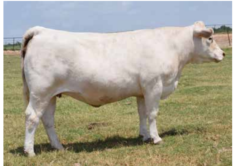
CWC ALI 802 SELLS AS LOT 18

Sells bred A-I on 2/20/20 to JDJ Maximo A18 P, Safe in calf. Ranks in the top 10% for Milk EPDs, and top 20% for MTL in breed comparisons. A big boned, deep-bodied heifer with worlds of muscling and volume. A very broody heifer tracing to many of the top lines in the breed. H116 is dam of LOF/VPI Abraham for instance. M76 is a premier donor for Bamboo Farms with nearly 60 calves registered with AICA. Great genetics here!