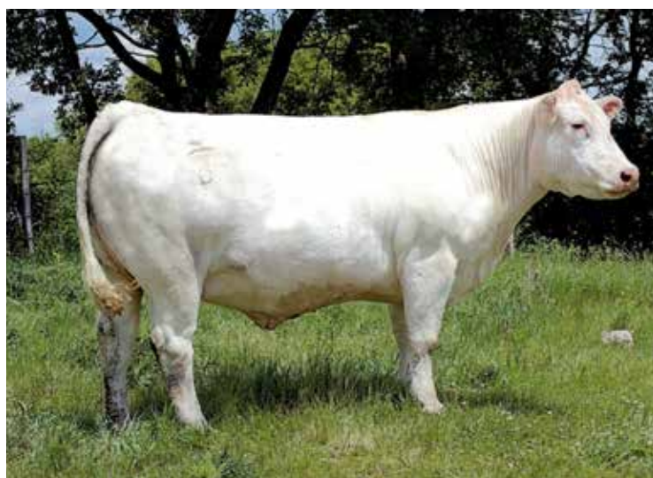
JDJ MS CURLIN X161 DONOR DAM OF LOT 76 EMBRYOS