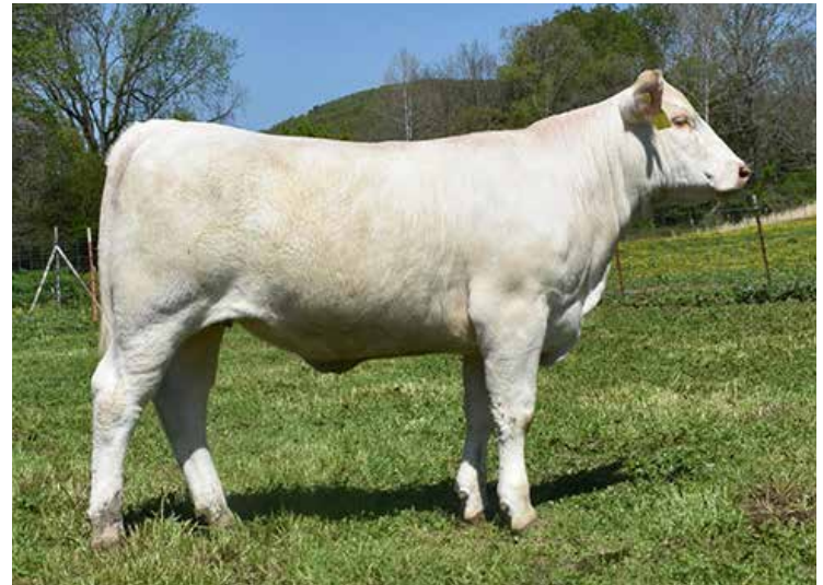
HF MS REMEDY GD423 SELLS AS LOT 47