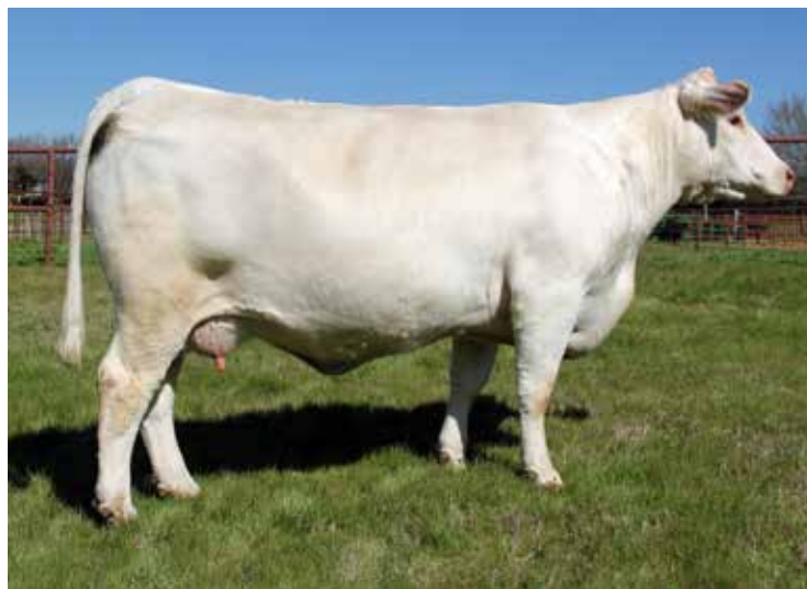
HE WB MS GRID MAKER C331 SELLS AS LOT 65

Held Open for flushing , her dam is one of the most powerful mating to come out of the S.E. as a full sister and dam, 2070 Cigar topped the Southern Connection sale going to Bruce Roy. Her dam 331 is now in the Hudspeth and Benton ET program. C331 ranks in the top 5% WW and YW, top 20% Milk, and 4% for MTL and for carcass EPDs ranks in top 25% CW, 15% REA, 5% FAT, and 7% TSI for EPD comparisons. A royal pedigree, numbers, & looks!