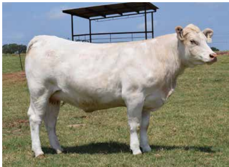
RE MS MAXIE CIGAR 822 ET SELLS AS LOT 11

Sells bred A-I on 12/20/19 to BHD Zen X270 P. Here is an interesting reverse of what we saw in lot 10, a Zen bred to Maximo and here a Maximo bred to Zen. These two would be awesome additions to any herd! Maximo bulls are loved by commercial breeders and are usually the "first-picked" out of a bunch. They are very correct, thick, and long bodied. This tremendous heifer is already showing great udder design and superb femininity!