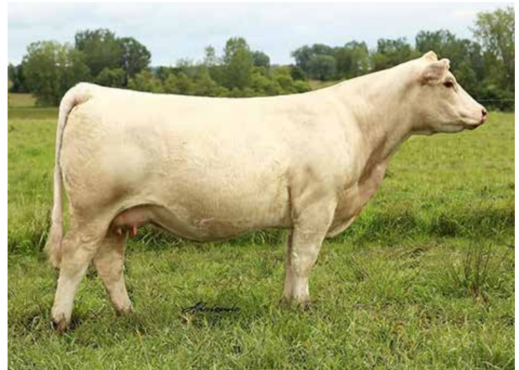
2H MS MARION 4003 P ET DAM OF LOT 73 & DONOR DAM OF LOT 72 EMBRYOS

Sells bred A-I on 11/26/19 to CCC WC Resource 417 P, safe in calf. Enviably presentation of the embryos offered in lot 72! Bred to one of the more popular bulls in the industry that has a track record of producing winning and high selling progenies. This attractive package offers a unique ability to see a combination of some of the most influential genetics in the breed. She also ranks in top 15% Milk, REA, and FAT EPDs for the breed EPDs.