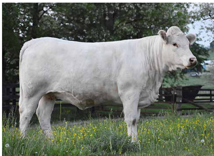
CS MS PRESIDENT DZ12 P DAM OF LOT 16

Sells Open, this young heifer displays excellent structure and composition. Her dam has been a very productive cow, and traces back to the Y790 cow at DeBruyckers that produced their herdsire, LHD Establish M826. He was one of the largest bulls ever used there and magnificent in appearance. Asset is impressing breeders with his calving ease and milking ability of his daughters. Asset is a homozygous Polled sire.