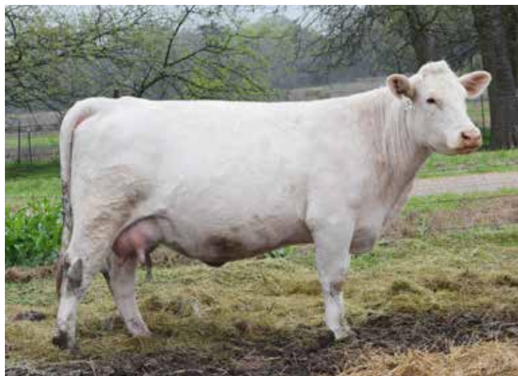
RT MISS CAMERON 3/113 SELLS AS LOT 44