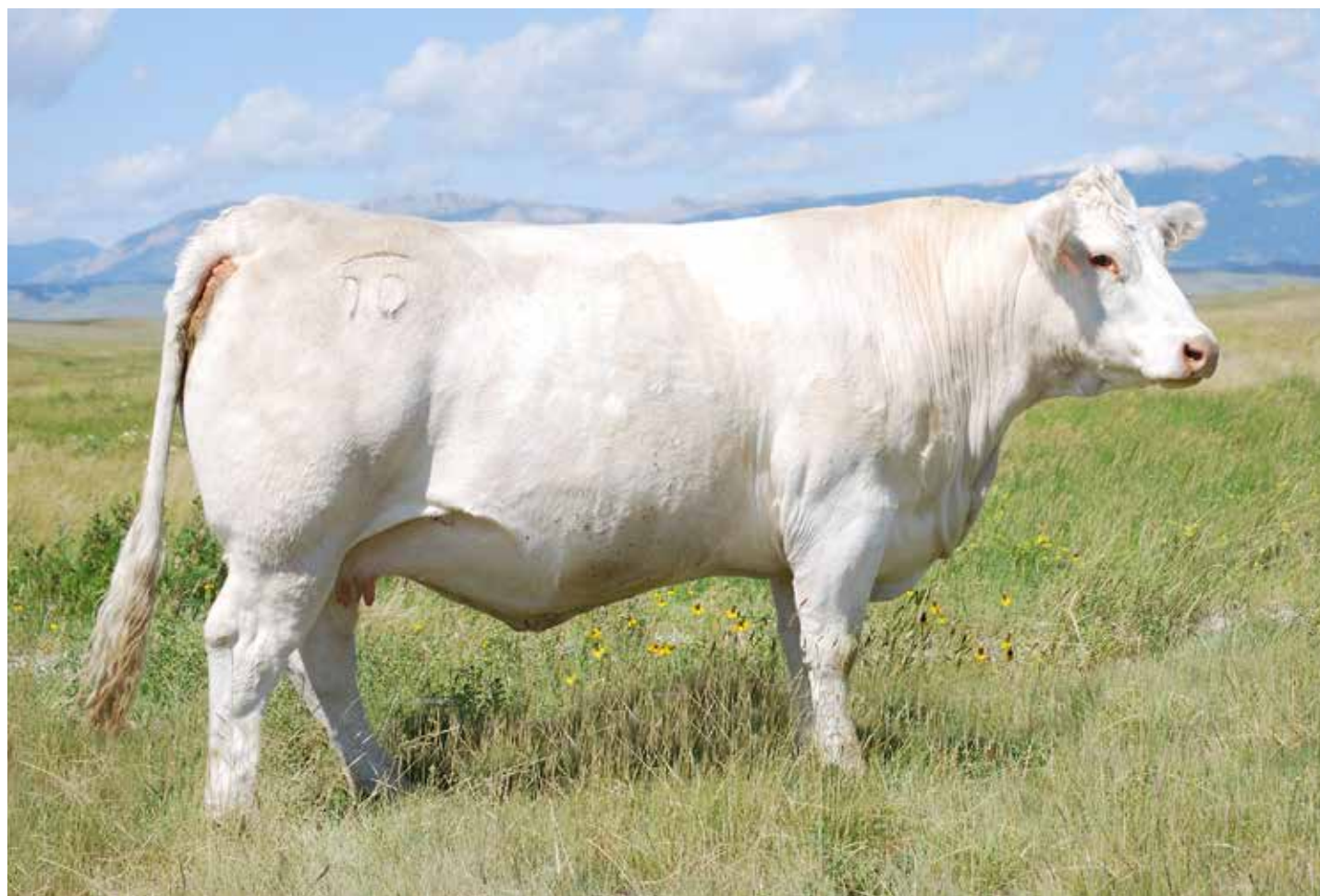
BHD MS COBALT Z767