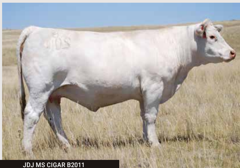
JDJ MS CIGAR B2011 DONOR DAM OF ET HEIFERS

Maternal sibs to high selling heifer in the 2019 Sale of Excellence! Lot 3