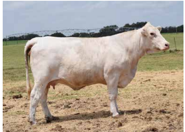
BARA MS ANGEL ASSET 67D P SELLS AS LOT 6

6A: Pld heifer calf # 43G, born 12/9/19, BW 72, sired by Sparrow Braxton 519C. Bred A-I on 2/21/20 to DC/BHD King F2503 Pld, (another homozygous Polled sire), Safe in calf. A very feminine, stout-made cow, her sharp heifer calf at side shows her elite productive ability. Her maternal granddam, Legend H124, produced a $10,000 Cigar heifer for Double-H in a previous Sale of Excellence sale. More Dynasty influence as well!