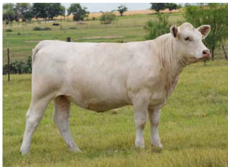
BARA MS W156 MAX 59F P SELLS AS LOT 13

Sells Open , dam is a full sib to JDJ Smokester J1377 P ET. This shows in her top 9% Milk EPD and MTL of top 10%, and top 4% REA for breed comparison EPDs. A beautiful designed heifer, correct, with long, straight back and square hipped, good depth of body, and long clean neck. She will be a great addition to any herd. Just right in age to go into a spring breeding program. Straight DeBruycker genetics from years of development!