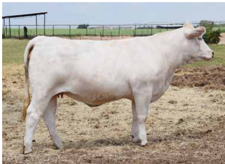
BARA MS EQUITY PRESIDENT 16F P SELLS AS LOT 9