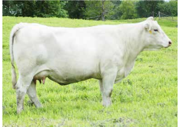
D&D MS CLARICE 2809 PLD ET DAM OF LOT 23

Sells bred on 1/14/20 to Sparrow Braxton 519C. 860 displays the extra femininity, lone, clean neck and front end associated with Clarice offspring. She has good udder development and the volume you expect in a President daughter. She has good balanced numbers across the board for calving ease, growth, milk, and muscling. The Braxton mating is a major value in selecting any female bred to him!