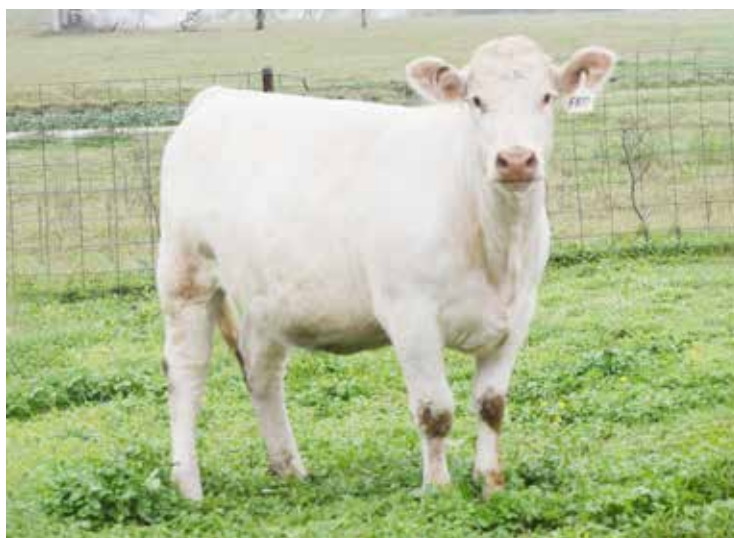
HEH MS RUSH DUKE F710 P SELLS AS LOT 42