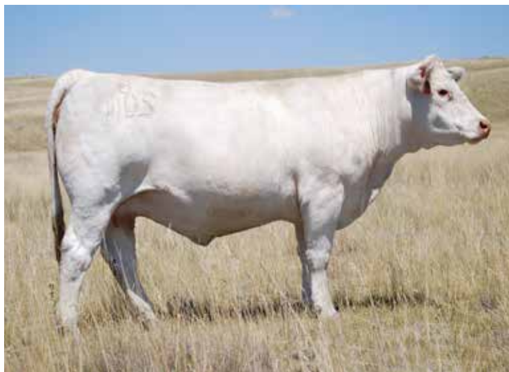
JDJ MS CIGAR B2011 P DONOR DAM OF LOT 93 & 94 ET BULLS