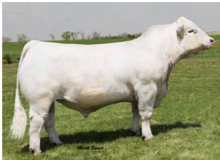
TR PZC MR TURTON 0794 ET SIRE OF LOT 37 EMBRYOS