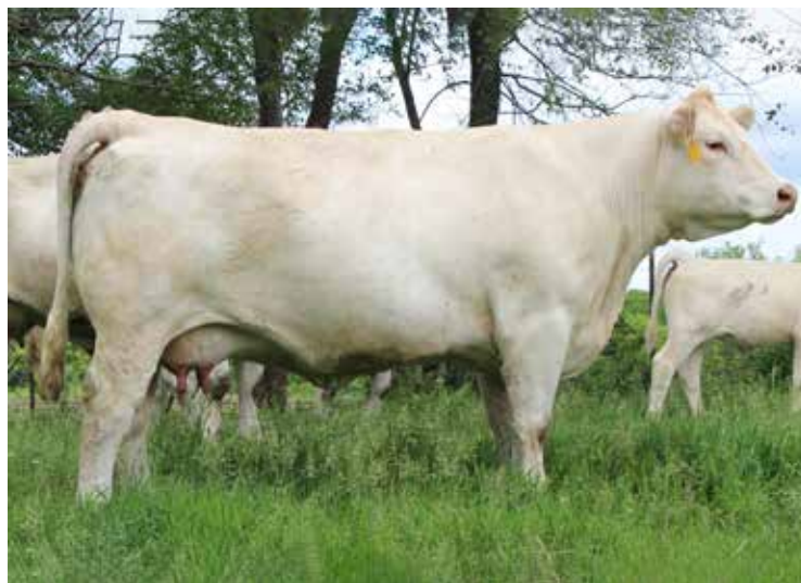
SM MS SMOKESTER Y150 P DONOR DAM OF LOT 91 ET BULL CALF

ET Bull calf sells with Angus recip cow PE to Charolais bull. Full sib to lot 89 gives you an opportunity to invest in both, grow them out in your environment and management and select the one you like best or use both to develop a very uniform herd. Same great numbers and you can evaluate the consistency of this mating.