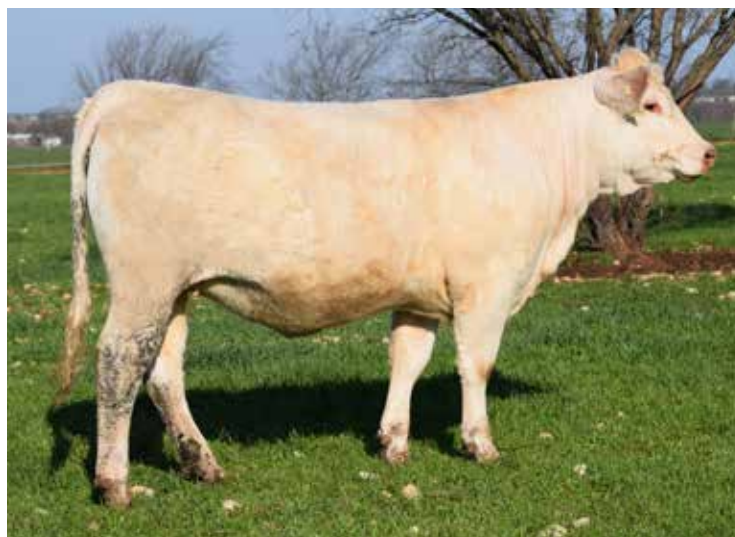
MS PC DIAMOND EDITION SELLS AS LOT 78

Sells Open , this big, bold heifer is out of the high selling Milestone bull and a full sister to TR PZC Mr Turton 0794 ET, an AICA National Champion bull. There are many more high selling full sibs out the great producer, Thomas Ms Impressive 0641! Good balanced numbers on this wide-bodied, thick heifer will enable you to combine the ultimate in pedigree, performance, and numbers to have a major influence in the whole breed if you desire!