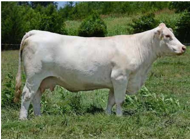
M6 MS E46 QUALITY 4241 PET DONOR DAM OF LOT 49 EMBRYOS