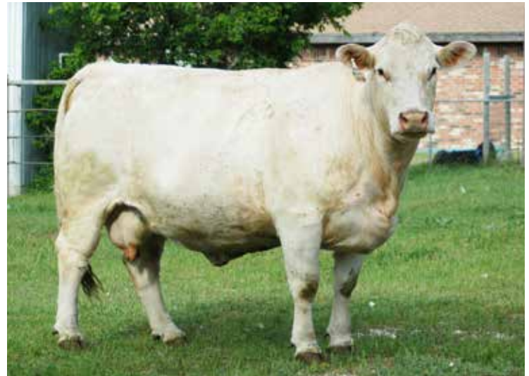
D&D MS WINDY 2816 PLD ET DAM TO LOT 36 AND FULL SIB TO THREE TREES WIND 0383

Sells bred A-I on 12/15/19 to LT Landmark 5052 Pld. You quickly notice her dam is a full sib to Three Trees Wind 0383! A big-time young cow with proven credentials for efficient production and name recognizable pedigree for good merchandising ability. Landmark has the good calving record of LT Long Distance, sire of Landmark's dam. President daughters are tremendous producers with superb milking ability!