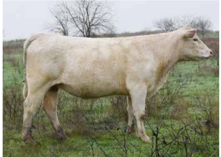
BC RESOURCE'S DREAM F06 PET SELLS AS LOT 34

34A: Pld heifer calf born 5/21/20 sired by BRP Zen Max F02 Pld, M911608. Zen Max is a BHD Zen X270 P son out of a great Maximo daughter tracing back to Three Trees Nancy 9126 ET. This gorgeous heifer has the eye-appeal associated with the Resource 417 offspring. Extra length, long, clean neck, good bone, and straight top-line. She ranks in the top 15% for Milk, 8% MTL, 15% REA, and top 35% for Marbling EPDs for comparisons.