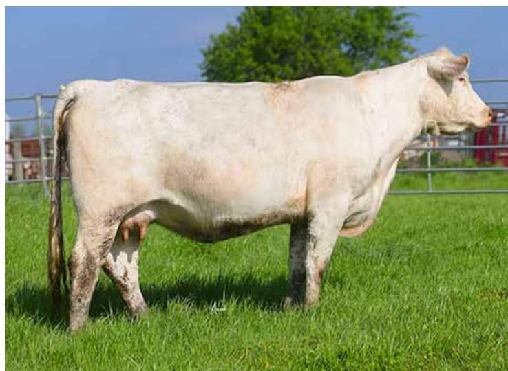
SC MS REWARD 4008 P SELLS AS LOT 58

Sells Open , this \frac{3}{4} sib to lot 55 would be an excellent opportunity to add two uniform heifers in designing a true breeding program. Her balanced EPDs shows her to be a solid and reliable producer. The more of these Duke daughters you see in production, the more you will want them in your herd. Cookie Cutter traces back to Mac 2244 and Duke 914 for solid foundation pedigree.