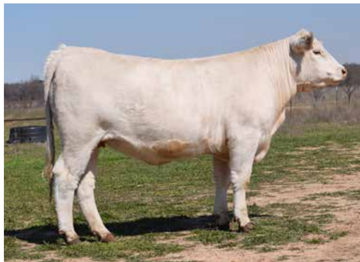
RE MS B2011 MAXIE 896 P ET SELLS AS LOT 20