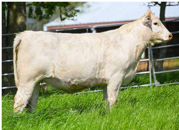
SC MS REWARD 806 P SELLS AS LOT 62