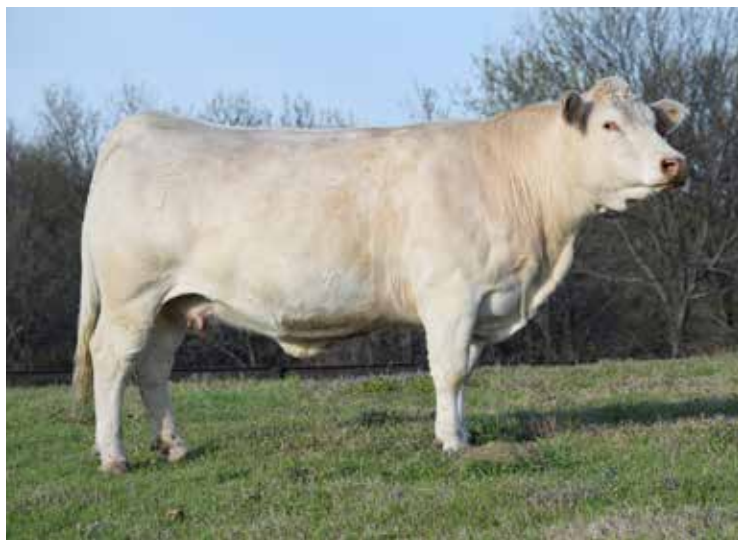
JDJ MS TRUEMARK Y322 DONOR DAM OF LOT 96 & THE DAM OF JDJ MAXIMO A18P (HOMOZYGOUS POLLED)