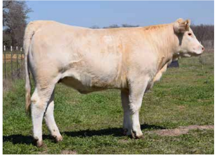
RE MS PRESIDENTIAL 885 ET SELLS AS LOT 22

Sells bred A-I on 4/18/20 to Sparrows Braxton 519C. Tremendous volume, depth and spring of rib, strong top, good bone with plenty of growth and performance. A very practical birth weight associated with performance genetics. The pedigree on these 3 daughters of B2011 is loaded with supreme Charolais genetics. The N290 Smokester cow is in Jerry Maltby's top herd, CA. R120 has made the top of the list in DeBruycker 2000 + cow herd.