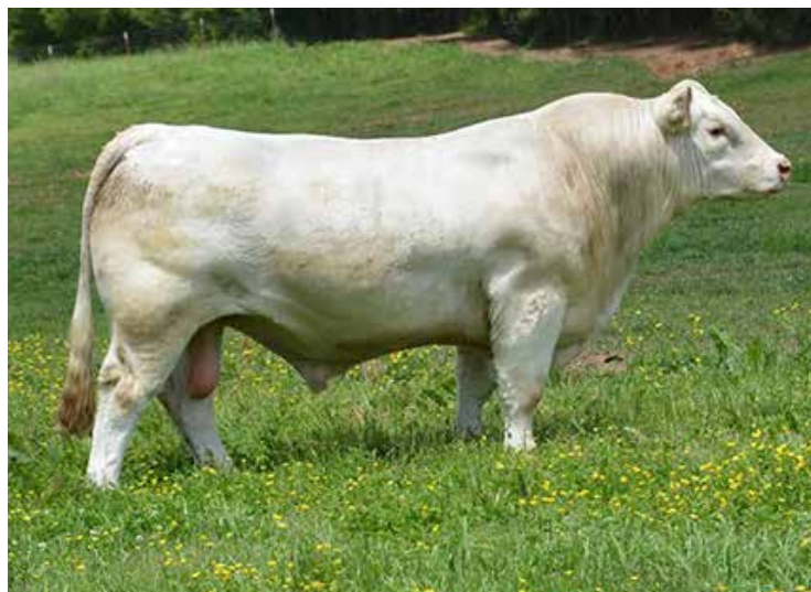
JDJ MAXIMO A18P $60,000 SON OF JDJ MS TRUEMARK Y322 AND MATERNAL SIBS TO ET CALVES, LOTS 95 & 96

DUE August 2020, Recipient is a black cow. A full sib mating to Lot 95, again, gives you a fantastic choice to move a program to the very top of the chain. Y322 is one of those wonder cows! She actually raised twin bull calves one year that weaned over 650 lbs each. She has a perfect udder, is a big powerful cow with great disposition, sound, correct, and the kind that you would like to have all your cows created in the same image.