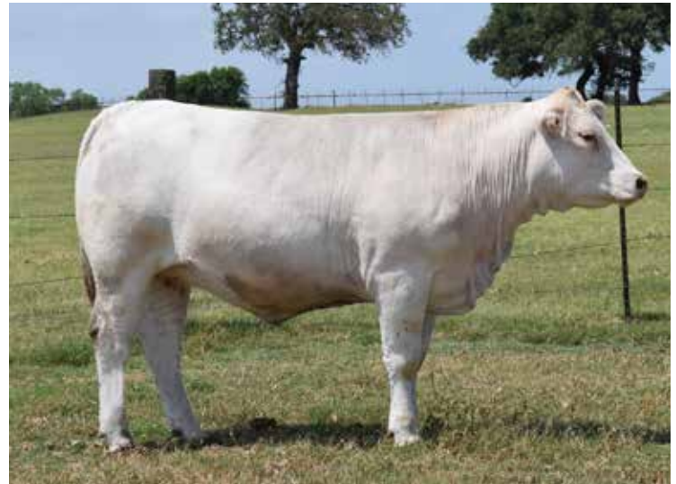
LWF MISS REAL COMMANDER 137 SELLS AS LOT 17

Sells bred A-I on 12/20/19 to BHD Zen X270 P, Safe in calf. Another big, voluminous heifer with lots to offer a performance program. Possess good numbers with light birth wt and her dam is out of a full sib to JDJ Smokester J1377 P ET. Reality is a maternal sib to BHD Zeus X3041, another premiere sire of DeBruyckers. His daughters have made superior producers. Commercial cattle people readily accepted his sons!