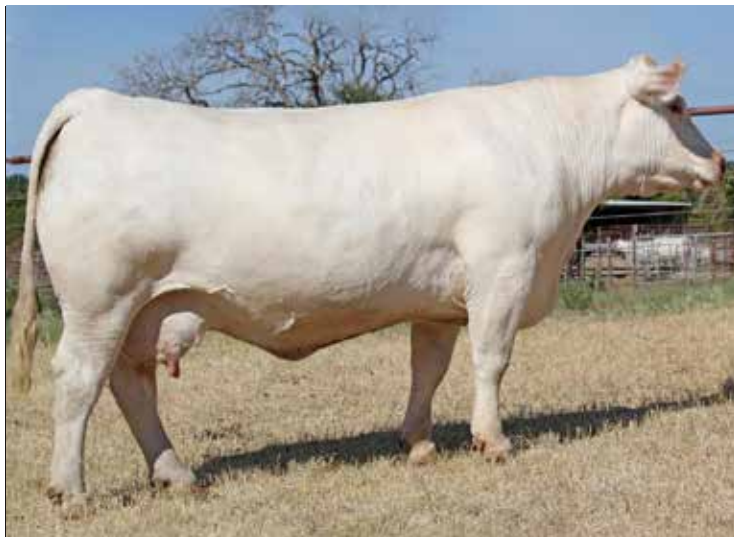
M6 MS CASH 691 DONOR DAM OF LOT 40 EMBRYOS

Sells bred 5/25/20 to HEH Silver Star C200 P ET. An own daughter of the $15,000 RE Ms Duke 745 ET female that topped a previous Sale of Excellence along with her heifer contributing another $2500.00. She descends from the highly successful donor, RE Ms Duke 34 ET, a direct daughter of the incomparable CR Miss Duke 172, the $20,000 Creighton Ranch Dispersal highlight! She ranks in the top 8% CE, 15% BW, 4% Milk and MTL for breed comparison EPDs. Silver Star is out of a "Pick of DeBruycker herd", donor cow BHD Ms Silverlite P232!