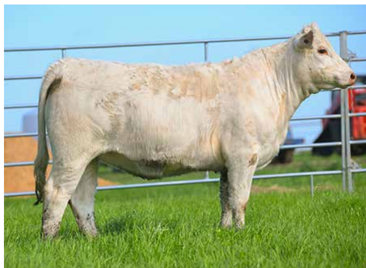
SC MS EASY COMMANDER 856 P SELLS AS LOT 61

Sells bred A-I on 12/29/19 to CCC WC Resource 417, safe in calf. Another fantastic performance heifer with eye-appeal and numbers. This very thick, deep-bodied power heifer is destined for greatness. She ranks in the top 20% for WW, 15% WY, 25% MTL, 20 % for CW, 15% REA, 30% Marb, and 10% TSI for breed EPDs. A stacked pedigree of some of the most influential cattle in Charolais is definitely a positive.