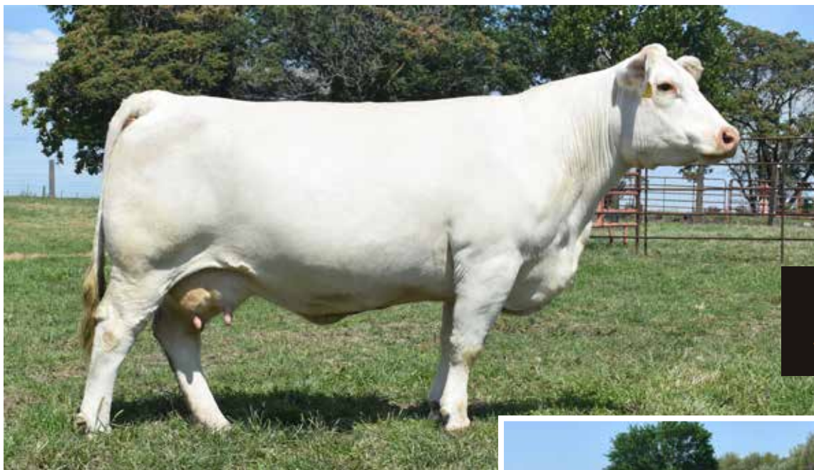
RS MS DUKE 745 ET FEATURED DONOR SIX OF HER DAUGHTERS SELL