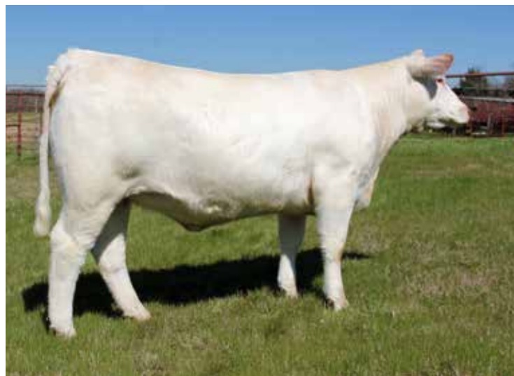
RE3 MS GRIDMAX 89 P SELLS AS LOT 66

Bred A-I on 3/12/20 to M6 Cool Rep 8108 ET, safe in calf. A Maximo daughter out of lot 65 makes this a great addition to the program. She also ranks high in numbers, top 20% WW, 25% YW, 15% Milk, 6% MTL, 10% CW, 15% REA for EPD comparisons. Cool Rep mating will be an exciting addition to this high profiling heifer. 809 has the broody eye-appeal, a big, thick, deep-bodied and straight topped, feminine appearance of winner!