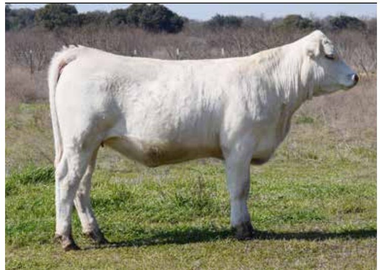
REMAX MILESTONE 898 SELLS AS LOT 30

Sells Open , a very broody heifer with strong top, good depth of body, quiet, and moderate frame. Her dam is an excellent Maximo daughter from mating to a top-end Cigar 3022 cow. Cigar 3022 was a full sib to LHD Cigar E46. Milestone, one of the highest selling bulls in the Charolais industry is heavily used all over the U.S. This blend is an excellent example of masterful mating. This superb female would make a great club calf cow.