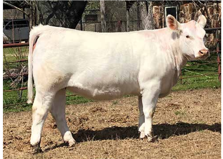
DCF SILVER AND GOLD 1118 SELLS AS LOT 46

Sells Open, halter-broke. Stunning show prospect, perfectly balanced, correct, long-bodied, straight topped with abundant volume and muscling. She ranks in the top 15% for WW EPDs, top 30% for YW and MTL. Started with a very desirable Birth wt., and rapid growth afterwards. Descends from a very strong cow family of line-bred Germaine, Relentless, and LHD Mr Perfect Y416. Will make an awesome breeding cow from a proven outfit