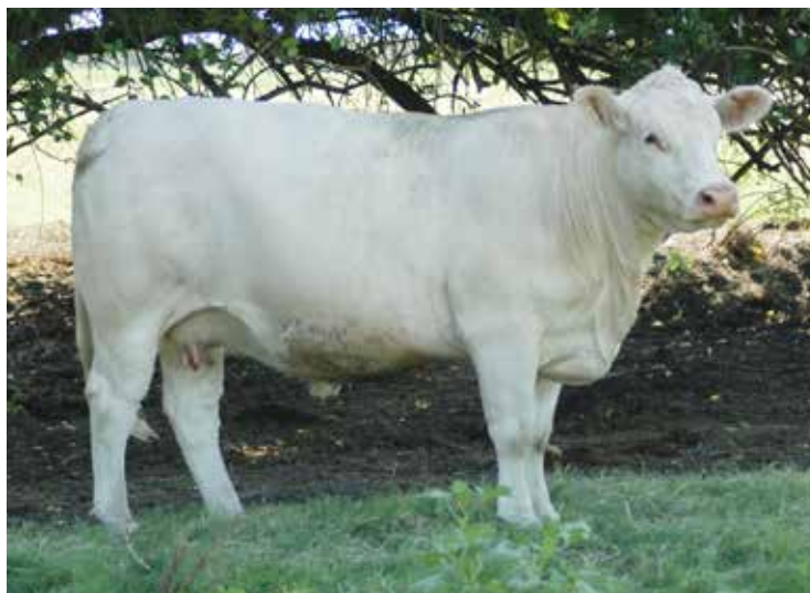
BC MS PERFECT MARK P ET DONOR DAM OF LOT 41 EMBRYOS