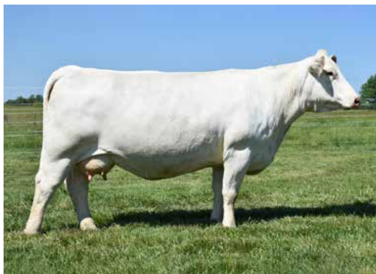
M&M SAVANNA 9009 PLD ET ONE OF THE TOP LOTS IN THE 2019 SALE OF EXCELLENCE