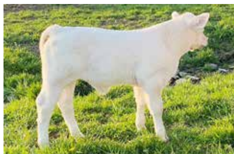
82 LBS BRAXTON OUT OF 1ST CALF HEIFER