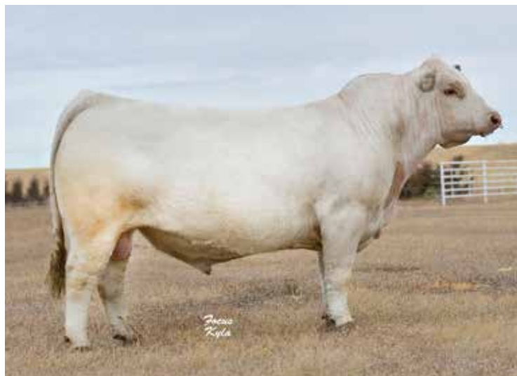
M&M OUTSIDER 4003 PLD SIRE OF LOT 32