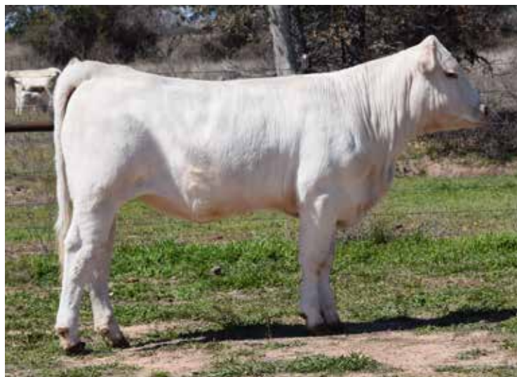
RE LADY CIGAR 904 ET SELLS AS LOT 26