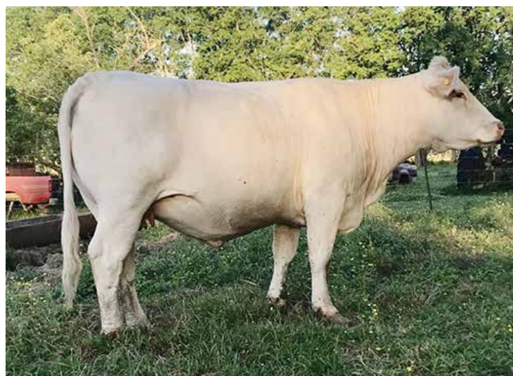
AC MS SOUTHERN SMOKE 501 PLD SELLS AS LOT 67

Bred A-I on 1/19/20 to CJC Illusion N111, safe in calf. A full sister sold to Larry Price in the 2015 sale for $7,000.00. 501 is a very smooth, feminine front-end, long-necked cow with extra udder quality and ability. If you're looking for carcass ability with milk, 501 ranks in top 5% for REA and 1% for FAT EPDs in the breed. The Illusion blend should result in an outstanding thick, performance calf, with extra eye-appeal. Great Pedigree!