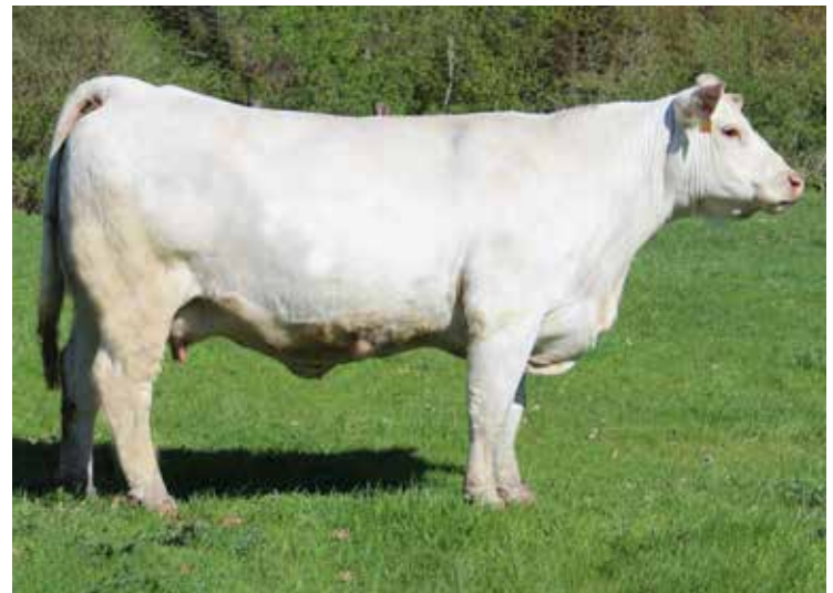
DOUBLE-H METALLIC 2034 ET SELLS AS LOT 74

Due to calve 10/31/20 to RBM Fargo Y111, EM809088. Metallic's dam, 9K, was the Grand Champion at the very competitive Manitoba Ag Expo before coming to Double-H. She was also the High Selling female at a previous Sale of Excellence. Metallic 2034 won Championship at the Minnesota Fair and her daughter Precious Metal was Reserve Grand at the MN State Fair. The top end Reality daughters are awesome females!