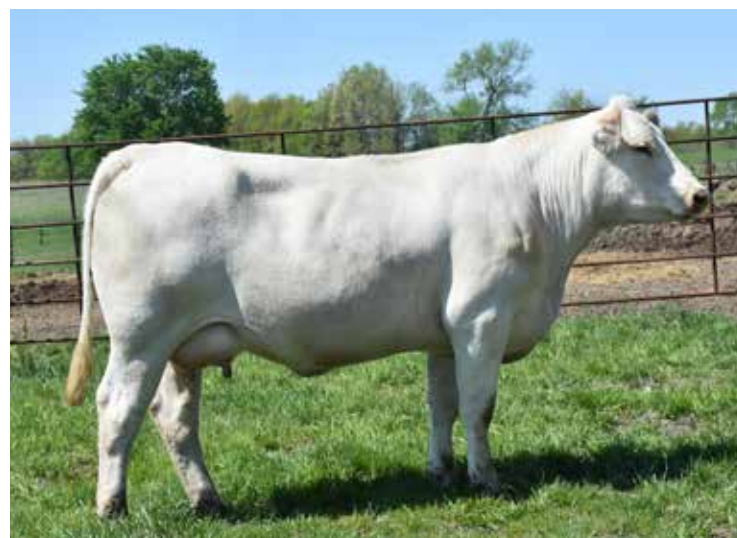
LCC TEXAS WHITE SQUAW 2748 SELLS AS LOT 85

85A: Pld heifer calf, born 1/5/20, sired by WR Foreman D602. Bred A-I to DC/CRJ Tank E108. A full sister to Lot 84, this young female is doing her job! Calving at 22 months of age and breeding back! She has cow power in the blood stemming back to the matrons stacking 3 generations of highly proven donors for everyone who owned and shared in the progeny! Enhanced with genetics for marbling, calving ease, and a perfect udder.