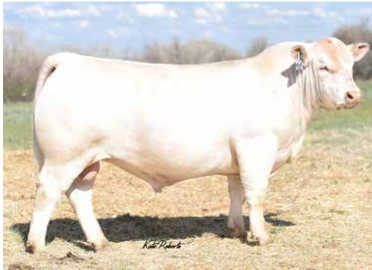
PVF RDIGE 7142 SIRE OF LOT 87 EMBRYOS