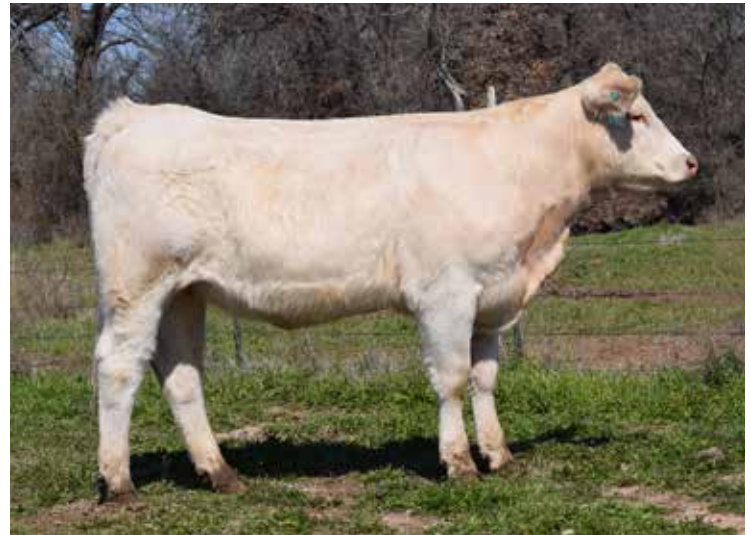
LWF DUKE'S DUTCHESS 239 SELLS AS LOT 29