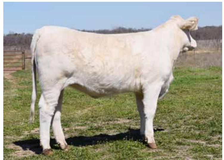
RE W950 ALEXA 914 ET SELLS AS LOT 19