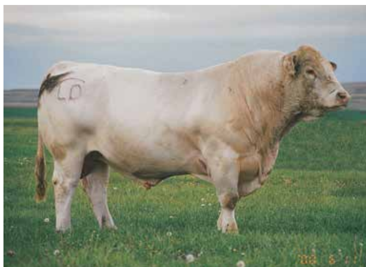
LHD CIGAR E46 SIRE OF LOT 77 EMBRYOS