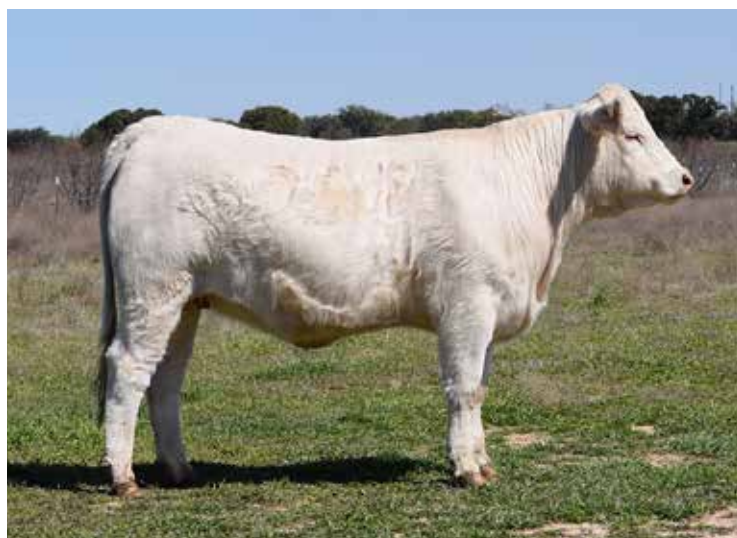
RE MS ZEN 890 SELLS AS LOT 27