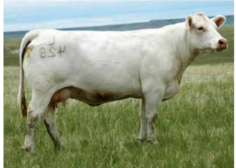
JDJ MS DYNASTY L428 DONOR DAM OF LOT 53

53A: Pld heifer calf # F1, born 9/23/19, bw 88, sired by BHD Zen X270 P. Bred A-I on 12/16/19 to CJC Mr President T122, Safe in calf. An own daughter of the legend, JDJ Ms Dynasty L428. She has sold several progenies that have topped sales. Asset continues to establish as a calving ease and milk producer on his progenies. The heifer calf is absolutely sharp and will be worth extra value with her stout pedigree to match.