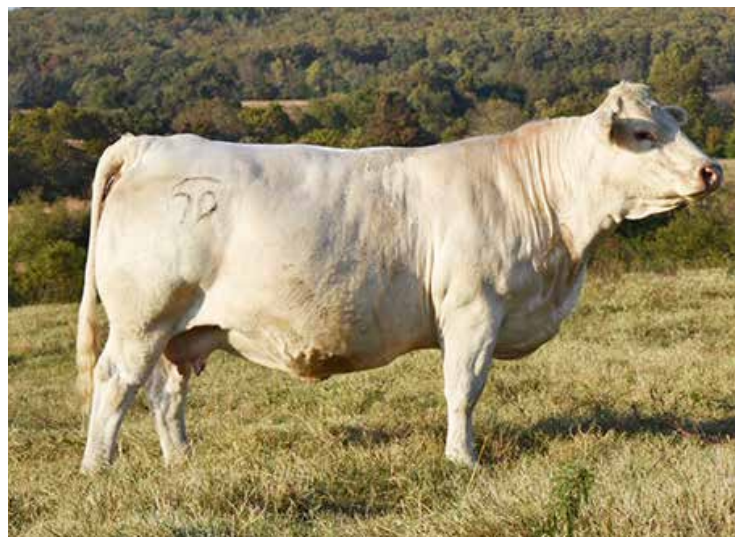
BHD MS ILLUSION S1760 DAM OF LOT 97

Sells bred A-I to DC/BHD King F2503 P. King is a homozygous Polled sire. His first calves are awesome to say the least. FS1760 is a large, performance heifer with tons of volume, natural thickness, and style! He dam was a Pick of the Herd from DeBruycker. Her dam is a paternal sib to BHD Reality T3136 and BHD Sly Illusion T3132. The E197 TW is the dam of Camp Cooley's $21,000 Pick of DeBruycker herd, the JDJ Ms Perfect G166.