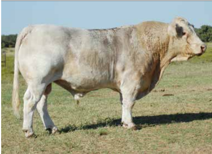
RE COMMANDER 260 P ET SIRE OF RE MS PERFECT COMMANDER 209