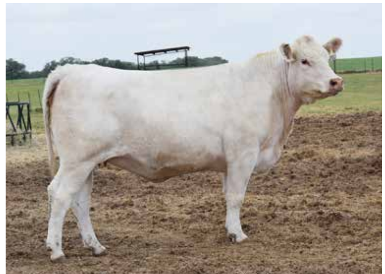
BMCD MS CLARICE-SSET PET SELLS AS LOT 7

Sells bred A-I on 12/20/19 to JDJ Maximo A18 P, Safe in calf. Out of the great donor, Clarice 2809, an elite daughter of JWK Clarice J139 ET. 2809 has proven to be one of the greatest daughters of her dam J139. A Cigar daughter, bred by Arlitt & Evans, out of 2809, was 2nd High selling lot in the 2017 M6 Dispersal Sale at $21,000, going to Shepherd Charolais, IA. This tremendous prospect can add that extra sound genetics to your program.