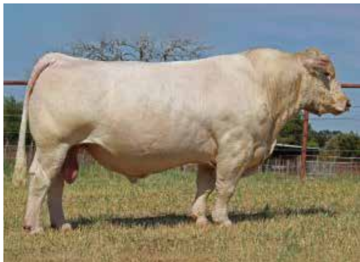
M6 COOL REP 8108 ET SIRE OF LOT 43