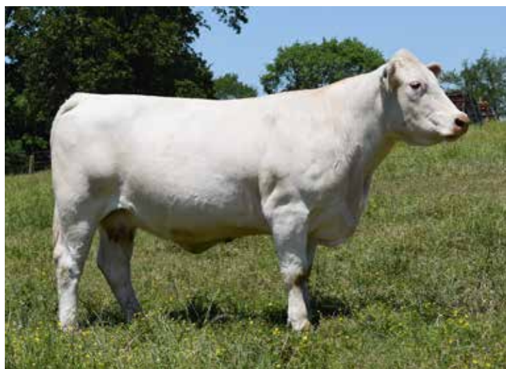
JDJ MS ZENELIN B883 P SELLS AS LOT 46