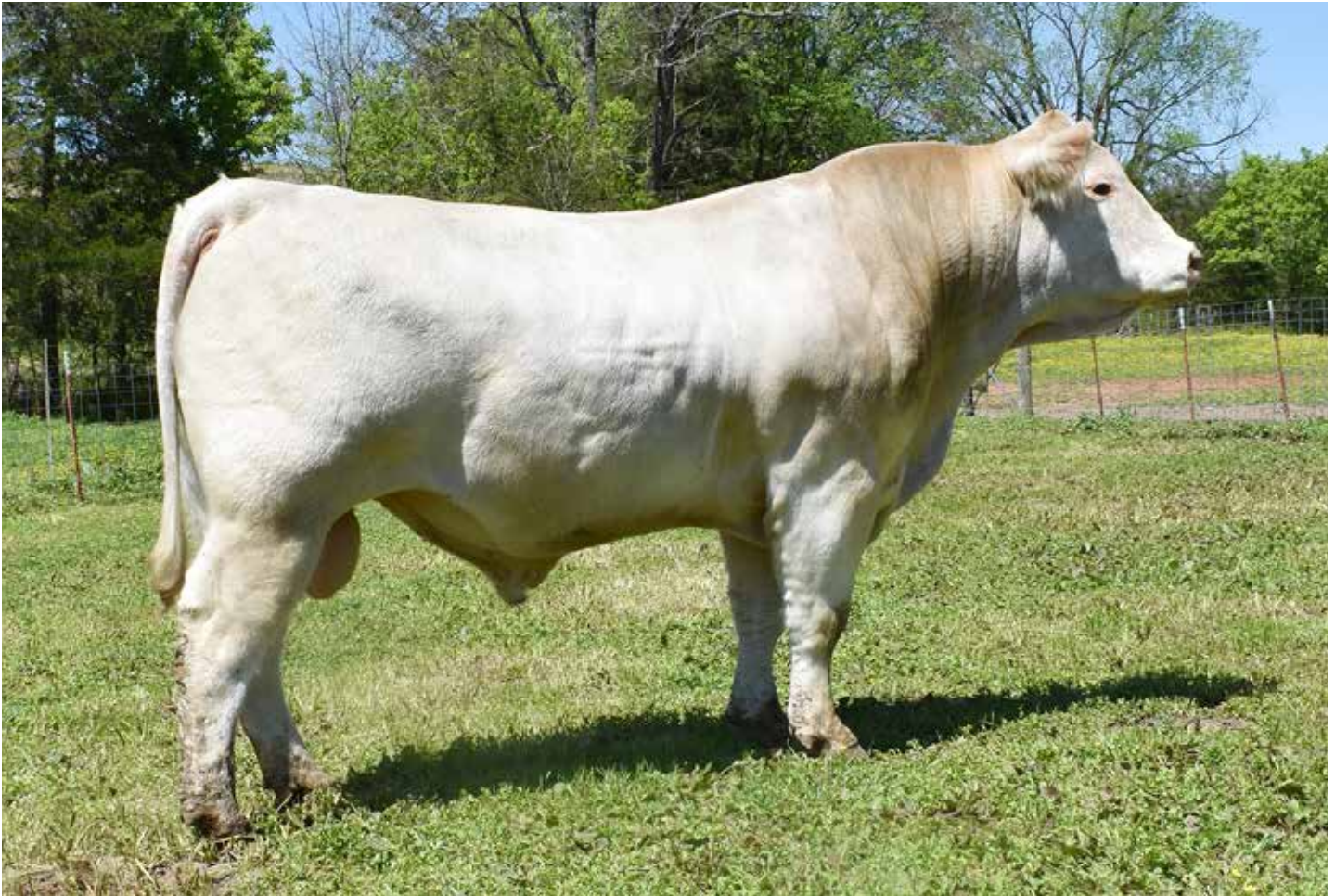
DC/BHD KING F2503 P