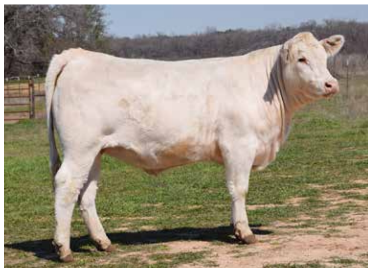
RE B2011 MAXIE 844 P ET SELLS AS LOT 21