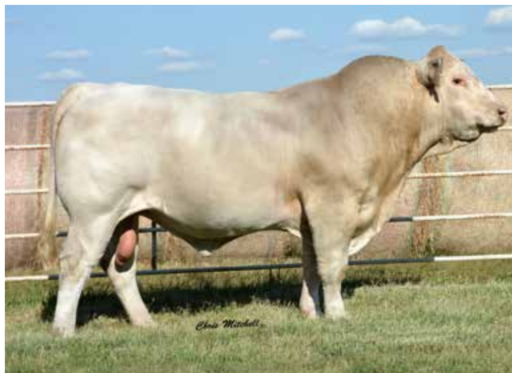
BHD ASSET B178P SIRE OF LOT 38 EMBRYOS