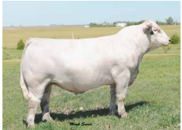
RBM TR RHINESTONE Z38 SIRE OF LOT 72 EMBRYOS AND LOT 73

Ms Marion is from the record setting Marion cow family that has produced many Champions and sale topping lots. This mating should provide great show prospects with super values. Marion is a +28 Milk to rate in top 1% for Milk, a +41 in MTL to rank in top 1%, top 1% for REA and FAT blended with Rhinestone that ranks in top 15% for Marbling EPDs. This masterful mating grants you a terrific opportunity to invest in winning progeny!