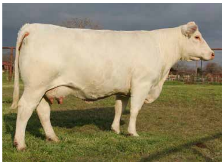
M6 MS 761 NANCY 6100 P ET DONOR DAM OF LOT 92 ET BULL CALF