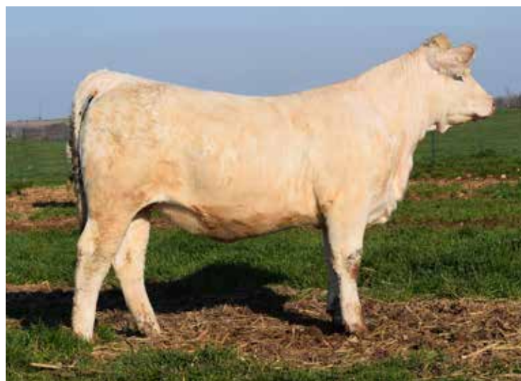
MS PC GEORGIA 1820 SELLS AS LOT 79

Sells Open , a perfect pattern of many champions sired by the exclusive Outsider 4003. This heifer has that extended, feminine neck, big square hip with more bone and big feet. Her heavy milking dam, a President daughter, adds the extra milking ability and size. She has excellent numbers and will make a powerful broodcow to enhance any program with her productivity producing for showing or pasture.