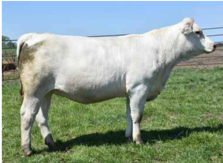
LCC TEXAS BELLE 1749 ET SELLS AS LOT 86