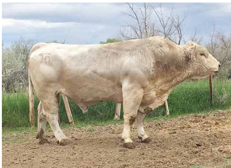
BHD KINCSEM B629 SIRE OF LOT 94 ET BULL CALF