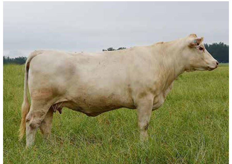
BAMBOO MS ALIE SMOKE DAM OF LOT 24